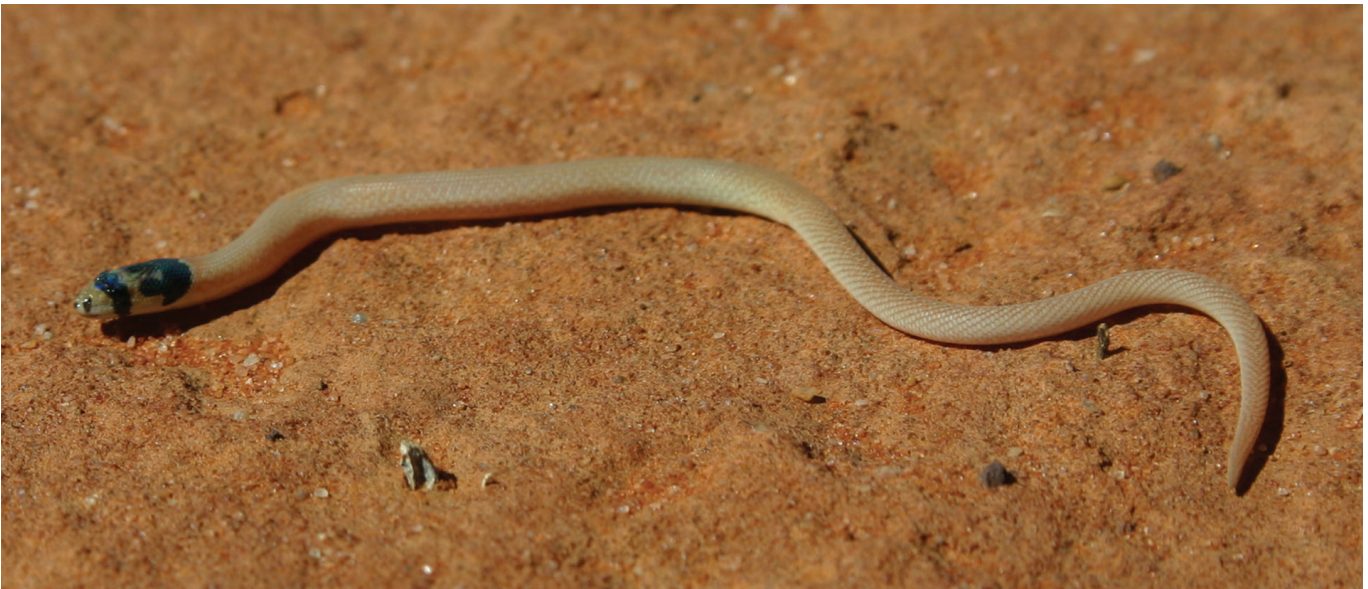
Figure 2. Juvenile Pygopus nigriceps from Sturt National Park, NSW.

scales, and 125 ventral scales between the mental and the small pore-bearing precloacal scales. An image of this specimen is featured in the field guide to reptiles of NSW (Swan et al. 2017).