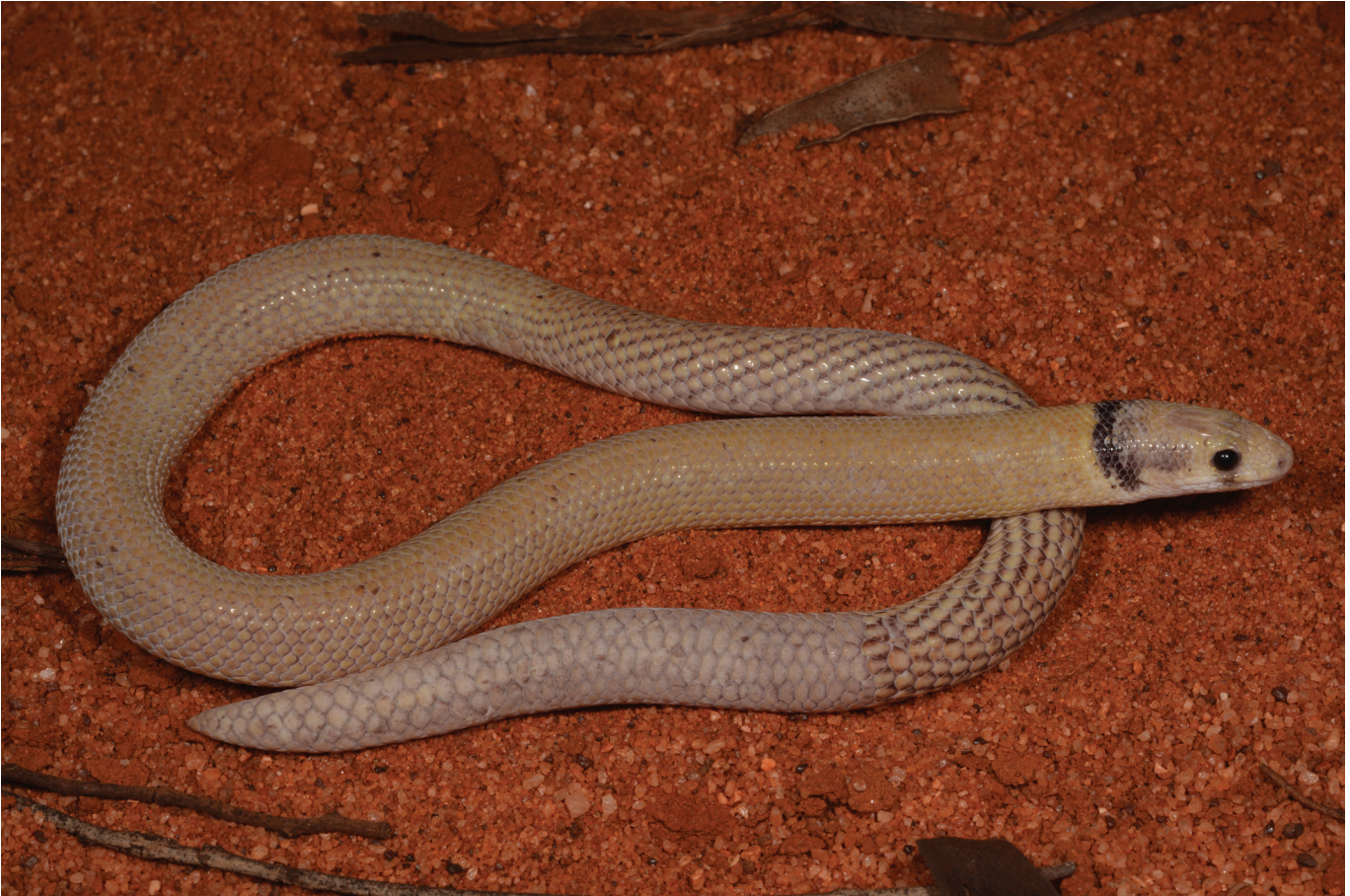
Figure 1. Adult Pygopus nigriceps from Winnathee Station, NSW.