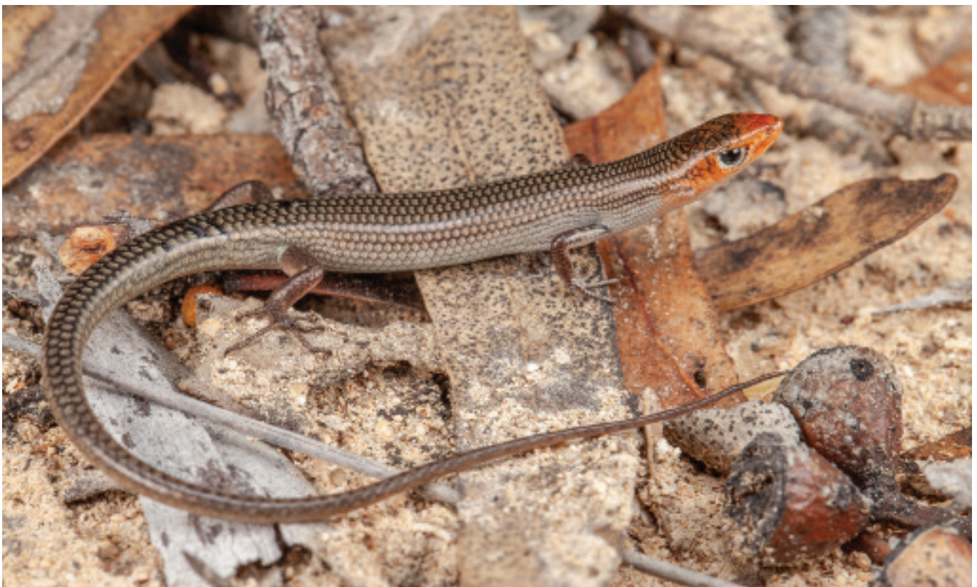
Figure 1. Adult male P. reginae in life. Note characteristic bronze-olive dorsal colouration contrasted by vibrant orange head.

At 16:28hrs on 20 August 2019, an adult-sized P. reginae (Figure 1) was located beneath the base of a spinifex hummock Triodia angusta and atop the underlying soil at Shothole Canyon, Cape Range National Park, WA,