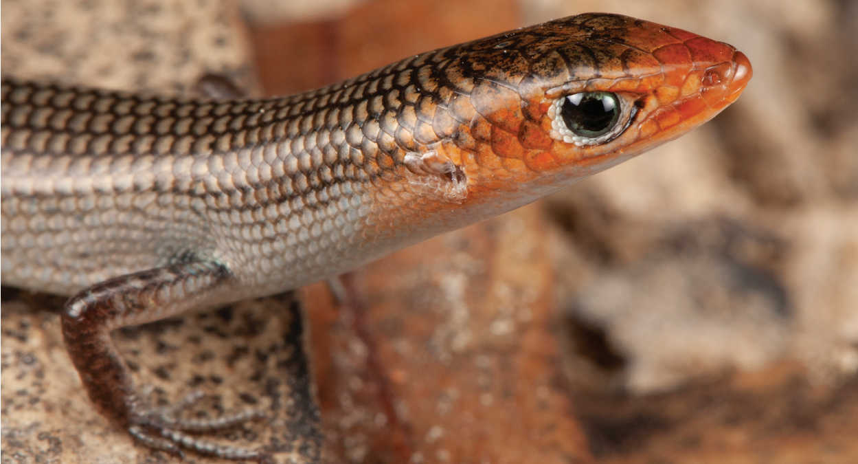
Figure 2. Lateral aspect of head of male P. reginae in life. Note presence of four supraocular scales and exfoliating skin surrounding tympanum.

the head and throat, and its small size (34 mm SVL and 0.71g total weight prior to preservation) (Wilson and Swan 2017). The colouration of the head and gular region was indicative of it being a reproductively active male (Wilson and Swan 2017) that was also undergoing ecdysis as patches of exfoliating skin were evident (also seen in Figure 2). The specimen was collected and lodged in the Western Australian Museum (WAM) where it is registered as R165479.