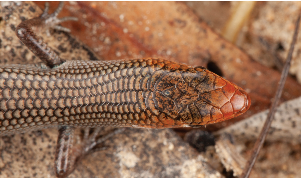
Figure 3. Dorsal aspect of head of male P. reginae in life. Note divided frontoparietal scales.