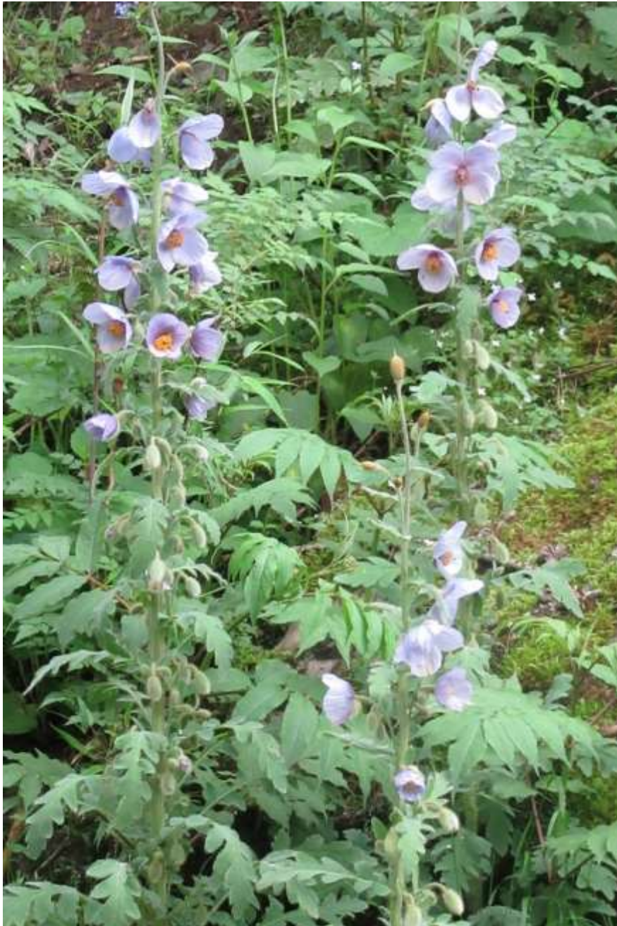
The wonderful Meconopsis wilsonii subsp. wilsonii .

Further North, Zheduo Pass to the West of Kangding is on a main route to Western China. With its litter-strewn road and ugly pylons, disgusting toilets and loud, smoky vehicles the pass itself isn't pretty. However, at a height 4200 metres it is an amazing starting point for looking for alpine plants. We found Meconopsis integrifolia subsp. integrifolia , another with large, yellow flowers, growing between the rocks and the alpine sub-shrubs and in great profusion over the mountainside. Appearing through the mists and rain the plants looked amazing. We also found Meconopsis henrici , a vivid small blue flowerer abundantly contributing to the tapestry of flowering plants.