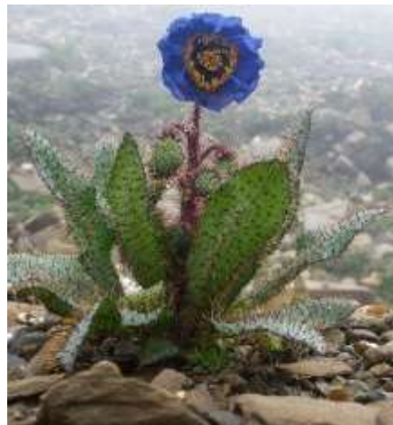
Meconopsis balangensis var. balangensis