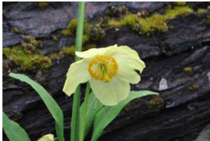
Meconopsis sulphurea .

Close by we also found our first 'large yellow poppy' type of Meconopsis . These, in the series Integrifoliae , are characterised by being monocarpic, high alpine dwellers. They are dramatic, imposing and exciting. Growing between two logs at a height of around 3600 metres, where the plants were protected from the grazing of yaks, we found a small population of Meconopsis sulphurea . This plant is identifiable by its upright form and the nodding poise of its flowers which notably have a distinct slender style. It was concerning that perhaps due to overgrazing this was the only population we found in the valley.