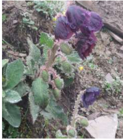
Meconopsis balangensis var. atrata