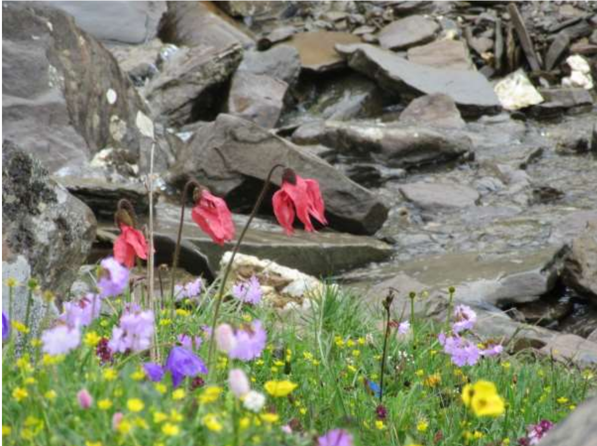
An Alpine meadow including Meconopsis , Corydalis and Primula , on Balang Pass