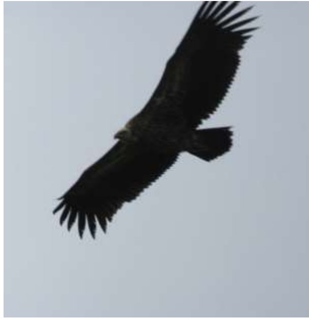
Left hand photo a form of Meconopsis integrifolia on Jianjin Pass- a plant aptly known as the lampshade poppy. Right hand photo a Himalayan Griffon on the Pass

Over the next couple of days, we explored the Balang pass (height 4500 metres) and again found Meconopsis , in even greater variety. The yellow-flowered one growing here in great numbers was Meconopsis integrifolia subsp. souliei . Meconopsis punicea was growing throughout and we also found Meconopsis balangensis var. balangensis , a squat, monocarpic plant with spiny leaves, bold blue flowers and yellow stamens, characteristically in a central cluster with an outer ring. Another stately blue-flowered plant we were to find on the mountains was Meconopsis pulchella , with its nodding, four-petalled flower posture. There was also one plant of a white form, which doesn't appear to have been reported before. Meconopsis quintuplinervia was the final Meconopsis that we were to identify. A close relative of Meconopsis punicea , this has narrow, nodding, mauve-blue flowers, and the few plants that we saw were much more robust than those that we know in cultivation. One would also hope to find the cross between the two, Meconopsis × cookei , in this area though alas we didn't.