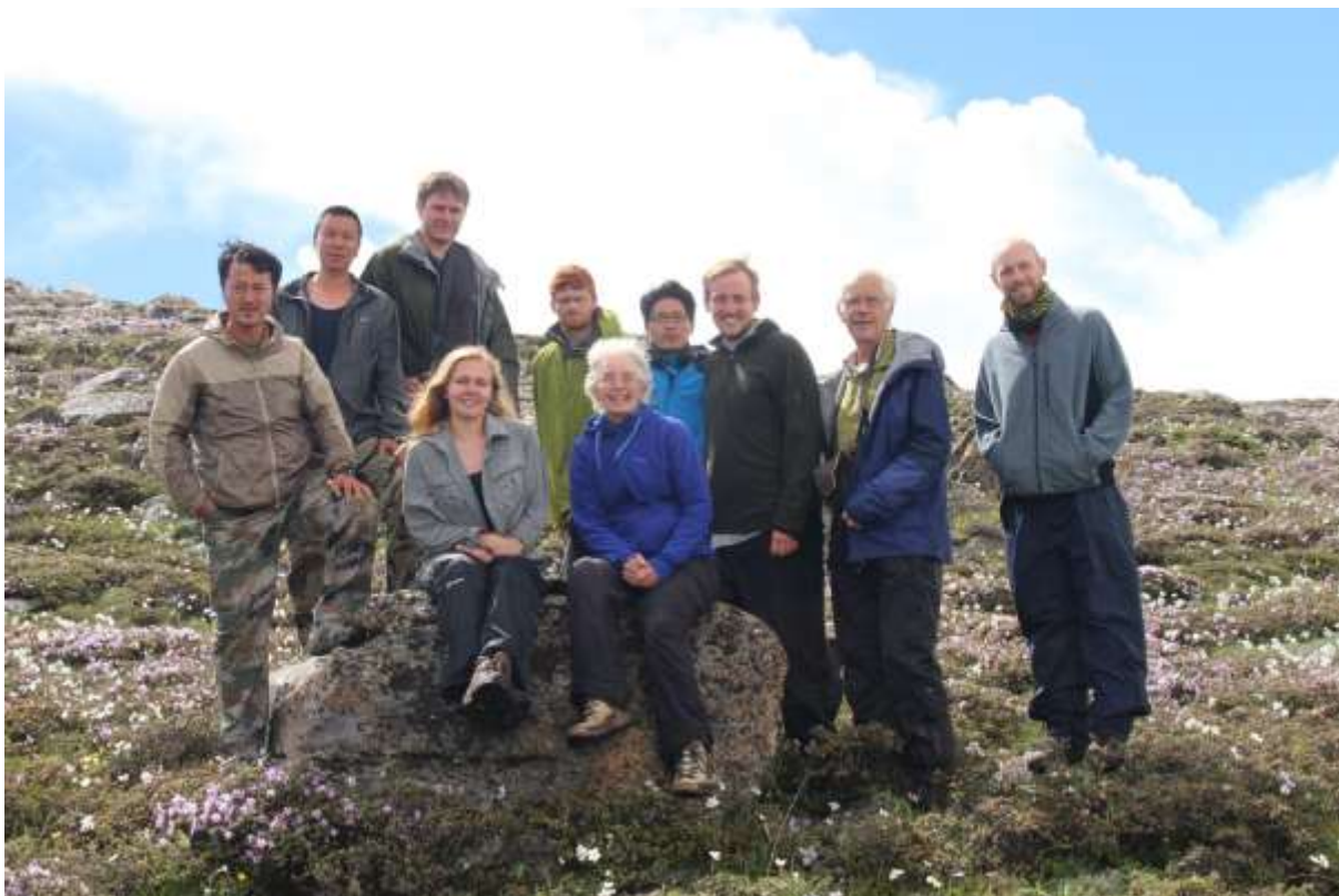
Our expedition party on the alpine meadows just North of Zheduo Pass. The author is on the right

A botanical trip is based on plants and discovery. As I can't thank the plants for being there in the first place I would like to thank my fellow travellers for helping me to discover the valleys, passes, meadows and forests of Western China. The imparting of information of the most botanically diverse locations and the identification of the plants has greatly increased my botanical knowledge. More than this my fellow travellers contributed to the experience and gave me a deep perspective of this wonderful region. I am grateful for their great company. I would like to thank the sponsors of our visit; the SRGC, Stanley Smith and most importantly the Merlin Trust. The latter organisation has helped me to experience this region twice now and left me with wonderful memories of wild landscapes that I will never forget. I have learnt far more about plants in the wild, the ecology and diversity of China and in particular the genera Primula and Meconopsis than I knew before. This information will be invaluable in my career and for my horticultural understanding.