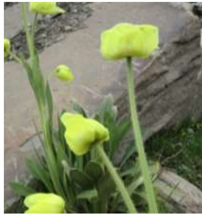
Meconopsis integrifolia subsp. Integrifolia