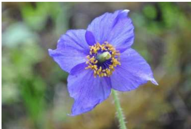
Meconopsis delavayi, named after the prolific 19th-century plant hunter, missionary and explorer Jean-Marie Delavay.

The first place where we actually found Meconopsis was in Ganheba, a vast glacial valley Northwest of Lijiang. This amazing place with imposing views leading to the dominant Jade Dragon Snow Mountain to the West is truly breath-taking. Here we saw Meconopsis delavayi , one of the many plants named after the famous plant hunter, growing next to the path into the valley, at an altitude of around 3200 m. With its simple purple-blue flowers growing in the open scrub this was a pretty introduction to the genus on our expedition. We also found the distinctive Meconopsis rudis which, though not in flower, could be identified by bristles on the leaves with red blotches at their base.