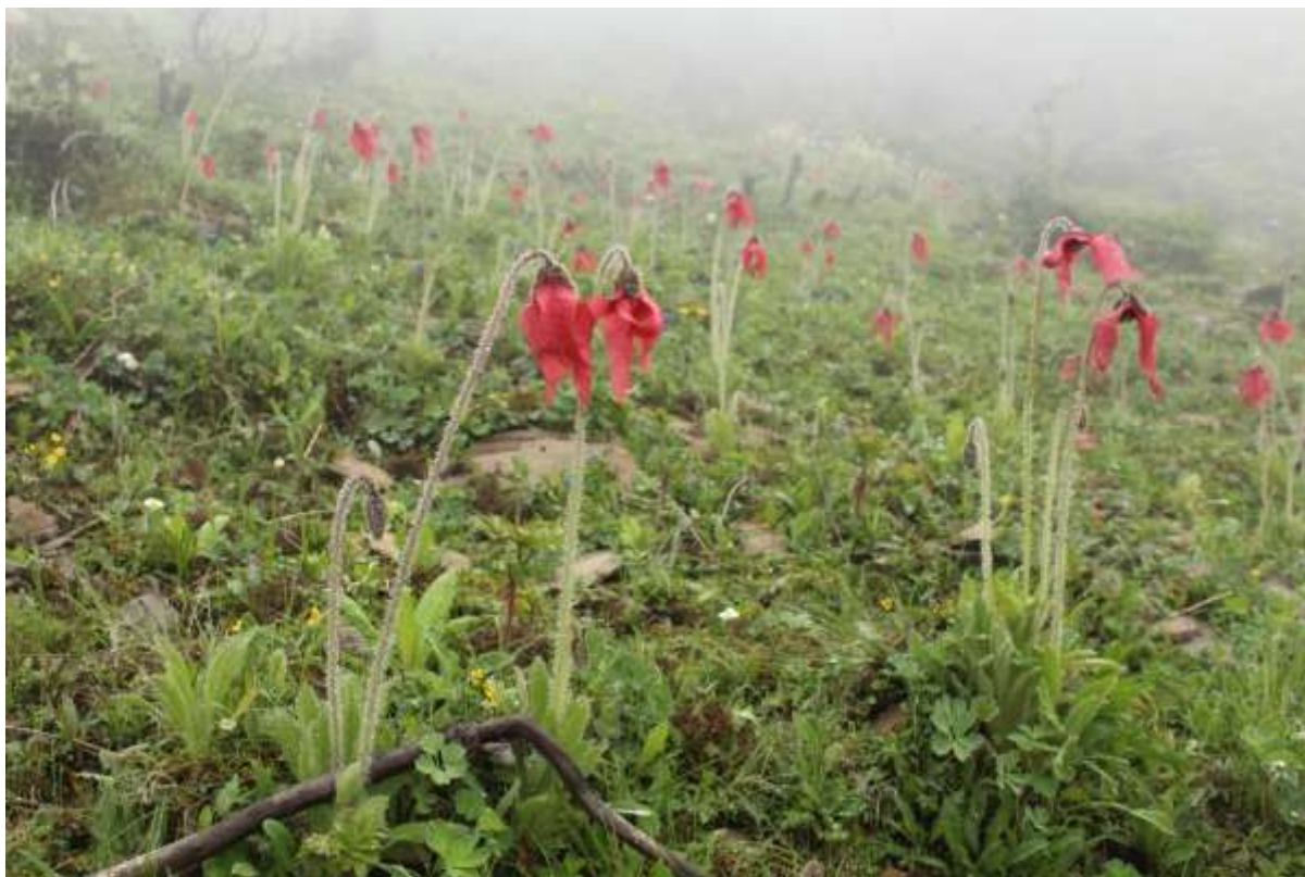
Meconopsis punicea on Jiajin Pass.

It would be impossible to talk about all the themes that punctuated our expedition; the great many varieties of plants and conservation issues we came across impacted us greatly. In this report, I have chosen to talk about one of the botanical highlights we were to study; the genus Meconopsis .