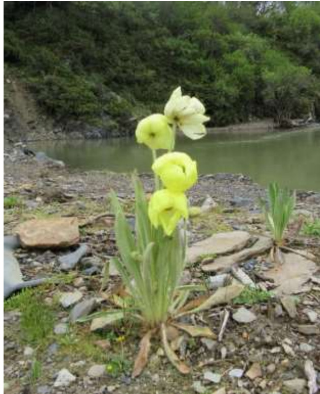
Meconopsis lijiangensis growing in the rubble!

Our next Meconopsis experience wouldn't be for another week but it was well worth the wait. After we had travelled North and East into Sichuan province we visited an isolated wooded valley leading into large mountains to the West. This was near to a village called Yele between Liangshan and Garze. The villagers' hay meadows were vibrant with the colours of flowering plants and butterflies, and higher in the valley this led into grazed and then pristine forest. It was in this forest, at around 3000 metres, that we saw what we were looking for – Meconopsis wilsonii subsp. wilsonii . What a magnificent treat! These tall woodland plants with light purple flowers were growing quite contentedly by bamboo at the fertile stream-side. Here they were growing in abundance at a height of up to two metres. From one viewpoint, it was possible to see dozens of them stretching up the valley side. We later learnt that there were three locations where our group had discovered the plant in this valley system, including one found by our driver, who had strolled less than a mile even from the car! We noted another unidentified Meconopsis , with slender leaves, tall stems and narrow seed pods, but this was not in flower. We also found Meconopsis heterandra in leaf but not in flower. This latter species is very local to this area and was only described in 2009.