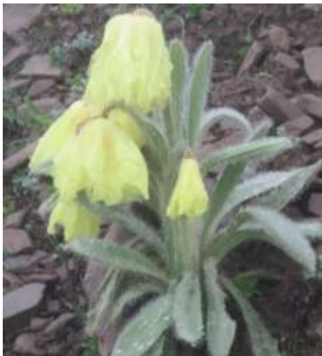
Meconopsis integrifolia subsp. souliei