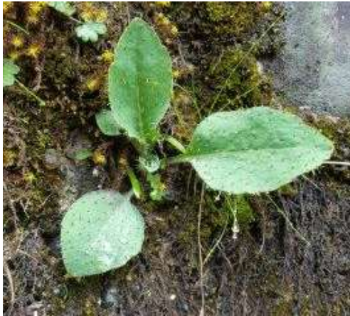
Meconopsis cf. heterandra