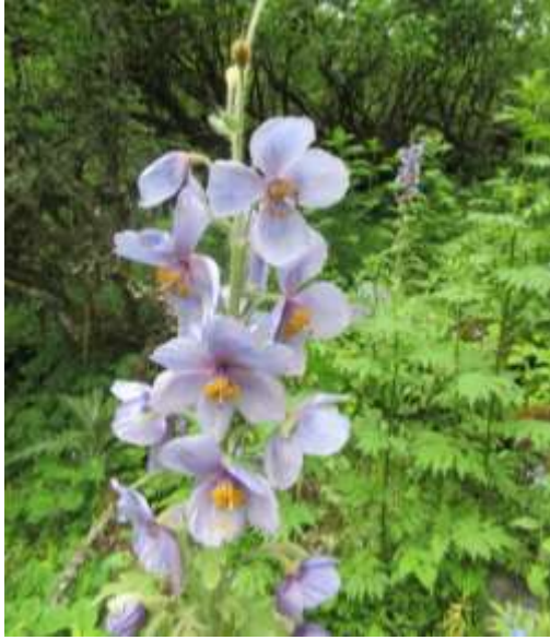
Meconopsis wilsonii var wilsonii