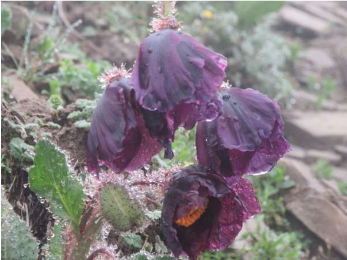
Meconopsis balangensis var. atrata .

Nearby we found another example of the bright yellow Meconopsis integrifolia , this time squatter with hanging flower heads, looking very different to the plants we had seen previously. We aren't completely sure what this was. Perhaps there are morphological differences between the plants depending on the pass on which they are growing. If this is the case, then there could be many more varieties than are presently described. Looking at this particular plant, I could understand how Meconopsis integrifolia received its common name of lampshade poppy. There was also Meconopsis pulchella , a blue Meconopsis , found again later on the Balang pass. So this day ended with bold reds and yellows, blacks and blues, purples and whites – vibrant and wonderful colours of Meconopsis through the mists.