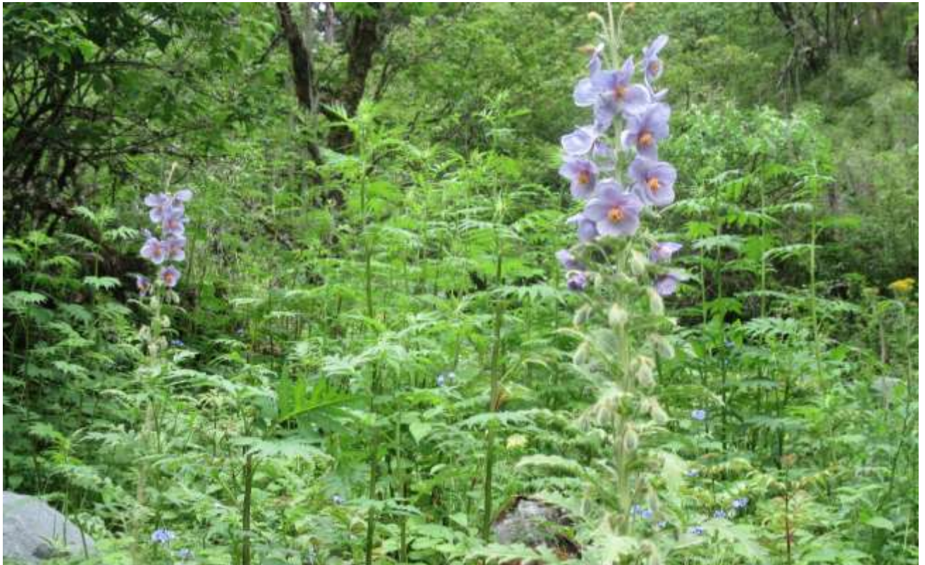
Meconopsis wilsonii var wilsonii stretching into the distance

It seems limiting to talk about only one genus on an expedition where we discovered many hundreds of species of plant; more than our experienced guides had found during their many previous expeditions even! Though this report has concentrated on Meconopsis I hope that by describing them in relation to where they were found I have revealed a touch of the magic of those landscapes. We were immersed in a vast wilderness that plants contribute to, and in which in turn contributes to the creation of species of plant. The knowledge that we never found everything there was to be found on a mountain or in a valley, that we were always on the edge of discovery or rediscovery, or when the marvel of nature revealed itself to us; it was these times which were life affirming and unforgettable. The visit has broadened my knowledge of plants and the natural world and has given me new friends and unforgettable experiences. I am lucky to have been and am grateful to the Merlin Trust for the opportunity.