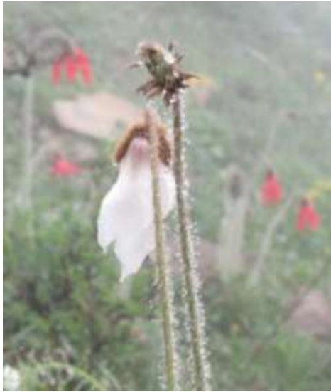
Meconopsis punicea forma albiflora