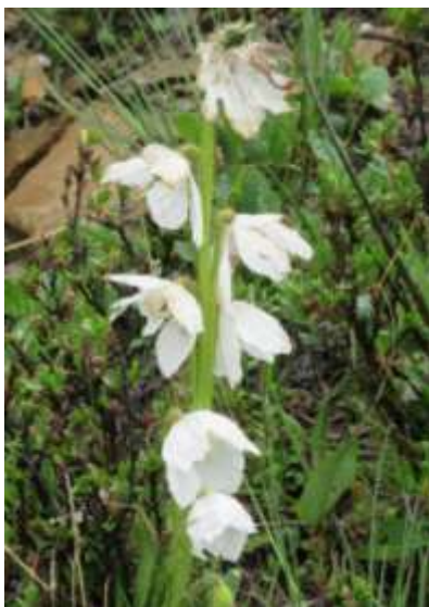
Meconopsis pulchella var. albiflora