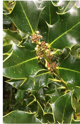
Male plant in winter (without berries but remnants of male flowers)