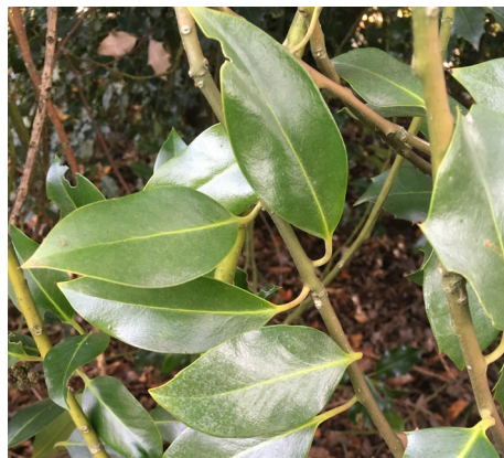
Mature leaves (note less spines and smoother leaf margins)