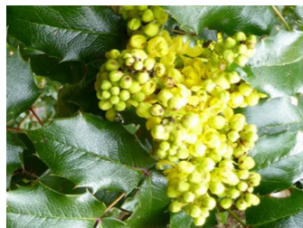
Mahonia aquifolium Tall Oregon grape