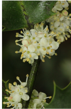
Male flowers (with 4 long stamens)