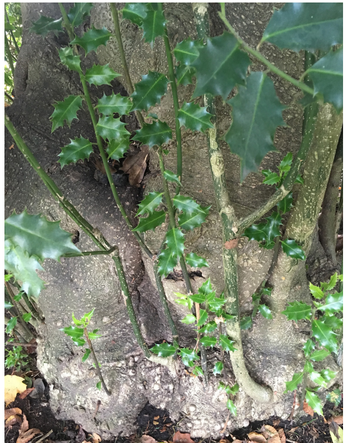
Suckering from the base of a large English holly tree

English holly leaves produce flammable vapour when heated, causing them to ignite easily, and infestations may pose a fire risk (King County Noxious Weed Control Program, 2018). The prickly leaves can hinder human activity around English holly infestations.