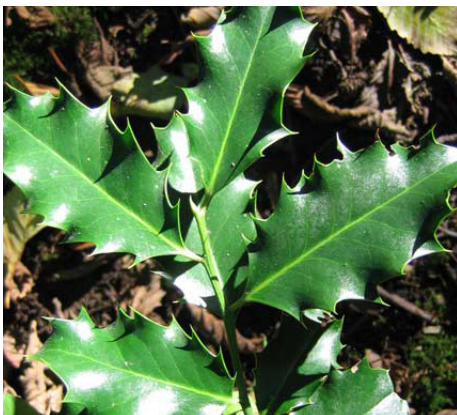
Typical spiny holly leaves

The following photos show English holly plant parts.