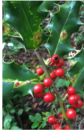
Female plant in winter (with berries)