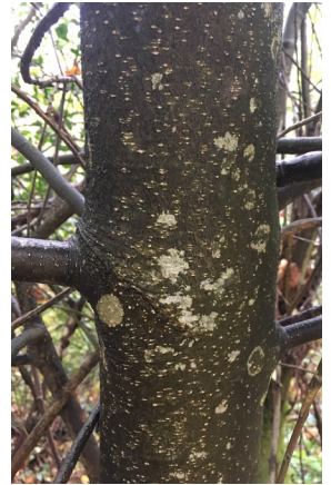
Bark of a mature holly tree (white spots are lichen)