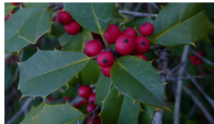
Ilex opaca American holly