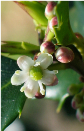
Female flowers (with large green ovary in the middle)