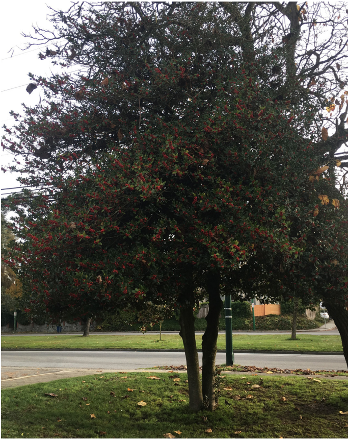
Holly tree with lower branches removed