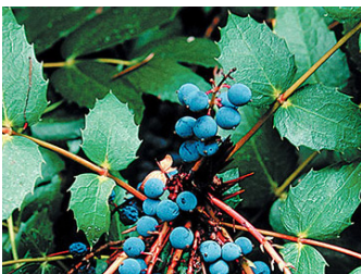
Mahonia nervosa Dull Oregon grape

English holly is commonly mistaken for varieties of the genus Mahonia (Oregon grape). There are 2 native Mahonia species in the Metro Vancouver region, M. nervosa and M. aquifolium (Klinkenberg, 2017) – both have blue berries with alternate, evergreen, pinnate leaves with less prominent spines than English holly leaves.