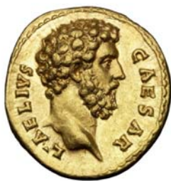
Aureus with the bust of Aelius Verus, Roman, gold, AD 137

BOSTON, MA (September 20, 2012)—Five hundred ancient Greek and Roman coins from the world-renowned collection of the Museum of Fine Arts, Boston (MFA), will be showcased in the new Michael C. Ruetters Gallery for Ancient Coins, to debut on September 25. It is the only gallery dedicated to coinage in a major US art museum and is unique for its emphasis on ancient coins as works of art—masterpieces on a miniature scale. The gallery will also illustrate how coins are both a form of cultural expression—reflecting the customs, beliefs, and ideals of those who produced and used them—and primary documents of ancient history. It is named in recognition of Michael C.