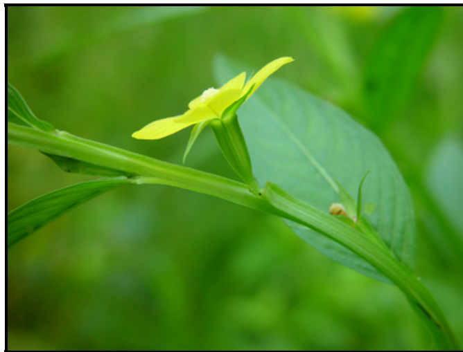
Ludwigia decurrens Walt. (Wing-Leaf Prinrose-Willow)