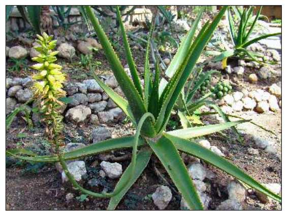
Figure 4. Aloe bernadettae from southeastern Madagascar is a Data Deficient species that used to be common, but has now seemingly become scarce.

All species of Aloe [except for A. vera (L.) Burm.f] appear on the Appendices of the Convention on the International Trade in Endangered Species of Wild Fauna and Flora (CITES). This means that trade in aloes is controlled to prevent utilisation that would be incompatible with their survival. Of the 21 aloe species listed on Appendix I (CITES, 2014), a total of 17 are Malagasy species. This is an indication of the huge threat