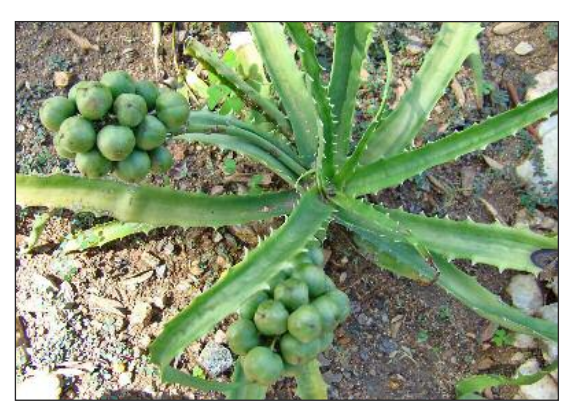
Figure 6. Aloe ivakoanyensis is a berried aloe described in 2012 from the Ivakoany Massiff in southeastern Madagascar and was assessed as Critically Endangered at the time.

To assemble all the necessary data from herbarium collections, visits were made to various herbaria including the National Herbarium, Pretoria (PRE), and those of the Botanical and Zoological Park of Tsimbazaza (TAN) and the Royal Botanic Gardens, Kew (K). For those herbaria where important Malagasy specimens are held and that could not be visited, available data were downloaded through the Global Biodiversity In-