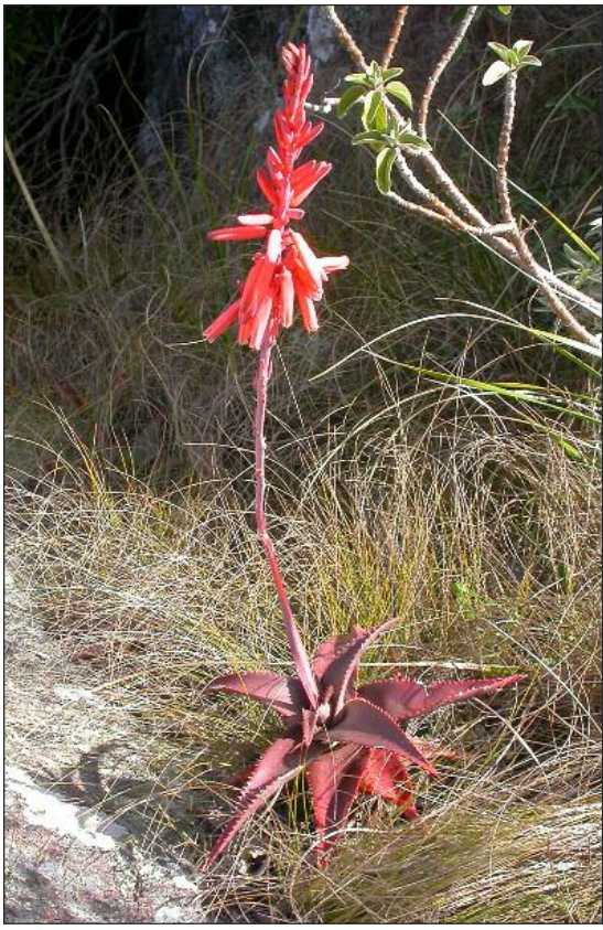
Figure 7. Aloe madecassa is endemic to the Antananarivo region in east-central Madagascar and is here assessed as Vulnerable.