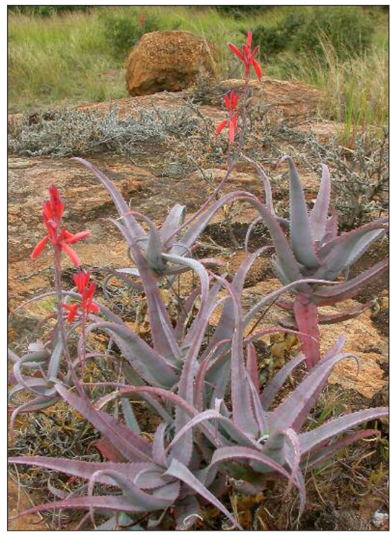
Figure 9. Aloe newtonii from south-central Madagascar is named after Prof. Len Newton. It is here assessed as Endangered.

owing to several factors, but the most common is the fact that few botanists collect aloe material as it demands more preparatory treatment and takes a lot of time to make proper herbarium specimens of these fat-leaved plants. A total of 69% of Madagascan aloes in the DD category are only represented by the type specimen. These include taxa that have been newly described since the 1990s and also a few that have not been collected for more than 100 years. The remaining DD aloes are known from only one or two localities and CAT are thus unable to calculate EOO and AOO values. For the first group, the DD status can easily be explained by their recent discovery and the fact that only a few collections have been made since. However, the problem remains for aloes that were described long ago, but where collection numbers are two or less. These taxa might be very rare, extinct in the wild or access to the populations is very difficult [e.g. Aloe prostrata (H.Perrier) L.E.Newton & G.D.Rowley].