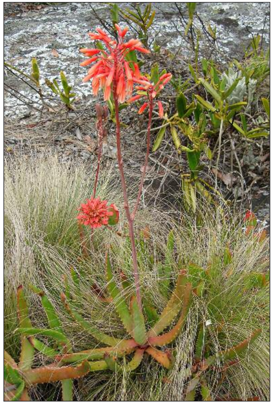
Figure 5. Aloe hoffmannii from central Madagascar is only known from the area of its type locality and is assessed here as Critically Endangered.