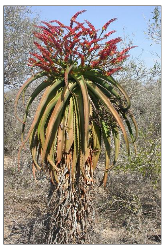
Figure 11. Aloe vaotsanda from southern Madagascar is here assessed as Vulnerable. The stems of this aloe are used in the construction of huts.