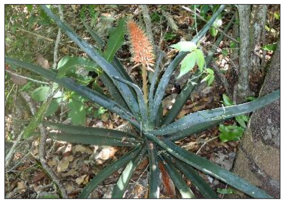
Figure 8. Aloe namorokaensis from northwestern Madagascar is a Data Deficient species that is only known from the type locality.

Data from a total of 1630 collections were assembled and compiled into a Botanical Research