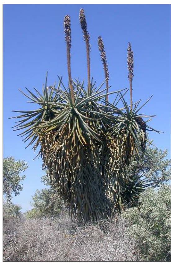
Figure 1. Aloe suzannae from southern Madagascar is one of only two Madagascan aloes currently included in the IUCN Red Data List. It is listed as Critically Endangered.

tersuchungen dieser "Data Deficient"-Taxa sowie umfassende Einschätzungen des Gefährdungsstatus' aller madagassichen Aloen. Diese Resultate ergeben die Grundlage für die Prioritätensetzung bei Schutzprojekten für Aloe sowie die Gegenden, in welchen sie vorkommen.