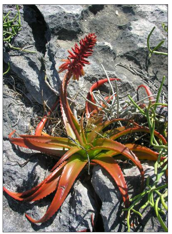
Figure 10. Aloe suarezensis from the Antsiranana region in northern Madagascar is the only Madagascan aloe with fine hairs on the flowers and pedicels. It is here assessed as Endangered.

The difficulty of assessing taxa with few specimens or only old material is a frequent problem and may be relevant to as much as 20% of the world's plant diversity. If all these taxa are assessed as DD, then the result would be a huge un-