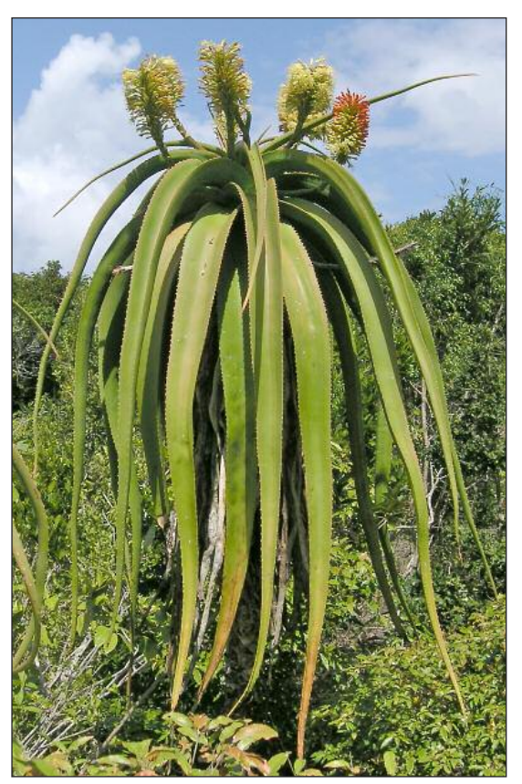
Figure 2. Aloe helenae from southeastern Madagascar is currently listed as Critically Endangered on the IUCN Red Data List.