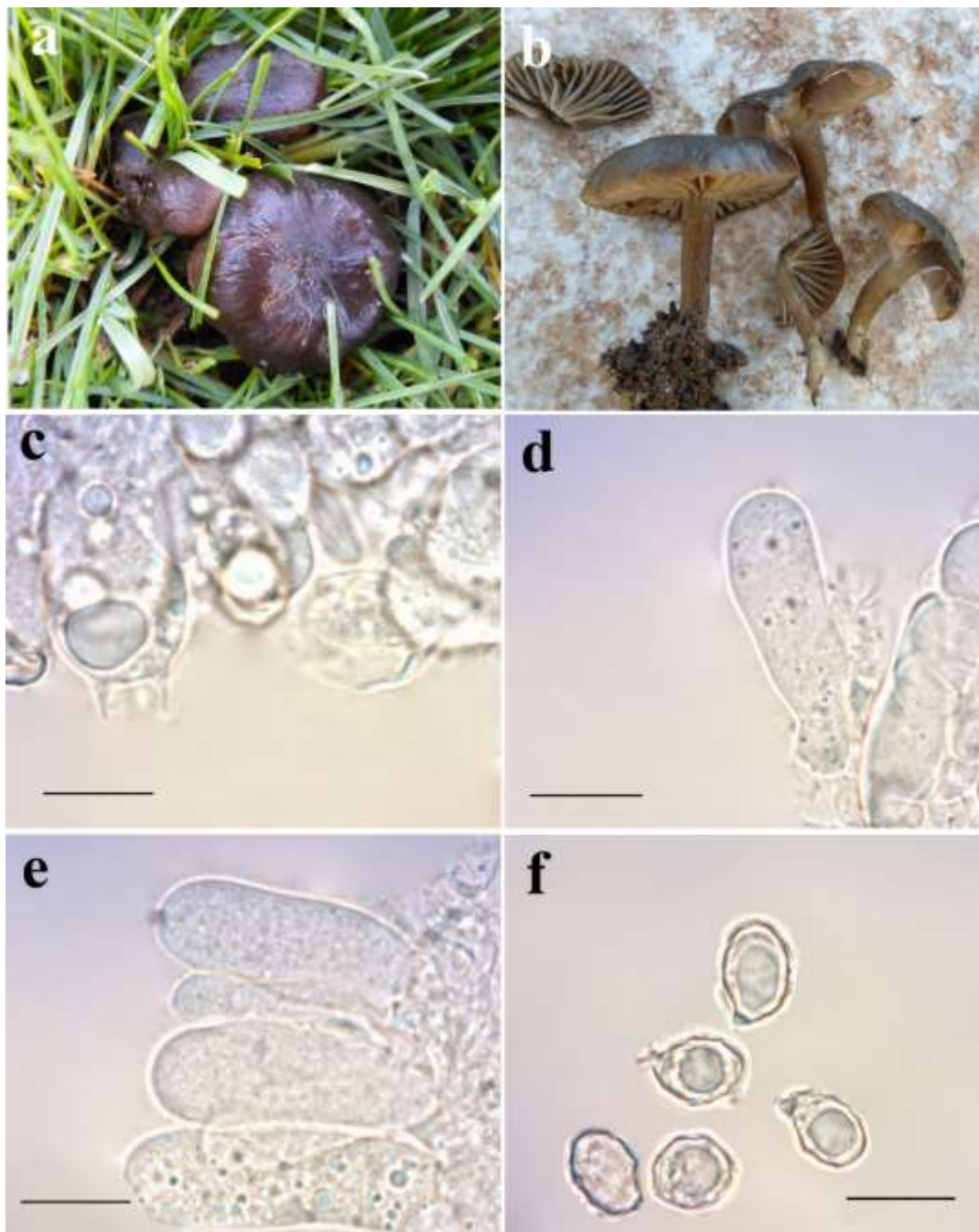
Fig. 2. Entoloma undulatosporum : a-b, Basidiocarp; c: Basidia; d and e: Cystidia; f: Basidiospores. Scale bar: 10 μm.

Specimens examined: IRAN, Kermanshah province, Mele Nai, 1206 m, E46° 03' 44", N34° 05' 51", 12 February 2016, leg. E. Seidmohammadi, (IRAN 16981F).