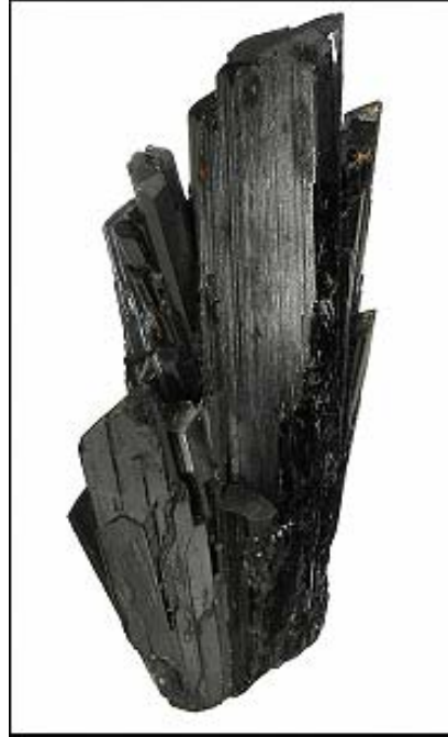
Hübnerite, 8 cm, from the Himalaya mine, Mt. Illimani, Murillo Province, La Paz Department, Bolivia.

Cassiterite from the Viloco mine, Loayza Province, La Paz Department, is a long-known classic, but the crystal groups shown here are chiseled-looking, brilliantly lustrous, and not as black as they appear at first glance: strong backlighting reveals a beautiful yellow-brown gemminess within. By contrast, a new Bolivian item—from a July 2009 find—is hübnerite from the Himalaya mine, Mt. Illimani, Murillo Province, La Paz Department. Although ferberite, the iron end-member of the wolframite group, is common in Bolivian mines (and many fine examples are here, from both the Siglo XX and Tasna mines), hübnerite is a rarity from Bolivia. The Mineral Classics specimens have been confirmed analytically, and some crystals indeed show red internal highlights when strongly lit, pegging them as the manganese end-member. The fans of subparallel bladed crystals of hübnerite range up to cabinet size.