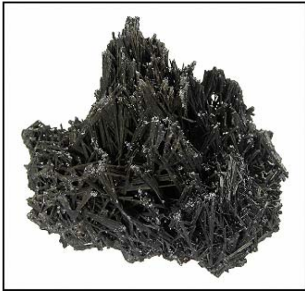
Zinkenite, 5.8 cm, from the San José mine, Oruro city, Cercado Province, Oruro Department, Bolivia.