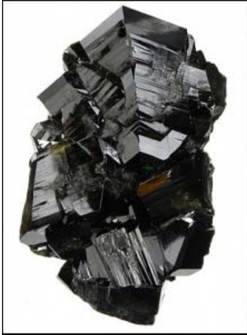
Cassiterite, 6.8 cm, from the Viloco mine, Loayza Province, La Paz Department, Bolivia.