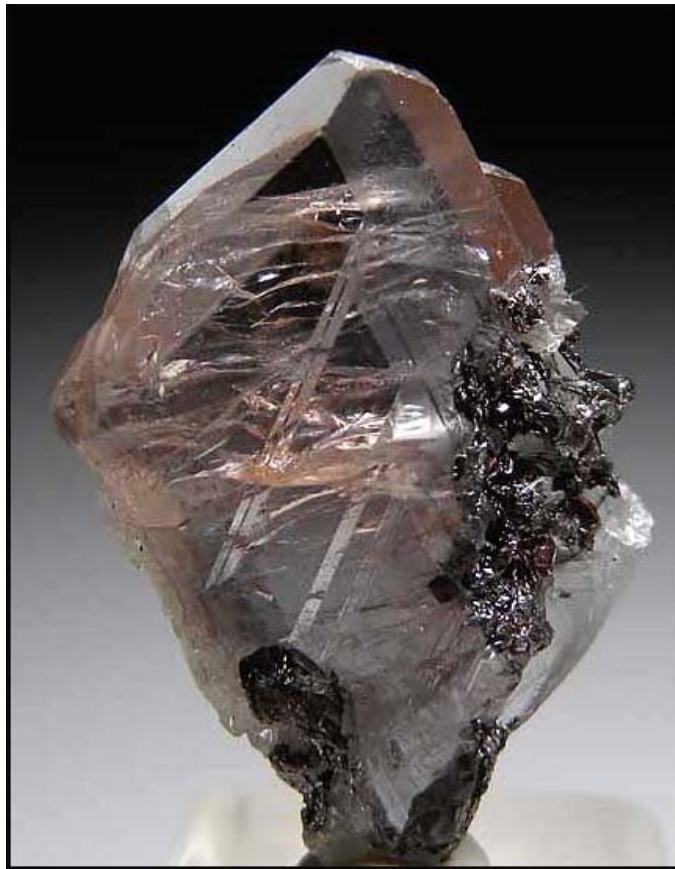
Magnesioaxinite, 1.9 cm, from Merelani, Arusha Region, Tanzania. Marin Minerals specimen and photo.