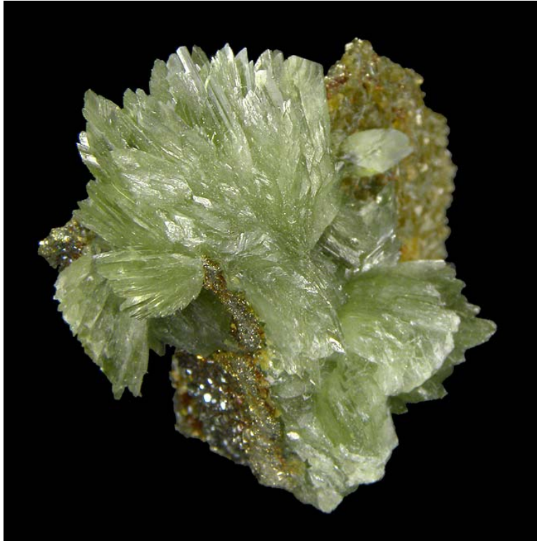
Ludlamite, 3.2 cm, from the Huanuni mine, Huanuni, Dalence Province, Oruro Department, Bolivia. Mineral Classics specimen and photo.

Wire silver is now emerging from the Porco mine, Agua de Castilla, Quijarro Province, Potosí Department—a silver mine which dates back to Spanish Conquistador times and is still busily producing ore. You might recall that in the last couple of years a few superb, thumbnail-size stephanite specimens from the Porco mine reached the market. None of these appear on the present update (though you may find them in earlier parts of the Mineral Classics site); but there are two specimens of Porco mine pyrargyrite which are nicely transparent in crimson red and (as they say) promising for the future. Meanwhile the silver specimens are loose, medium-thick, curved wires to a few centimeters long, and one specimen shows two 11-cm wires rising from a bit of gray (acanthite?) matrix.