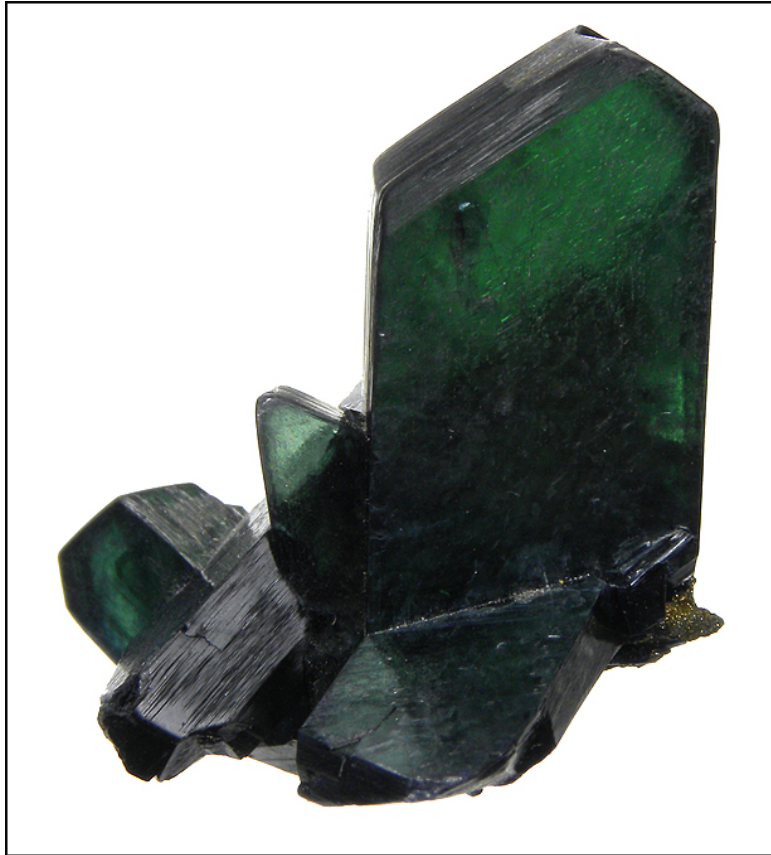
Vivianite, 3.4 cm, from the Morococala mine, Santa Fe district, Dalence Province, Oruro Department, Bolivia.