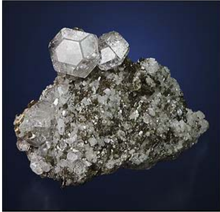
Fluorapatite, 4 cm, from Val Giuv, Tujetsch, Graubünden, Switzerland. Watzl Minerals specimen and photo.