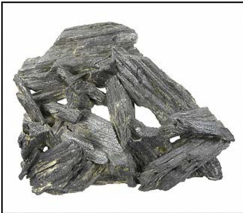
Bismuthinite, 10 cm, from the Tasna mine, Nor Chichas Province, Potosí Department, Bolivia.