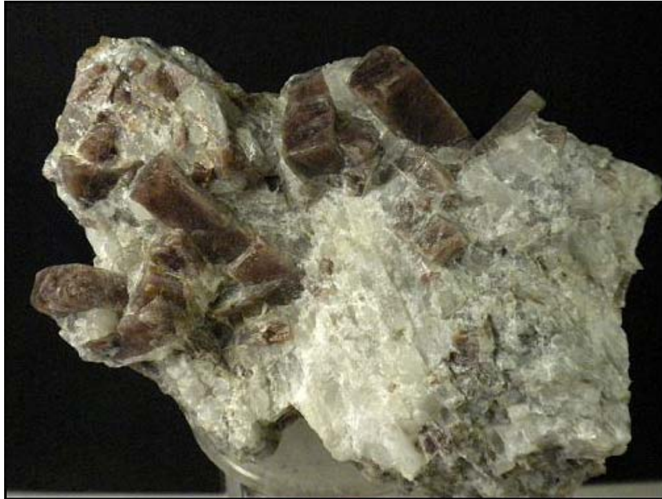
Andalusite in quartz, 10 cm, from the Bregaglia Valley near Chiavenna, Lombardy, Italy.