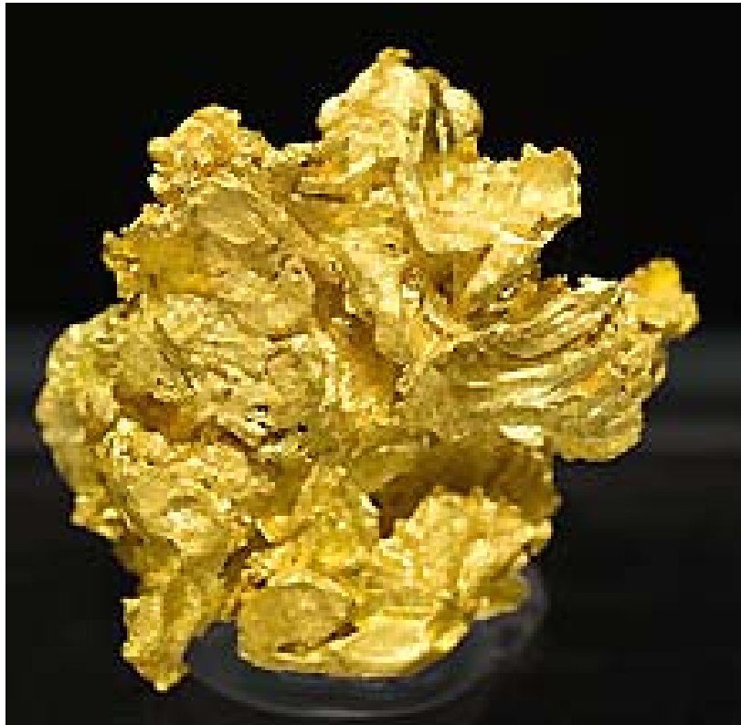
Gold, 1.9 cm, from Linglong, Jiaodong Peninsula, Shandong Province, China.

Thetford Mines, Quebec (see the pertinent article in the July-August 2009 issue). Found only once, at some time between 1996 and 1999, at Lac D’Amiante, suolunite comes as botryoidal masses with individual botryoids composed of densely packed microcrystals; the masses have sparkling surfaces and are deep purplish blue to pale lilac. The Joyce specimens, originally acquired by Charles Key, are hunky, almost-pretty items of this description, the largest measuring nearly 9 cm across. I have seen only one other lot of Lac D’Amiante suolunite specimens for sale—from the Canadian dealership Tyson’s Minerals , which brought the lot to the 2002 Tucson Show.