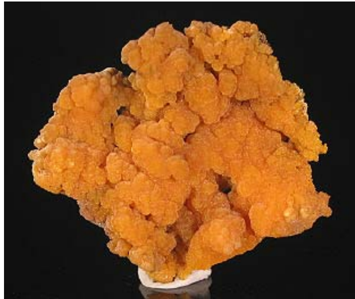
Mimetite, 4.8 cm, from the Nakhlak mine, Anarak district, Isfahan Province, Iran. Khyber Mineral Company specimen and photo.