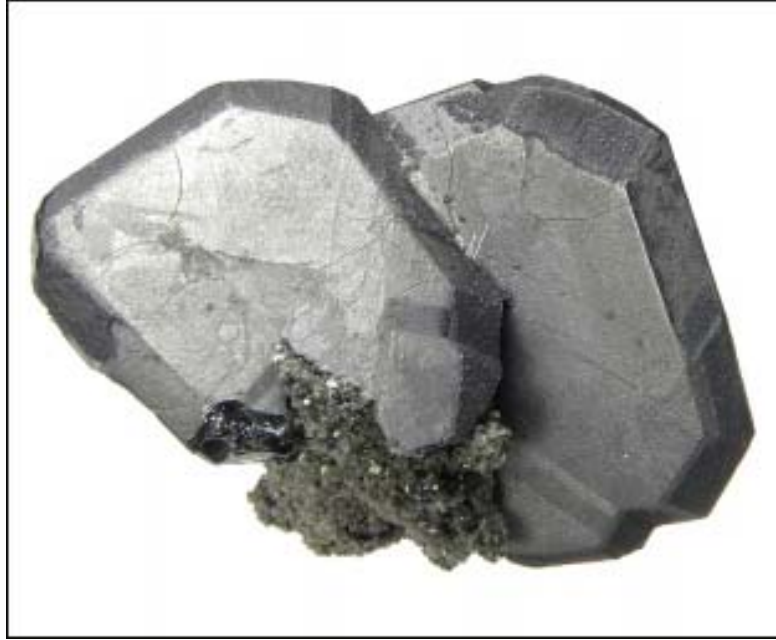
Bournonite, 3.1 cm, from the Viboras mine, Machacamarca (Colavi) district, Potosí Department, Bolivia. Mineral Classics specimen and photo.