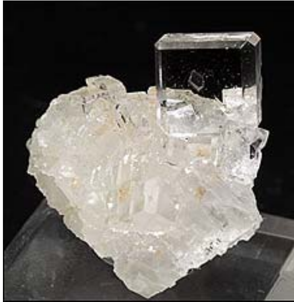
Fluorite, 2.8 cm, from Cantera Llamas, Duyos, Caravia, Asturias, Spain.

Also, in his post-Ste.-Marie-aux-Mines update of late July, Jordi has a few specimens from a new discovery of fluorite made in February of this year in the Cantera (quarry) Llamas, Duyos, Caravia, Asturias, Spain. The fluorite crystals, which reach 1.5 cm on edge, are lustrous, extremely sharp cubes with minor dodecahedral faces, colorless to pale blue-violet and totally transparent; they make thumbnail and miniature-size groups which are all fluorite as well as specimens to cabinet size showing well individualized, pellucid pale violet crystals resting on platy rock matrix. These specimens are something truly new in Spanish fluorite: probably more will appear, but will they be as pretty as those already with Jordi??