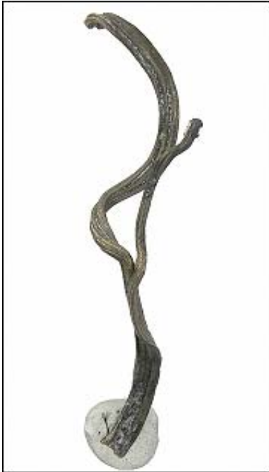
Silver, 6.8 cm, from the Porco mine, Agua de Castilla, Quijarro Province, Potosí Department, Bolivia. Mineral Classics specimen and photo.