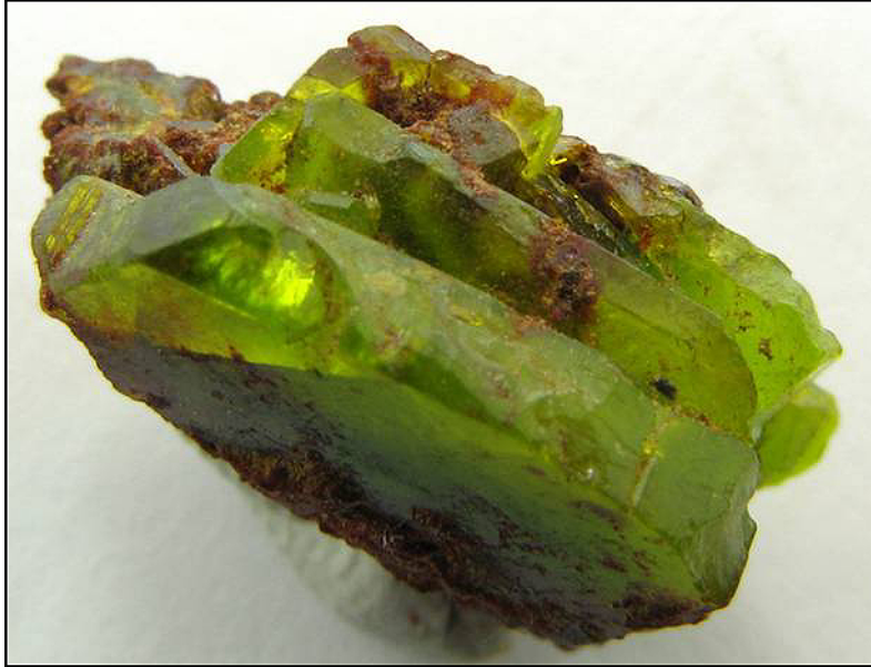
Despujolsite, 1.5 cm, from the N'Chwaning III mine, Kuruman manganese field, Cape Province, South Africa.

magnesioaxinite crystals are without associations, but a couple of them feature clinging bits of white calcite and metallic black graphite. The subtle colors range from a celestial grayish pale blue to purplish blue through grayish to pinkish brown, and all of the crystals are lustrous, sharp-edged and totally gemmy. For gem-crystal fanciers they must rank as top prizes, being very elusive (far more so than tanzanite crystals) in today's marketplace.