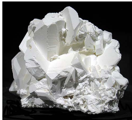
Tincalconite pseudomorph after borax, 17.6 cm, from the Baker mine, Kramer borate deposit, Boron, Kern County, California.

They call it “ deep summer,” and by mid-August, I’d say, I’m out of my depth, or at least I feel so when necessity brings me outdoors to flail about in the hot bath of monsoon season in Tucson. Much better to be coolly ensconced in my office, coolly checking out mineral sites on the web and counting the days until Denver (and, beyond it, Munich, in cool astringent Bavarian late October). The mineral pickings online these [dog] days are still a bit slim, but that makes discoveries all the more fun; let me tell you about a few I’ve been making.