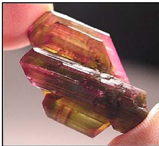
Liddicoatite, 3.4 cm, from near Ibity, Antananarivo Province, Madagascar.