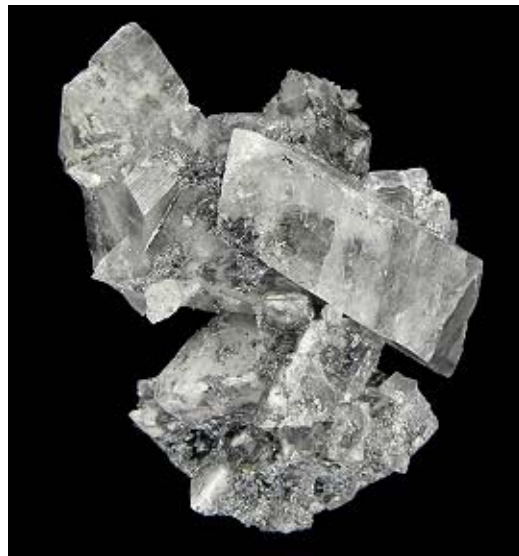
Augelite, 2.8 cm, from the Machacamarca (Colavi) district, Potosí Department, Bolivia.