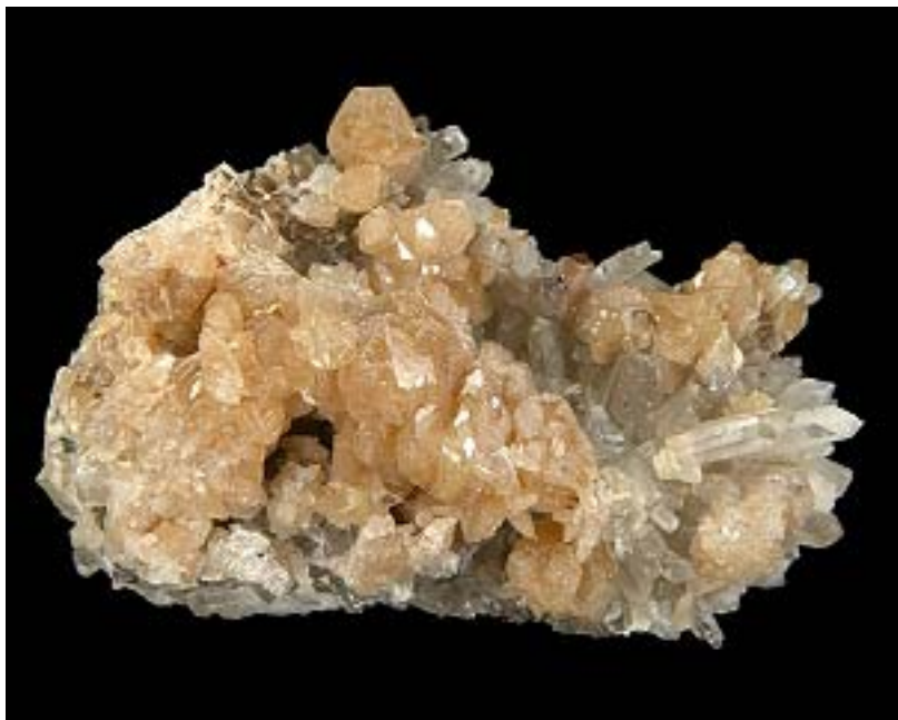
Monazite-(Ce), 3.3 cm, from the Siglo XX mine, Llallagua, Bustillo Province, Potosí Department, Bolivia.

The massive update also offers fine specimens of stibnite from the La Salvadora mine, Oruro Department (found in the early 1980s); boracite crystals to 1 cm, some pale green and others peach-colored, in gray matrix from Alto Chapare, Cochabamba; copper in great, loose fans, resembling ginkgo leaves, to 10 cm, from Corocoro (found early in 2011—see also the 2011 Tucson Show report); phosphophyllite and hopeite from the new occurrence in the Huayllani mine, Machacamarca; magnetite from Cerro Huañaquino, Potosí (brilliant black octahedrons scattered on matrix plates to 12 cm); siderite , some specimens showing gemmy yellow-brown crystals to 2 cm, from several localities; and, among the Bolivian oddities, scorzalite , arsenopyrite , metastibnite , sphalerite and pyromorphite . Whew.