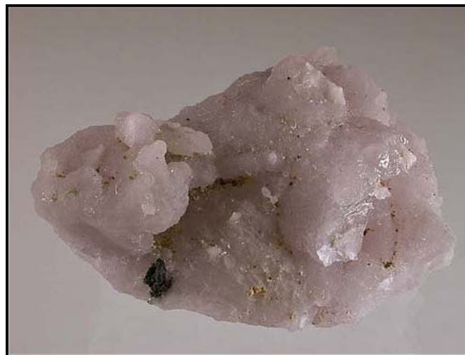
Suolunite, 6.8 cm, from the Lac D’Amiante mine, Thetford Mines, Quebec.