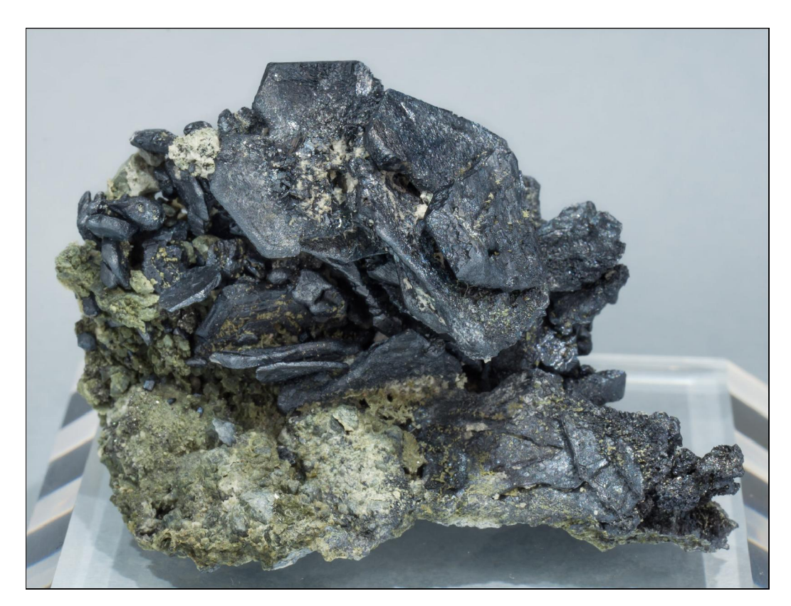
Djurleite/Chalcocite, 5.6 cm, from the Aït Ahmane mine, Bou Azzer district, Ouarzazate, Morocco. Fabre Minerals specimen and photo.