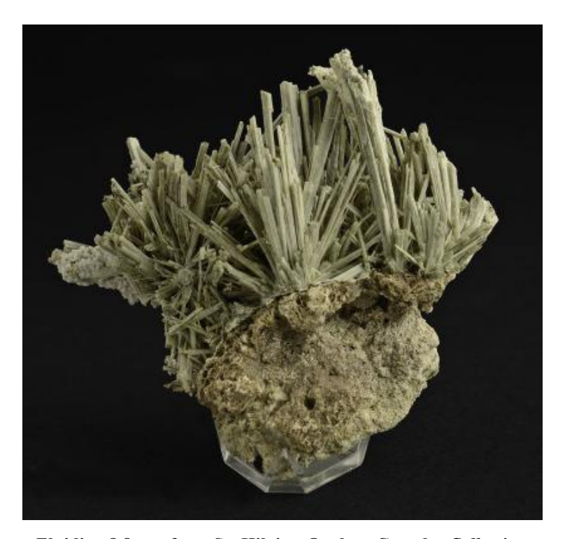
Elpidite, 8.8 cm, from St.-Hilaire, Quebec, Canada. Collection Arkane specimen and photo.