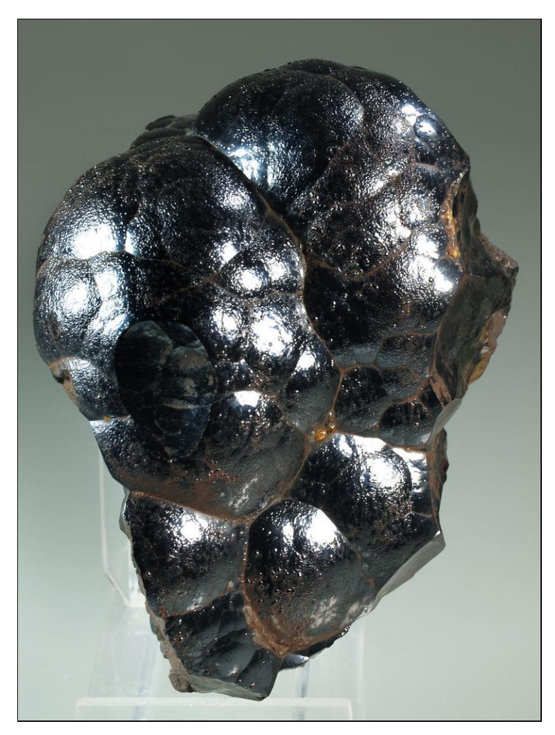
Hematite, 9.8 cm, from the Piquín farmhouse property, Cordobá, Spain.

Last time, I had good things to say about the new website—created in 2016—of Collection Arkane (collectionarkane.com), headquartered in the village of Mont St.-Hilaire, Quebec. With that mailing address it's hardly surprising that the dealership has about 75 splendid pieces from the St.-Hilaire quarries, newly posted together with other Canadian and some worldwide things. There are—among the standard St.-Hilaire species—first-rate analcime, serandite, siderite, aegirine, natrolite and rhodochrosite, but Collection Arkane 's large new specimens of leifite and elpidite are especially impressive. The white, rounded clusters of radiating, short-prismatic crystals of leifite from St.-Hilaire are priced much higher than almost anything else (save the most extreme rarities) from the locality: the 8.8-cm specimen shown here costs $900. But the best elpidite specimen now on the site, exactly the same size as the leifite, costs only $225, and it presents extremely well, with satiny gray-green, stalk-like crystals making for crossing fans that rise from like-colored matrix.