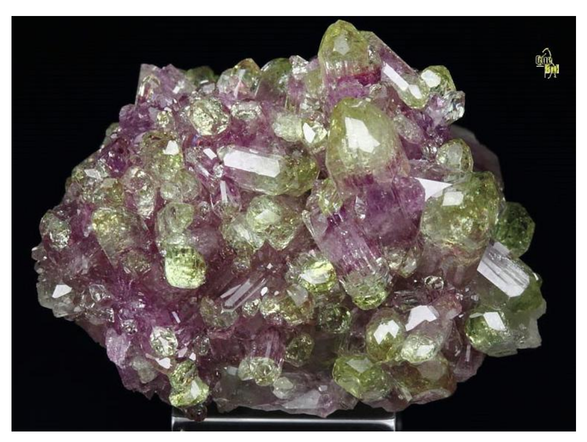
Vesuvianite, 2.7 cm, from the Jeffrey mine, Asbestos, Quebec, Canada.

Another Canadian dealership, Quebul Fine Minerals (quebulfineminerals.com), updates its pages almost every day, and these pages are characterized by excellent photos of mostly small (TN to miniature), mostly contemporary, mostly "aesthetic" specimens from every which place—although here again there's a certain emphasis on Canada. This is the site to go to for beautiful little things from the Jeffrey mine, Asbestos, Quebec: the enormous asbestos mine closed for good at the outset of this millennium, but long before that it had become famous for its world-class prehnite, pectolite, diopside, vesuvianite and gemmy orange grossular specimens. Examples of all of these are getting much rarer and more expensive than they once were, but Quebul can sell you lovely thumbnails for prices under $200, as for both specimens shown below. The green-purple color zoning on vesuvianite crystals from the Jeffrey quarry is a beautiful thing to behold, and on the grossular specimen shown here, for its part, there are uncommon associations of bright green diopside and clinochlore.