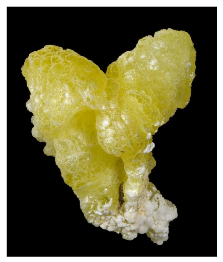
Brucite, 6 cm, from the Killa Saifullah district, Balochistan, Pakistan.