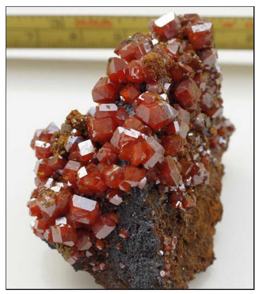
Wulfenite, 5.7 cm, from the Stone Crack mine, Kuruktag Mountains, Xinjiang Uighur Autonomous Region, China.

It always feels good to pass on word of new websites in these reports. You are hereby notified that a new site called Minerals Bulgaria (mineralsbulgaria.com) has come to cyberland, and it offers many pages of good specimens from the mines of the Madan orefield, in the Rhodope Mountains of southern Bulgaria. What's more, nearly all of these specimens of pyrite , galena , sphalerite , quartz , Mn-rich calcite , etc. bear what you could call bargain prices, e.g. the handsome pyrite miniature shown here costs just 15 British pounds (the dealership is based in London), which is to say about $18. If you are a haunter of the major shows to which two or three Bulgarian dealers come regularly, you might find this online dealership's offerings rather similar; but, of course, the Madan mineral suite is limited in the first place. The pyrite, galena, and especially the "cleiophane" sphalerite often reach world-class quality, and specimens of these common sulfides from Madan, even when not world-class, are typically lustrous and tend towards drama. You might want to keep visiting this site as it matures, especially if you come seldom or never to big international shows.