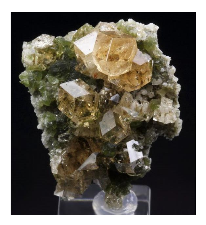
Grossular with diopside and clinochlore, 2.6 cm, from the Jeffrey mine, Asbestos, Quebec, Canada.

One of the major new mineral occurrences whose very best known specimens debuted at the 2017 Tucson Show features intergrown djurleite and chalcocite from the Aït Ahmane mine, Bou Azzer district, Tazenakht, Ouarzazate Province, Morocco. I repeat, the very very best of these specimens came to Tucson, whence they were brought by Christophe Gobin (of Dubai Gems ), and in our May-June 2017 issue you'll find text and a photo to back up that very very best claim. Right now, however, there are some fine specimens of the same material offered by Jordi Fabre of Fabre Minerals (fabreminerals.com), these miniature-size pieces showing very sharp, slightly edgehoppered, pseudohexagonal, thin-tabular crystals to 2.4 cm vertically bunched on matrix. The copper sulfide is, of course, metallic black, and not highly lustrous, but what's remarkable is the size and the excellent form of the crystals, unprecedented for djurleite and exceptional even for the much commoner chalcocite. Jordi has posted just three specimens, and Christophe didn't have many more than that, but stay tuned, for actually this material has been trickling out from Bou Azzer for two or three years now, sometimes labelled djurleite and sometimes chalcocite (according to Christophe, repeated testing has shown that djurleite predominates). The Aït Ahmane mine is currently active, so more specimens may well be forthcoming...you can start doing your homework on what they look like by visiting Jordi's site.