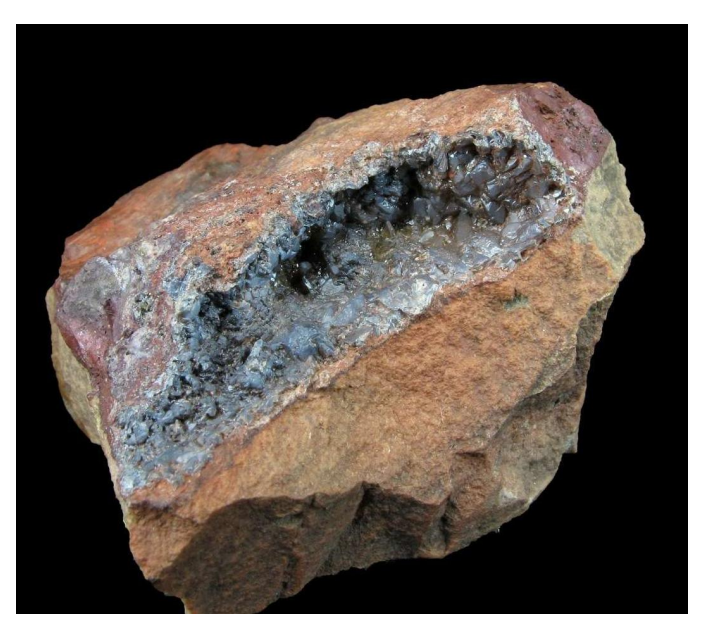
Calomel, 4.8 cm, from Moschellandsberg, Rheinland-Palatinate, Germany. The Arkenstone specimen and photo.

And in the Old European Classic department we have this matrix specimen of calomel from the ancient mercury mines at Moschellandsberg in the Rheinland-Palatinate, west-central Germany. Cinnabar, native mercury, and of course the Ag/Hg alloy species moschellandsbergite came once upon a time from these little mines, but specimens of well crystallized calomel from Moschellandsberg are even rarer than those of the other mercury minerals, and are among the world's best for the species: