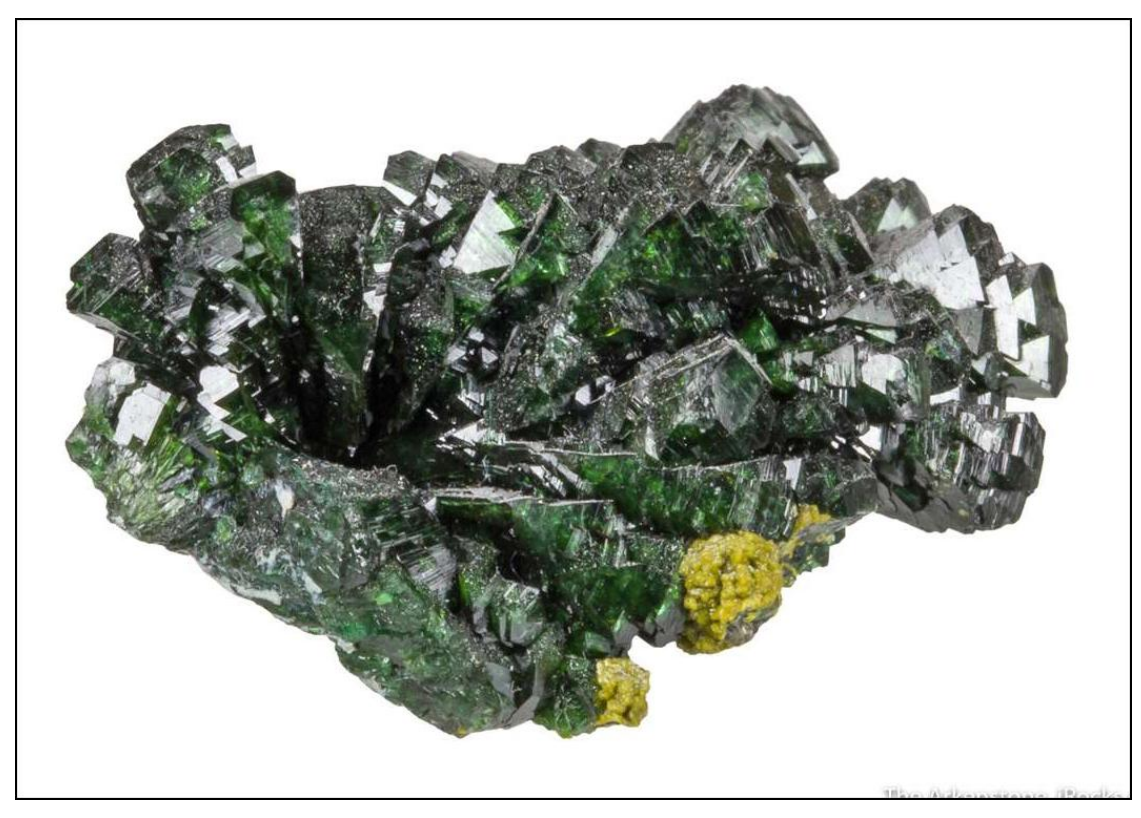
Olivenite with gartrellite, 2.9 cm, from Tsumeb, Namibia.

We are not yet finished with the website of The Arkenstone , for March 13 saw the posting there of a very extensive "Tsumeb gallery," prepared by Rob's helper Jeff Starr. In all there are 1,865 Tsumeb specimens here, most of them at or near top-quality level, and in shown in gorgeous photos. There are, of course, example after example of the usual Tsumeb suspects (calcite, smithsonite, dioptase, cerussite, anglesite, willemite...), but additionally there are fine mimetite specimens from the 1971 "gem pocket," several of the best tennantite specimens I have ever seen, abundant medium-rarities such as tsumcorite, ludlockite and bayldonite, and, in short, enough Tsumeb desiderata to keep you gawking your way through a long afternoon. Most of the specimens on the later pages are already marked "sold," but I show you here two very exceptional thumbnails, an olivenite/gartrellite and one of the finest extant examples of the absurdly rare iron arsenate schneiderhöhnite.