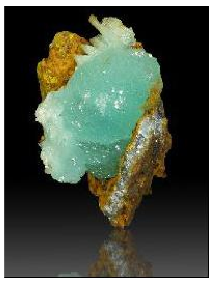
Cu-rich adamite, 2.7 cm, from the Hilarion mine, Lautium, Attika, Greece.

Christos Spiromitros has a January 10 "New Year's update" of assorted good things from Laurium and from elsewhere in Greece on the ever-interesting site of Greek Rocks (greekrocks.com). There are, as usual, many colorful secondaries from the ancient Laurium mines, and a very desirable and distinctive thumbnail in this category is the copper-rich adamite from the Hilarion mine shown here. Christos writes that this specimen is from an old German collection, but lately, I'll note, the Laurium mines have produced other green and blue adamites much like this one, though few as fine.