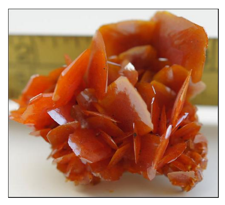
Wulfenite, 2.8 cm, from the Stone Crack mine, Kuruktag Mountains, Xinjiang Uighur Autonomous Region, China.

wulfenite did. In any event the specimens which fill page after page on "wulfenites.com" are, at their best, the peers of nearly all of the best classic wulfenites from Arizona, Mexico, Tsumeb or the Congo. Check out three of them here: