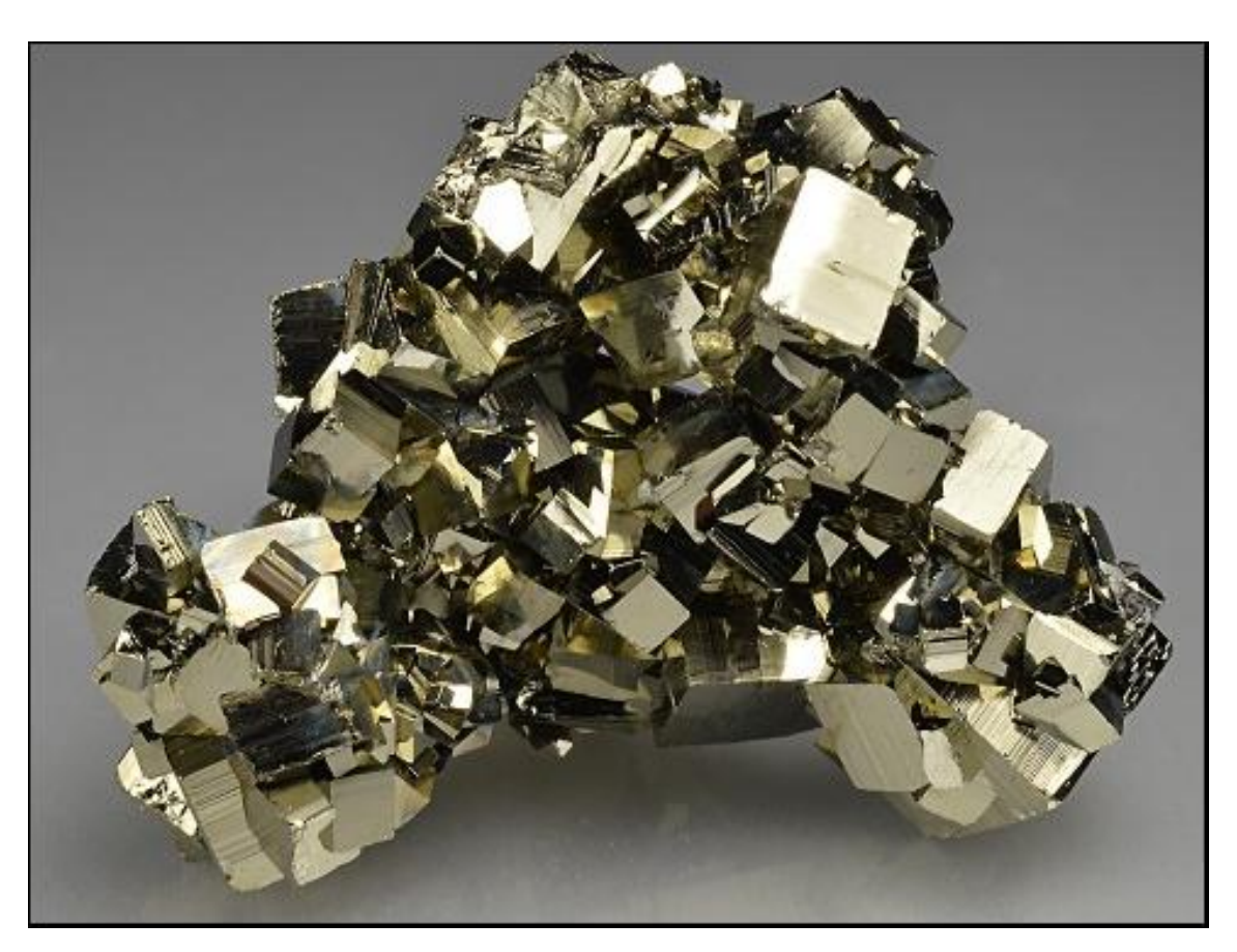
Pyrite, 3.7 cm, from the Krushev Dol mine, Madan ore field, Rhodope Mountains, Smolyan Oblast, Bulgaria.