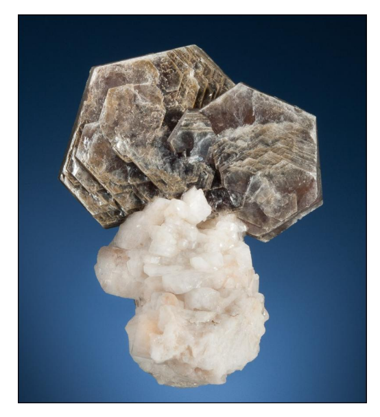
Muscovite on albite, 5.2 cm, from Mantena, Minas Gerais, Brazil. McDougall Minerals specimen and photo.

Noteworthy, too, on the McDougall Minerals site are some miniatures with sharp, silvery brown "books" of muscovite perched on albite, from Mantena, Minas Gerais, Brazil, and four very good thumbnails of the rare Mn-Sn-Ta oxide wodginite , from a pegmatite occurrence somewhere in the Linópolis district, Divino das Laranjeiras, Minas Gerais: