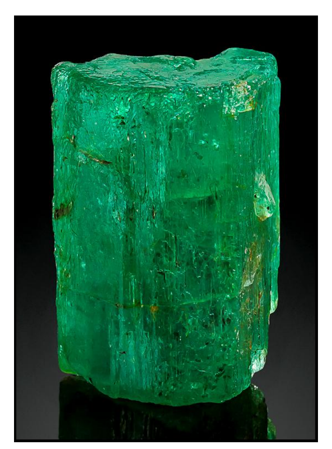
Emerald, 4.5 cm, from Kenticha, Kenticha pegmatite field, Seba Boru district, Sidamo-Borana Province, Ethiopia. Exceptional Minerals specimen and photo.

T_{ m hat} will do it for now—enjoy your summers, all!