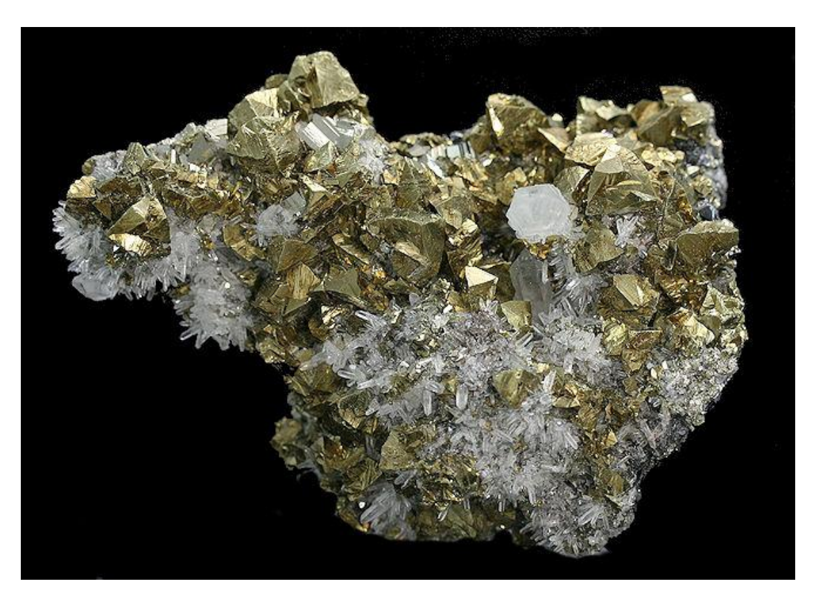
Chalcopyrite, 10.5 cm, from the Boldut mine, Cavnic, Maramures, Romania.