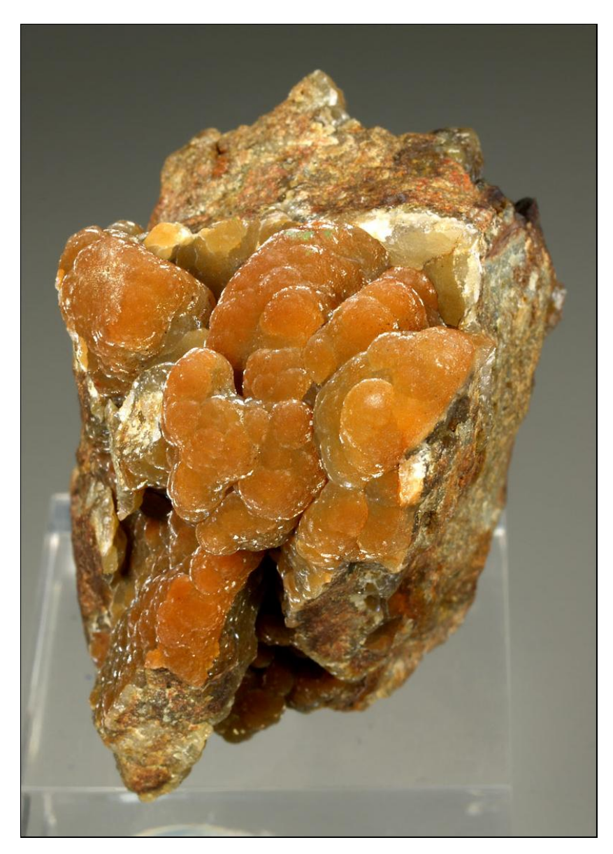
Smithsonite, 5 cm, from the San José quarry, Portman, La Unión, Murcia, Spain.

from a few recent Spanish occurrences. For example there are three very pretty specimens of orange smithsonite from a find in April 2014 in the San José quarry, Sierra de Cartagena-La Unión, Portman, La Unión, Murcia. These are sparkling mammillary aggregates of orange-brown microcrystals of smithsonite filling vugs in matrix: