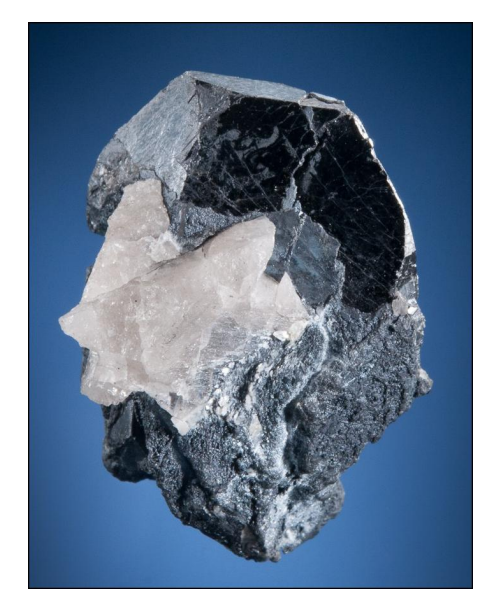
Wodginite, 2.6 cm, from the Linópolis district, Divino das Laranjeiros, Minas Gerais, Brazil.