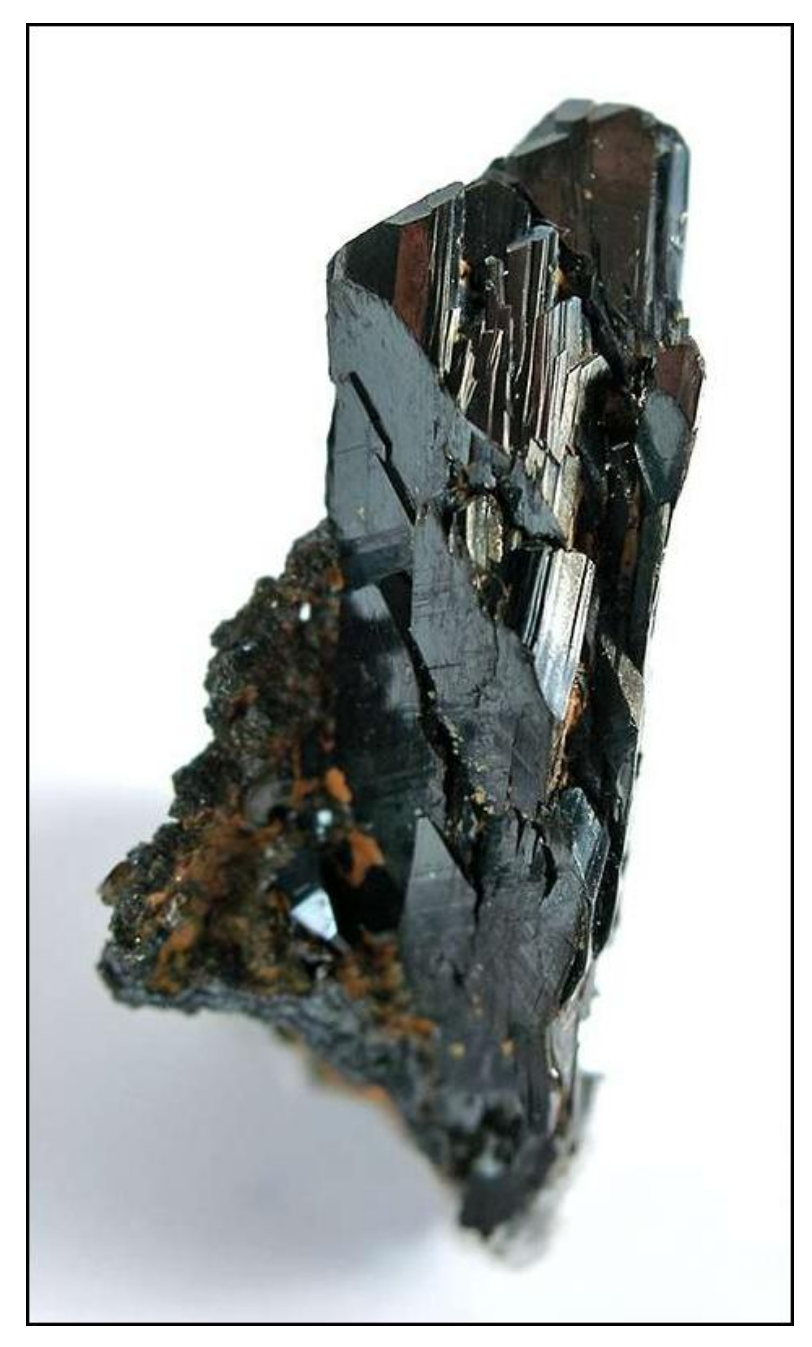
Schneiderhöhnite, 2.3 cm, from Tsumeb, Namibia. The Arkenstone specimen and photo.

Then there is Rob's gallery of specimens from the former Herb Obodda collection, posted on March 19, with offerings which are representative of two very different Obodda specialties: (1) "contemporary" mineral occurrences in Pakistan and Afghanistan, with many specimens gathered during Herb's travels to those parts, and (2) European, especially German, classics. Exemplifying the former specialty is this smashing small-thumbnail-size väyrynenite from a (typically) vague locality in Gilgit-Baltistan, Pakistan: