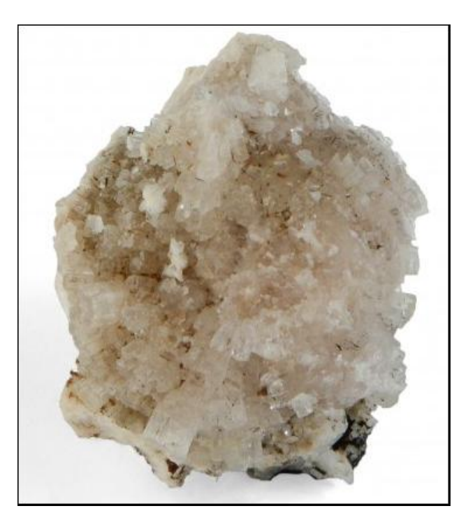
Leifite, 8.8 cm, from St.-Hilaire, Quebec, Canada. Collection Arkane specimen and photo.