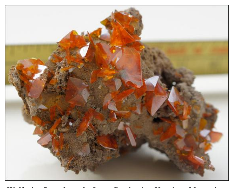
Wulfenite, 5 cm, from the Stone Crack mine, Kuruktag Mountains, Xinjiang Uighur Autonomous Region, China. TC-Mineral-China specimen and photo.