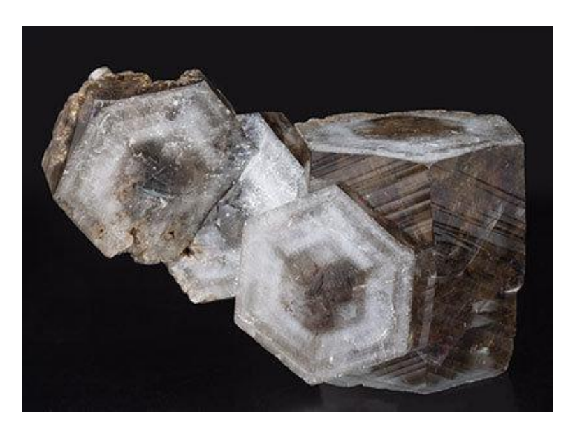
Calcite, 6.7 cm, from Lishui Prefecture, Zhejiang Province, China.