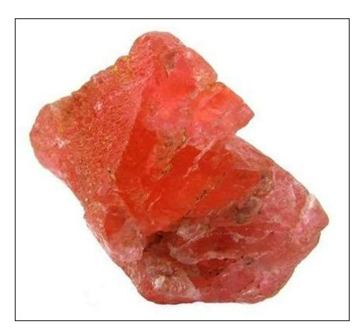
Väyrynenite, 1.5 cm, from the Shengus area, Skardu Road, Gilgit-Baltistan, Pakistan. The Arkenstone specimen and photo.

And in the Old European Classic department we have this matrix specimen of calomel from the ancient mercury mines at Moschellandsberg in the Rheinland-Palatinate, west-central Germany. Cinnabar, native mercury, and of course the Ag/Hg alloy species moschellandsbergite came once upon a time from these little mines, but specimens of well crystallized calomel from Moschellandsberg are even rarer than those of the other mercury minerals, and are among the world's best for the species: