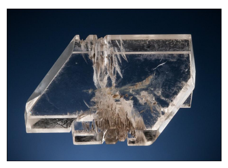
Gypsum, 7.2 cm, from Willow Creek near Nanton, Alberta, Canada.

Noteworthy, too, on the McDougall Minerals site are some miniatures with sharp, silvery brown "books" of muscovite perched on albite, from Mantena, Minas Gerais, Brazil, and four very good thumbnails of the rare Mn-Sn-Ta oxide wodginite , from a pegmatite occurrence somewhere in the Linópolis district, Divino das Laranjeiras, Minas Gerais: