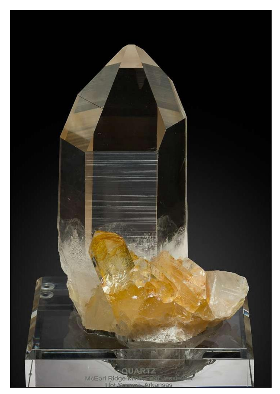
Quartz, 14.7 cm, from the Zigras (McEarl Ridge) mine, Jessieville, Arkansas. The Arkenstone specimen and photo.

specimens in the Convention Center, and, if memory serves right, Rob's single example is right up there with the best from that case.