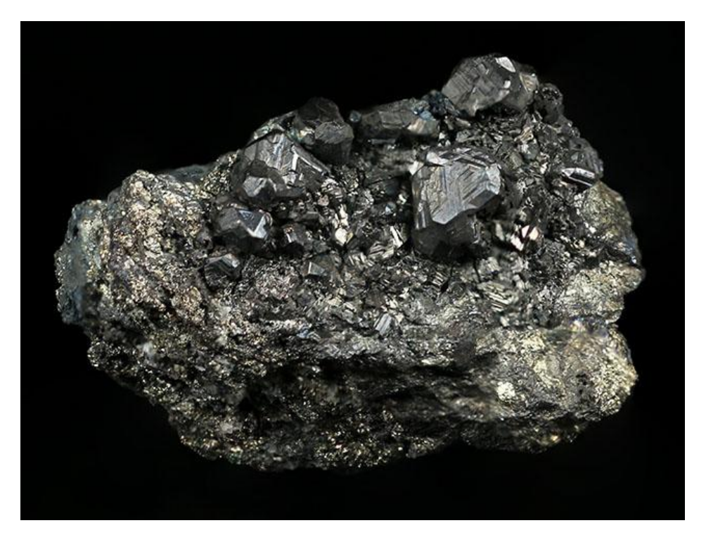
Chalcocite, 3 cm, from the Tsumeb mine, Tsumeb, Namibia. Mineral Species specimen and photo.