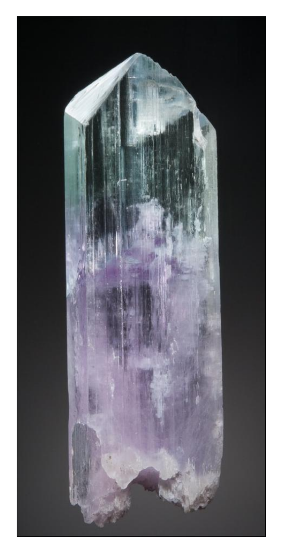
Spodumene, 7.4 cm, from Paprok, Kamdesh district, Nuristan Province, Afghanistan.