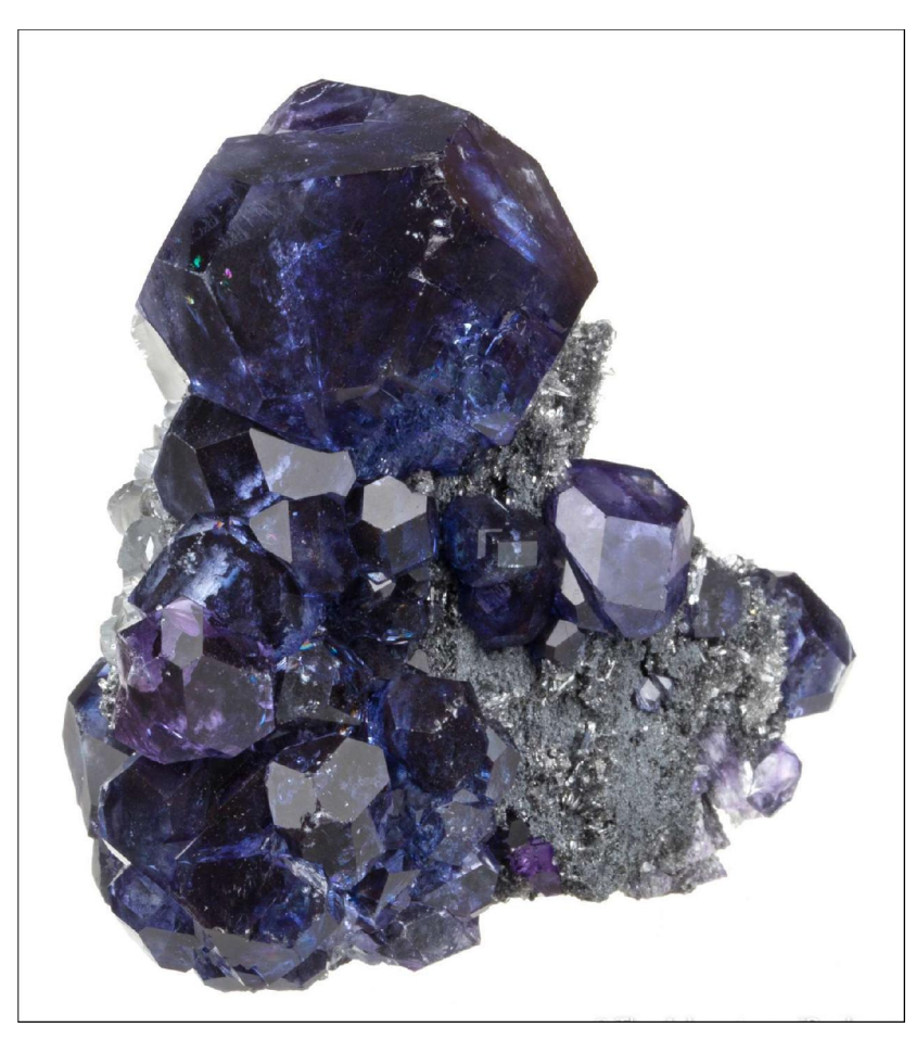
Fluorite, 4.3 cm, from Quan Zhou City, Yong Chun County, Fujian, China. The Arkenstone specimen and photo.

then by Safaa Yu, their handler, to a discovery in summer 2015 in the "Dongpo mine," Chenzhou, Hunan: see the photo on page 84 of the January-February 2016 issue. Since, as it happens, I now own the specimen shown in the photo, I could study it upclose, and I've decided that the color is subtly different from—more purple than—the "tanzanite" color of the newer fluorites; thus I conclude that this isn't just one more case of Chinese-locality confusion or obfuscation. Anyway, look at the "Dongpo" picture from 2015 and the "Yong Chun" picture from 2017 (below), and you'll see why I recommend that, if you turn on to beauty in fluorite, you should pick up a specimen of either kind when you can.