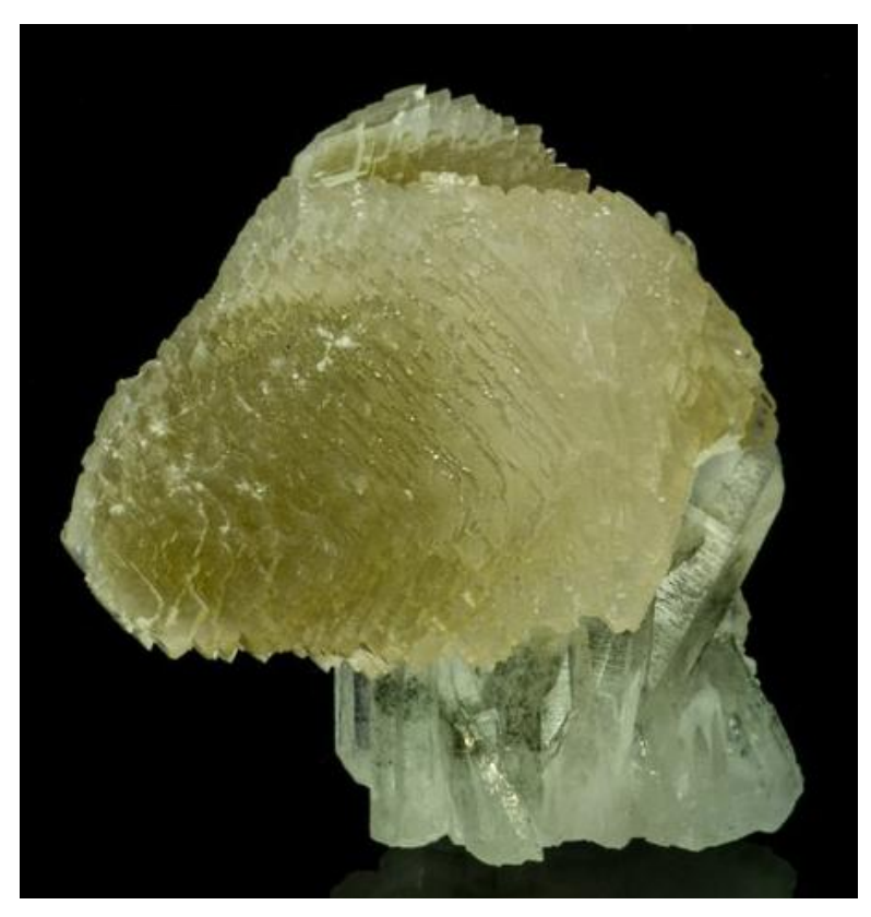
Calcite on chloritoid quartz, 5 cm, from the Borieva mine, Madan orefield, Smolyan Oblast, Bulgaria.

Another new kind of calcite on the Barnett Fine Minerals site is represented by 17 miniatures from a pocket opened in July 2017 in the Borieva mine, Madan orefield, Rhodope Mountains, Bulgaria. Yellow to amber-colored calcite occurs as stepped-surfaced scalenohedral crystals composed of hundreds of small flattened rhombohedrons, and the compound crystals in turn rest on groups of sharp, prismatic quartz crystals tinted green by chlorite inclusions. These are handsome specimens, quite unlike the opaque latte-colored calcite, or the pink manganese-rich calcite, which we are accustomed to seeing from the metal mines of southern Bulgaria.