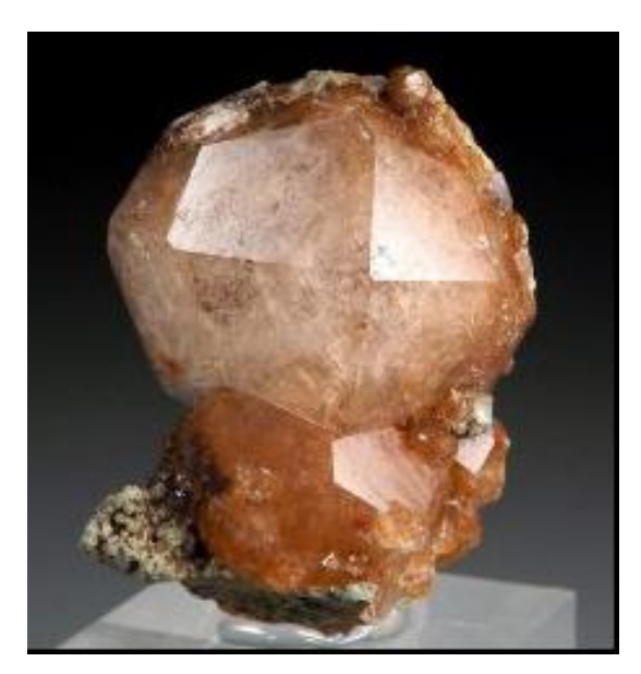
Analcime, 3 cm, from Kahwan Mountain, Moaleman County, Semman Province, Iran.