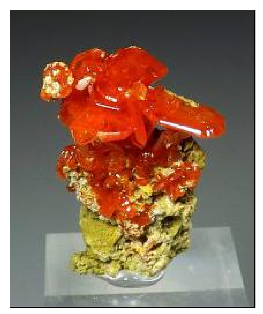
Wulfenite, 2.2 cm, from the Chah Kharboze mine, Anarak district, Esfahan Province, Iran.

A much more recent Iranian contribution—discovered first in December 2016—is the very well crystallized analcime from a volcanic field on Kahwan Mountain, Moaleman County, Semnan Province, north-central Iran. Some of the sharp, lustrous, trapezohedral analcime crystals from this occurrence are pure white while others have mild red staining from iron oxide inclusions. I noted from the 2017 Tucson Show that one dealer had a handful of these specimens (see that report in May-June 2017), and now a dozen fine miniatures may be ogled on the Mineral One website. And finally I'll note that the same website offers a few of the bright green andradite (variety demantoid) specimens from Belqeys Mountain, West Azerbaijan Province, as well as a few of the dark, spiky willemite pseudomorph after descloizite specimens from the Chah Milleh mine—both of which items have seeped onto the general market during the past few years.