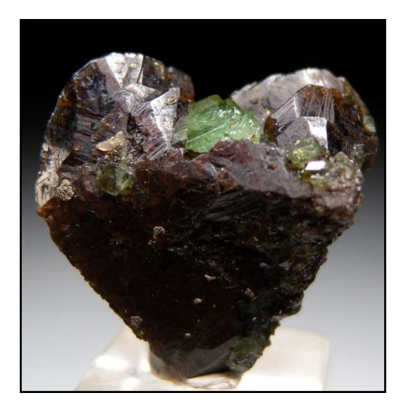
Titanite with grossular (variety tsavorite) and pyrite, 2.5 cm, from the Merelani Hills, Manyara, Tanzania. Marin Mineral Company specimen and photo.