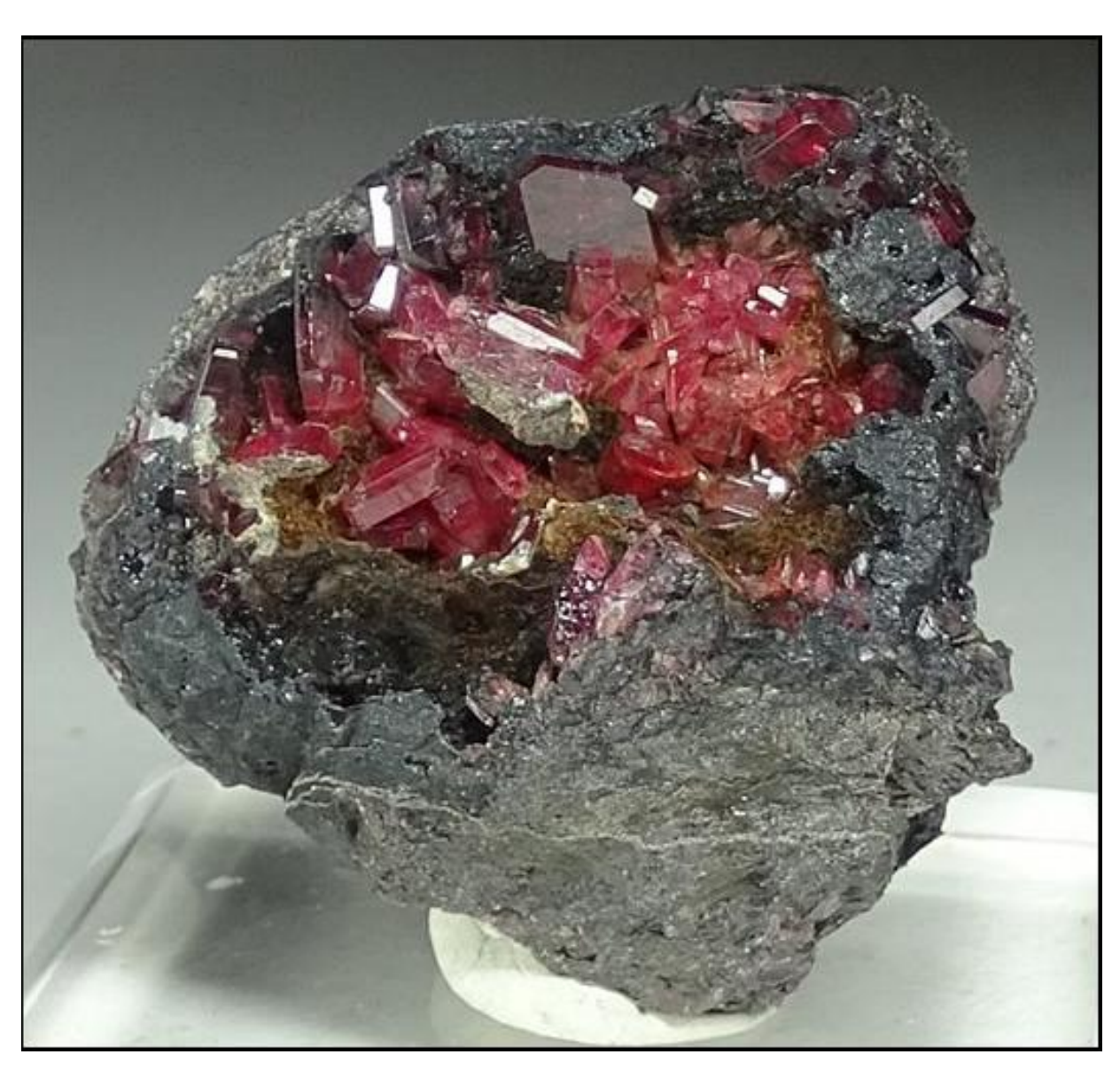
Pyroxmangite, 4.1 cm, from the Taguchi mine, Chubu Region, Honshu, Japan. Trinity Minerals specimen