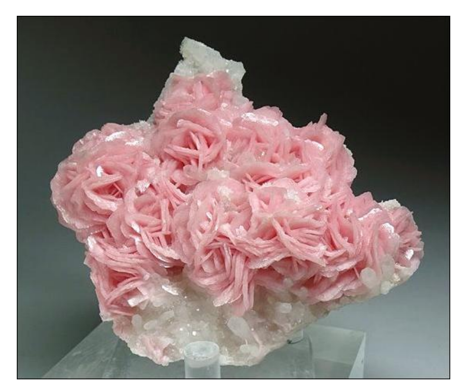
Rhodochrosite, 8.7 cm, from Cavnic, Maramures, Romania. Trinity Minerals specimen