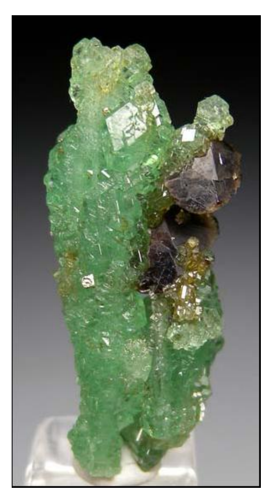
Grossular, variety tsavorite, 3 cm, from the Merelani Hills, Manyara, Tanzania.