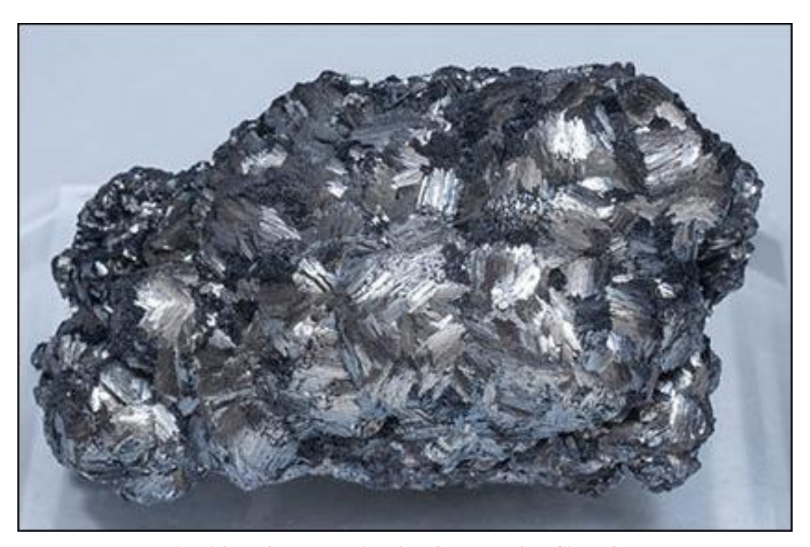
Pyrolusite, 6.4 cm, from the Haití mine, Cabezo de San Ginés, Cartagena, Murcia, Spain. Fabre Minerals specimen and photo.

Another new find of an unlikely manganese oxide-type species hails from the Haití mine near Cartagena, Murcia, Spain, and specimens from it are offered in a December 2017 update on Jordi Fabre's Fabre Minerals (fabreminerals.com) site. In October 2017, some diggers in the remains of this old, obscure little mine came out with highly presentable specimens of pyrolusite : rounded plates consisting entirely of tightly interlocked, tabular aggregates of zillions of bright black little crystals. Jordi offers several miniature to small-cabinet specimens (all, however, marked "reserved").