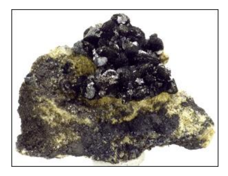
Groutite, 4.2 cm, from the Zavalye graphite field, Haivoron, Kirovohrad, Ukraine.

One new occurrence which you'll see noted in my report on the 2017 Munich Show (to be published in our March-April 2018 issue) is that of the rare manganese oxide-hydroxide groutite , in fairly attractive specimens taken recently from the Zavalye graphite field, Haivoron, Kirovohrad, Ukraine. The groutite forms black, highly lustrous, lenticular aggregates of microcrystals, and the little lenticules are jumbled lightly together, like handfuls of shiny black coins, on matrix and in loose clusters. A few miniatures of this material are currently seen on the website of Tomasz Praszkier's Spirifer Minerals (spiriferminerals.com).