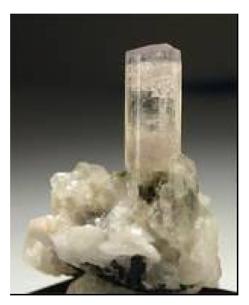
Elbaite, 4 cm, from San Piero, Elba, Tuscany, Italy.

At some time in the past I noted in this space that the dealership called Italian Minerals (italianminerals.com) had latched onto some thumbnail crystals of the very rare sulfosalt geocronite from the Pollone mine in Tuscany, and I'll note now that some of these exotic crystals are still available (and still priced in the hundreds of Euros). But the major subspecialty of Italian Minerals seems to be minerals from Elba—Napoleon's island—and especially elbaite , named of course for Elba, its type locality. But really top-quality Elba elbaites more than a centimeter or so in length, and on matrix, remain very rare, even on this voluminous site. Some months ago I saw this small-miniature matrix specimen on the site and am quite surprised to see it still there, still unsold. The prismatic elbaite crystal, standing straight up from the matrix, measures 2.2 cm and is perfectly terminated, transparent, and zoned in pale colors. See for yourself: