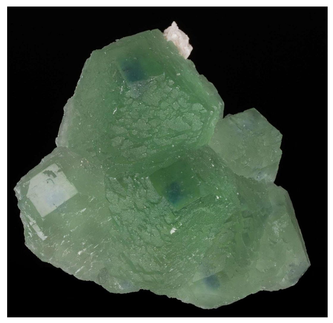
Fluorite, 11.6 cm, from the Green Fluorite mine, Manaoshan Mountain, Suxian district, Chenzhou Prefecture, Hunan, China. The Arkenstone specimen and photo.

the crystals. The specimens are attributed to a mine named, aptly enough, the Green Fluorite mine, Manaoshan Mountain, Suxian district, Chenzhou Prefecture, Hunan Province. And I will direct your attention as well to a recent update on the site of The Collector's Edge (collectorsedge.com), offering a selection of what's clearly the same material, but the locality they give is just the Dongpo Ore Field (likewise in Suxian-Chenzhou-Hunan). In some specimens from both of these lots the fluorite crystals are perched on drusy white quartz, and pink, saddle-shaped dolomite crystals adorn that matrix.