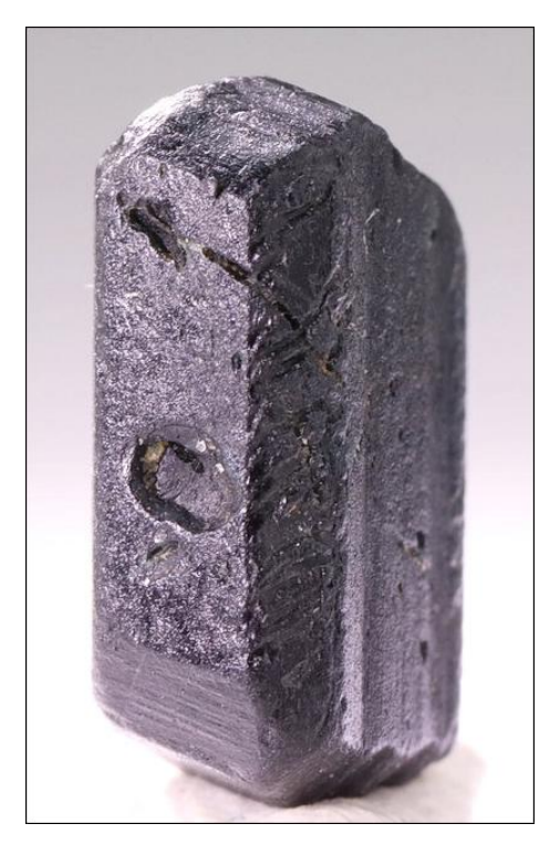
Serendibite, 9.1 mm, from Ohngaing village near Mogok, Mandalay Division, Myanmar. Crystal Treasure specimen and photo.