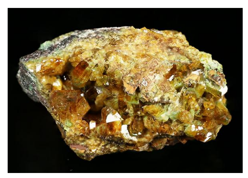
Adamite, 3 cm, from the Tsumeb mine, Tsumeb, Namibia. Mineral Species specimen and photo.

the söhngeite). Here are just three specimens from the December lot, and to save you the trouble of looking up biehlite (in your new 2018 Fleischer's Glossary ) I will record that its unusual formula is (Sb,As)<sub>2</sub>MoO<sub>6</sub>: