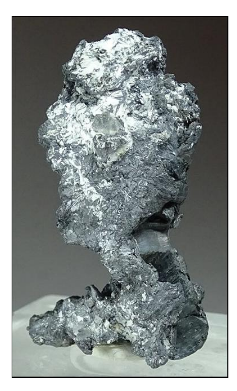
Lead, 4.3 cm, from the NBHC mine, Broken Hill, New South Wales, Australia. Trinity Minerals specimen