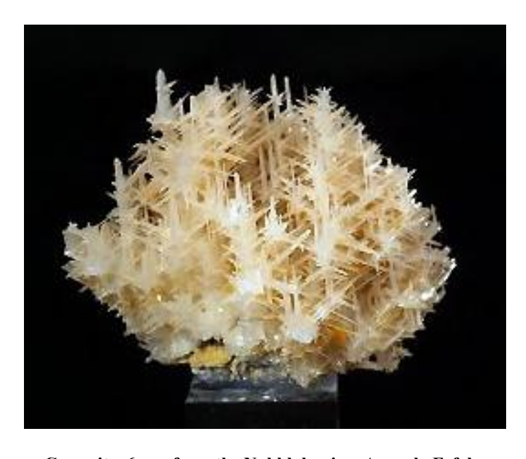
Cerussite, 6 cm, from the Nakhlak mine, Anarak, Esfahan Province,Iran.

Mineral One (mineral-one.com) is an Italian dealership (with prices in Euros) which seems to have some very good sources for new and attractive mineral finds from Iran. The current upsurge of Iranian minerals on the international market had its harbinger in the 1970s, when distinctive specimens of snowflake-white reticulated cerussite from the Nakhlak mine, Anarak, Esfahan Province, first appeared; then there was a lull, and then in the very early 2000s some German prospectors came to Western shows with abundant further supplies of Nakhlak cerussite. In 2012-2013 there were still more of these loose, delicate, labyrinthine cerussites, and now, in a July 2017 "Special Iran" update, Mineral One is offering about 25 of some of the finest I have yet seen, with Euro prices hovering in the mid-three figures.