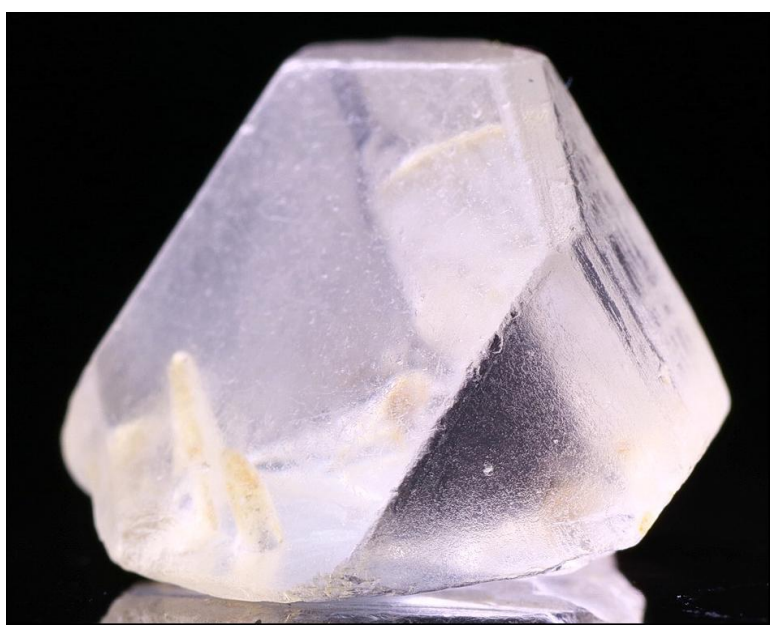
Orthoclase, 1.9 cm, Sakangyi area west of Mogok, Mandalay Division, Myanmar. Crystal Treasure specimen and photo.

Between October and December 2017, Kevin Ward of Exceptional Minerals (exceptionalminerals.com) posted five pages of "Denver Show updates," with numerous one-of-a-kind specimens, nearly all qualifying as "killers." Interestingly, these new