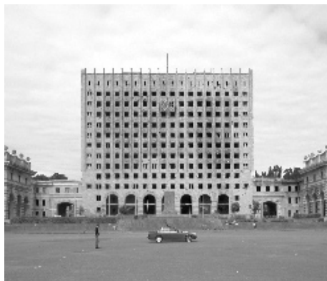
Abkhazia Destruction: This is what remains of the former headquarters of the Communist Party in Sukhum(i). The Abkhaz de facto government has not been able to resort all the devastation from the war, so one in four buildings in Sukhum(i) remains in ruins.

a common occurrence in ethnic wars. Saakashvili's pledge to bring Abkhazia and South Ossetia back into Georgian control faces several challenges, the most imposing being the search for peaceful leverage to attract the separatist