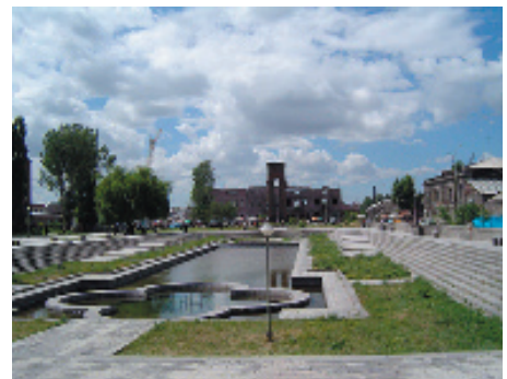
Scene of city square in Gyumri

One of the prominent features of Gyumri is the town square. Before the Soviet government leveled it, there