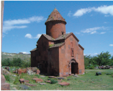
Church just outside of Gyumri

Approximately one hour north of Yerevan lies Gyumri, the second largest city in Armenia. Gyumri, up until the Soviet expansion of Yerevan, was the largest city in Armenia. Gyumri was known as Leninakan and before that as Alexandropol. Gyumri was one of the cities devastated in the earthquake of December 10, 1988, which killed approximately 45,000 people and left roughly 500,000 people homeless throughout northwestern Armenia. Much effort has gone into rebuilding the city, though it is still not completed. Last summer, I had the opportunity to travel throughout Armenia and was able to see Gyumri and the reconstruction that had taken place.