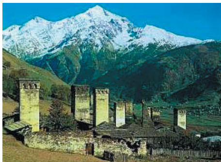
Svaneti region, Ushguli village

According to official sources the first Georgian state was founded 4,000 years ago. The Georgians themselves tell the following story about how they came