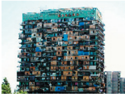
Iveria Hotel: The Iveria Hotel housed about 1000 Georgians displaced by the Abkhaz war. Families of four lived in single hotel rooms for over ten years. Recently, the Iveria Hotel, a Western company, purchased the hotel, giving each family $7,000 for relocation.

Gamsakhurdia did not take commensurate action against Abkhazia, although the Abkhaz continued to appeal variously for autonomy, sovereignty, and ultimately independence from Georgia. Gamsakhurdia's power waned and his eventual ouster led to civil war as