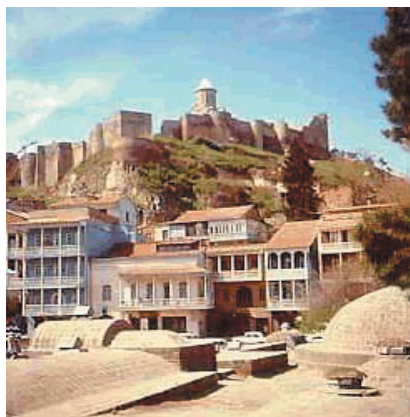
View of old Tbilisi

After the "Golden Age" of cultural and political development that lasted until the 13 th century, Georgia entered a long period of political isolation as fratricidal