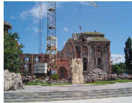
Church damaged in earthquake awaiting reconstruction

once was a covered market. Currently, there are only two churches in the square. While one of the churches is standing, the other still lies in ruins, a reminder of the terrible event of 1988. The ruined church, formerly a