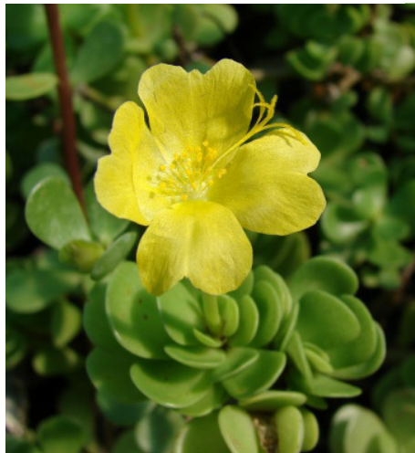
'Ihi ( Portulaca molokiniensis )