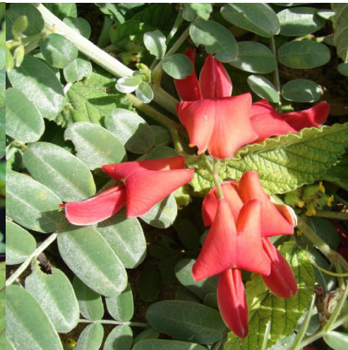
'Ōhai ( Sesbania tomentosa )

What mineral is being used to build a castle, soak up radiation, retain water, absorb pollutants, detoxify our bodies, and remove unpleasant odors? IT'S ZEOLITE!!!