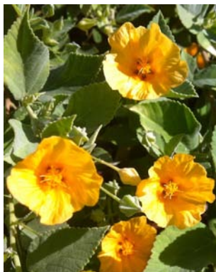
'Ilima Sida fallax Malvaceae (Mallow Family)