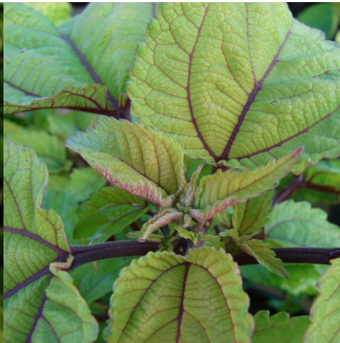
Māmaki ( Pipturus albidus )