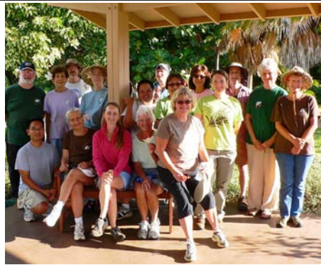
MNBG's Weed & Pot Club pose for a photo before getting down and dirty in the Gardens.