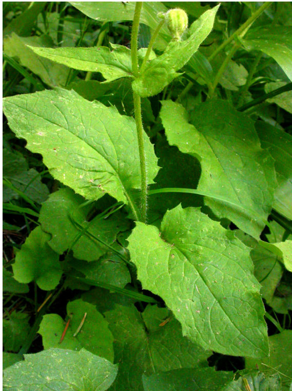
Basal leaves of Arnica cordifolia

Recognition: Arnica cordifolia is a perennial understory forb that produces heart shaped, relatively long stalked basal leaves on plants that are usually unbranched and range to ca. 40 cm in height. There are commonly from 2-4 pairs of cauline (stem) leaves, which are opposite and stalked, the lower pairs with flattened, winged petioles. Both the stem and upper side of the leaves are finely hairy, and the leaves are very coarsely-toothed, the tips of the teeth sharp to somewhat rounded. The stems terminate in typically 1-5 long-stalked flower heads with bright yellow rays much longer than the flower head bracts (the phyllaries or collectively the involucre). Heart-leaved arnica is most likely to be confused with big-leaved aster ( Aster macrophyllus ), with which it commonly