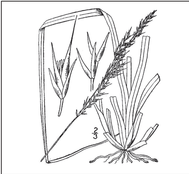
Britton & Brown 1913 @ USDA-PLANTS Database