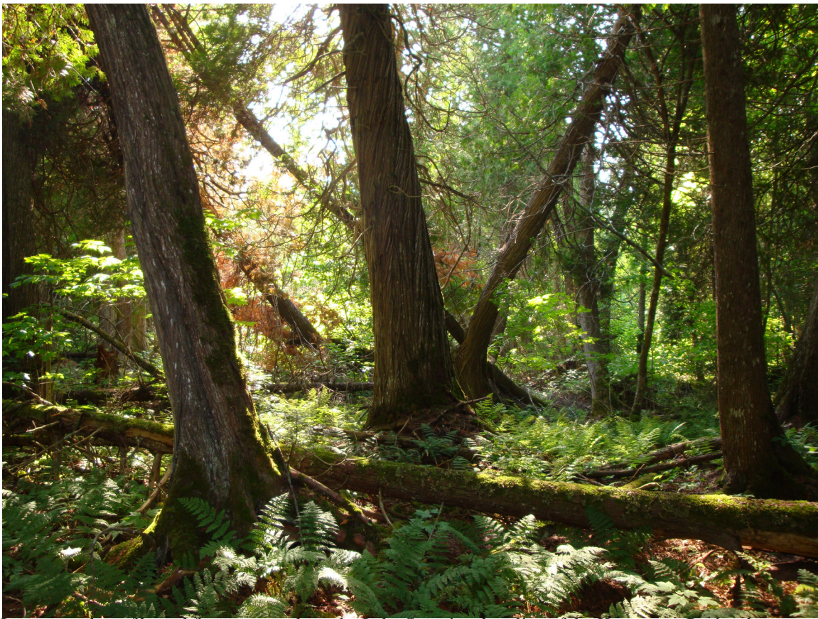
Large stretches of boreal forest occur along the Lake Superior shoreline of the Keweenaw Peninsula.