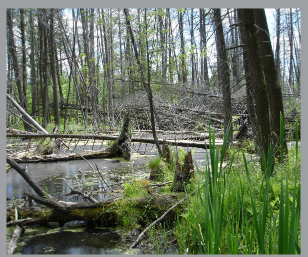
Beaver disturb hardwood-conifer swamp through dambuilding activities that can flood low-lying tracts and promote shrubs and graminoids.

construction are likely low-lying peatlands immediately adjacent to streams and lakes (e.g., rich conifer swamp and poor conifer swamp).