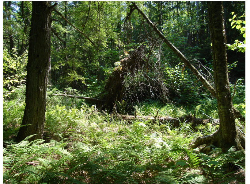
Hardwood-conifer swamp, Luce County, Michigan.

*Protected by the Migratory Bird Treaty Act of 1918.