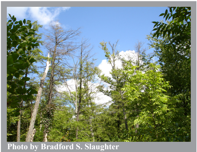
Windthrow is responsible for the patchy canopy characteristic of hardwood-conifer swamp. Increased light and soil moisture associated with gaps enhances plant species richness and diversity.

table and seasonal periods of inundation, resulting in fine-scale spatial, seasonal, and temporal gradients in soil chemistry (Paratley and Fahey 1986, Anderson and Leopold 2002).