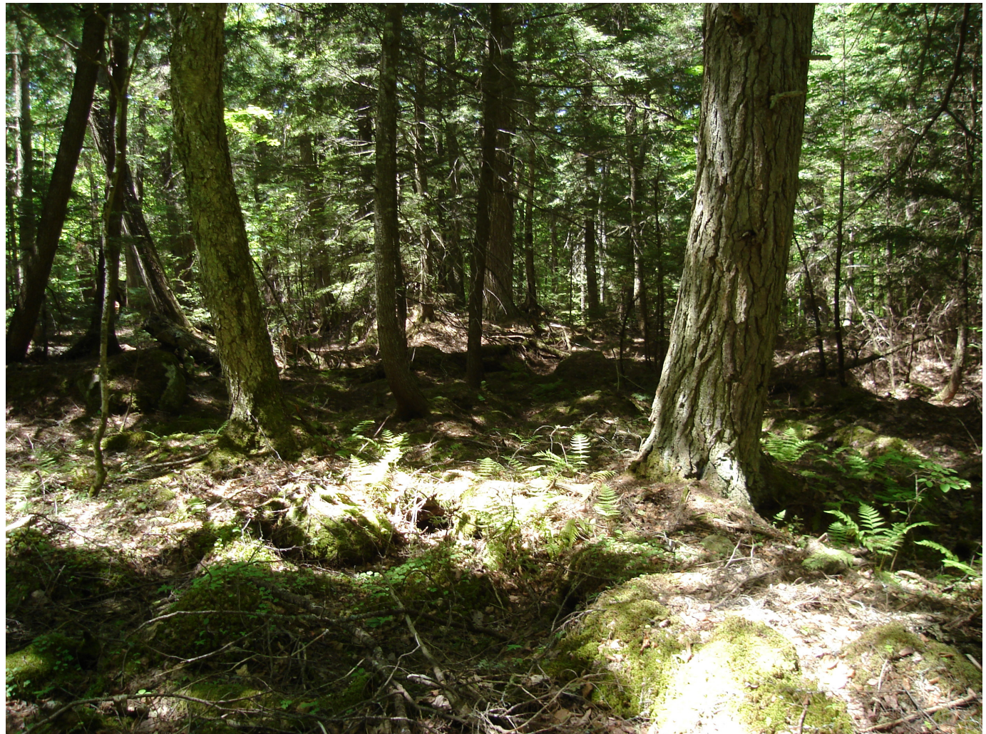
Hardwood-conifer swamp, Baraga County, Michigan.

Funding for abstract provided by Michigan Department of Natural Resources Forest, Mineral and Fire Management Division and Wildlife Division.