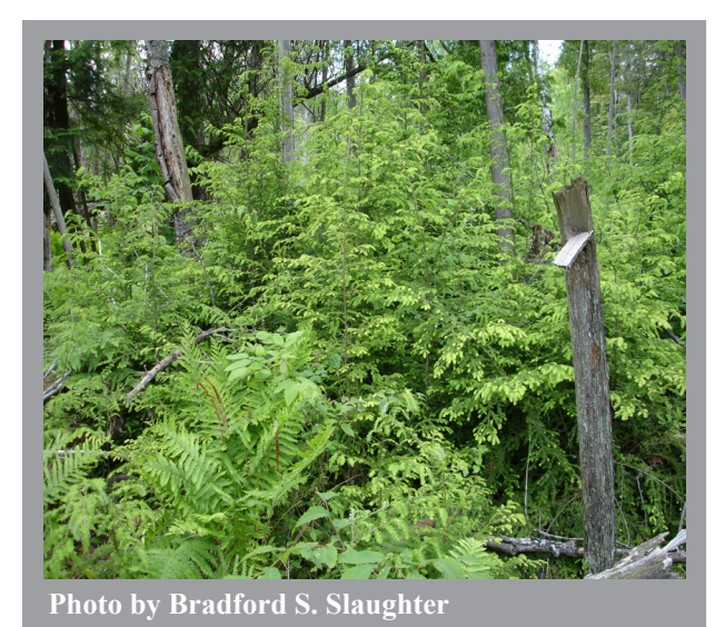
Blowdowns serve as refugia for conifer seedlings and saplings in sites impacted by high deer density.

the landscape scale, reduction of deer densities will promote recovery of tree seedling, shrub, and herb populations. In areas where reducing the number of deer is not feasible, or in small, isolated stands of high-quality hardwood-conifer swamp, deer exclosures should be considered in order to promote conifer regeneration and recruitment.