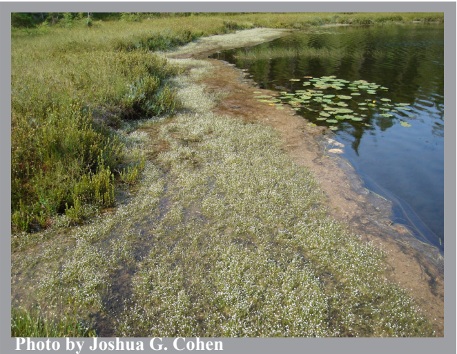
Pipewort ( Eriocaulon septangulare ) is a characteristic species of the seasonally-flooded pond margins.

Intermittent wetlands typically contain several vegetation zones, especially when they are adjacent to or encircle a lake or pond. The deepest portion of the depression is usually inundated and supports floating aquatic plants including Brasenia schreberi (water shield), Nuphar variegata (yellow pondlily), Nymphaea odorata (sweet-scented water-lily), Potamogeton spp. (pondweeds), and Utricularia spp. (bladderworts). Occurring along the lower shores and pond margins is a seasonally-flooded zone with sparse cover of low forbs and graminoids including Eriocaulon septangulare (pipewort), Eleocharis olivacea (bright green spike-rush), E. robbinsii (Robbin's spike-rush), Fimbrystilis autumnalis (autumn sedge), Juncus pelocarpus, (brown-fruited rush), Rhynchospora capitellata (beak-rush), R. fusca (beakrush), Schoenoplectus smithii (bulrush), and S. torrevi (Torrey's bulrush, state special concern).