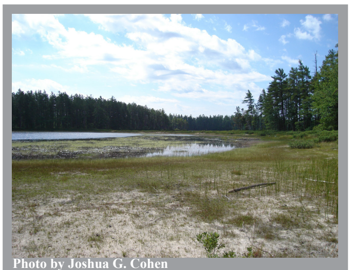
Preservation of intermittent wetlands depends in part on the protection of regional and local hydrologic regimes.