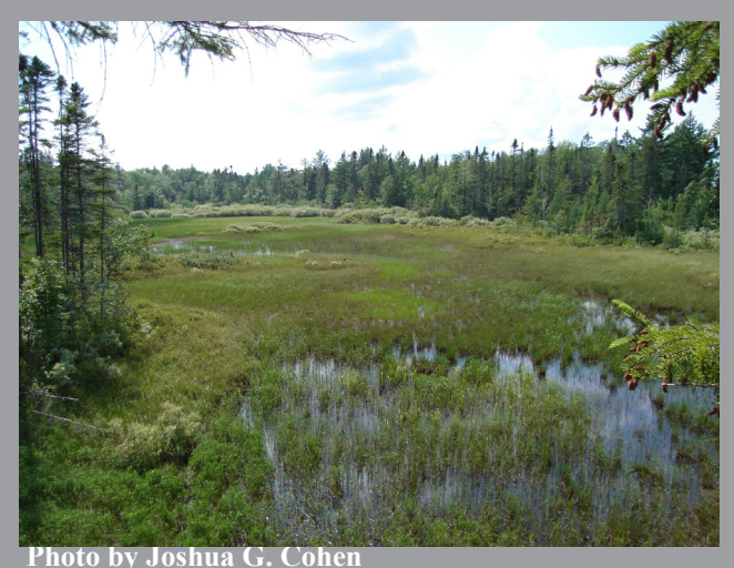
An important research need is to determine how hydrologic fluctuations and landscape context influence fire regimes.

Research Needs: Intermittent wetland is one of the least studied wetland community types of the Great Lakes region. Classification research is needed that explores the interrelationship between floristic composition and structure and physiography, hydrology, and fire. Intermittent wetland and related community types (i.e., bog, coastal plain marsh, poor fen, northern fen, and northern wet meadow) are frequently difficult to differentiate. Research on abiotic and biotic indicators that help distinguish related wetlands would be useful for field classification. Systematic surveys for intermittent wetlands and related wetlands are needed to help prioritize conservation and management efforts.