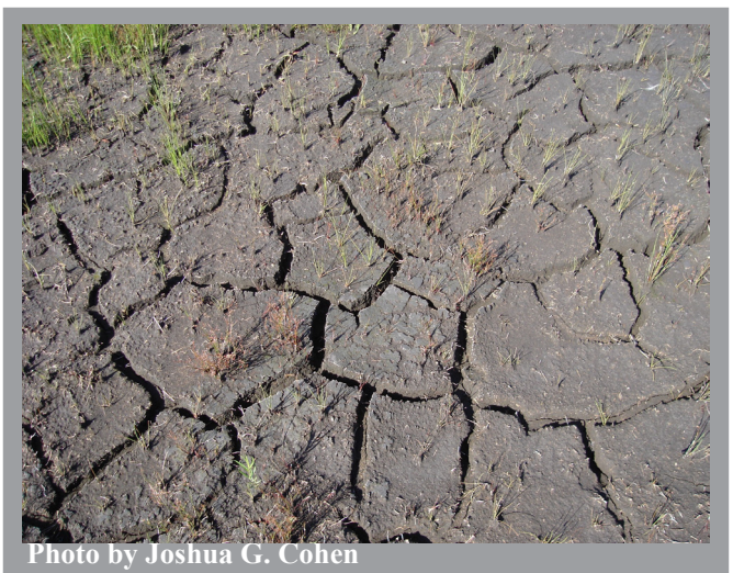
Seasonal drawdown allows for seed germination.

During daylight, the sun warms the bare substrate, while the lack of an insulating layer of water and duff allows soils temperatures to drop lower at night. Because the vegetation of intermittent wetlands typically contains many annual species, mechanisms that contribute to seed germination such as exposure to sunlight and wide, daily fluctuations in soil temperature are critical for maintaining species diversity. Seasonal water level fluctuations also act as an important mechanism for seed dispersal (Schneider 1994). During the winter and spring when water levels rise, seeds deposited along the wetland's low-water line float to the surface and are carried by wave action to the wetland's outer margin. In addition to carrying dormant seeds, rising water levels also move sprouting seeds and organic matter into the upper shoreline in early spring. This seasonal movement of plant propagules and organic matter acts to maintain diversity and nutrient levels at the upper elevations of the wetland basin (Schneider 1994). In addition, high water levels can limit tree and shrub encroachment into intermittent wetlands since prolonged flooding can result in tree and shrub mortality.