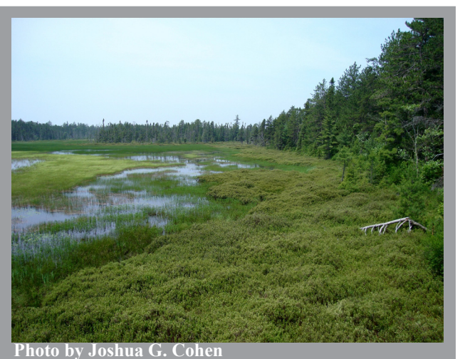
Periods of high water and fire limit tree and shrub encroachment in intermittent wetlands.

Prolonged periods of lowered water table can allow the vegetation and surface peat to dry out sufficiently to burn (Schwintzer and Williams 1974). When the surface peat of intermittent wetlands burns, the fire releases organic matter from the peat, kills seeds and latent buds of some species while stimulating seed germination and stem sprouting of others, increases decay of organic matter, and slows peat accumulation (Damman 1990. Jean and Bouchard 1991). Peat fires likely convert bog to more graminoid-dominated peatlands such as intermittent wetland and poor fen or if the peat is completely destroyed, to mineral soil wetlands such as northern wet meadow (Curtis 1959). Because fire has been shown to increase seed germination, enhance seedling establishment, and bolster flowering, fire likely acts as an important mechanism for maintaining plant species diversity and replenishing the seed bank of intermittent wetlands (Warners 1997).