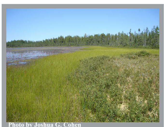
Prescribed fires and wildfires in surrounding uplands should be allowed to burn into adjacent intermittent wetlands when safety permits.

Where shrub and tree encroachment threatens to convert open wetlands to shrub-dominated systems or forested swamps, prescribed fire can be employed to maintain open conditions. Prescribed fires are best employed in intermittent wetlands during droughts or in the late summer and fall when water levels are lowest. In addition to controlling woody invasion, fire promotes seed bank expression and rejuvenation and thus helps maintain species diversity. Intermittent wetlands are common natural features within a variety of droughty, fire-dependent, upland pine and oak matrix communities and would likely have experienced surface fires along with the surrounding uplands when conditions were favorable. When feasible, prescribed fires conducted in the adjacent uplands should be allowed to carry into intermittent wetlands. In addition, wildfires that spread through the uplands should be allowed to carry into intermittent wetlands when they do not pose serious safety concerns or threaten other management objectives.