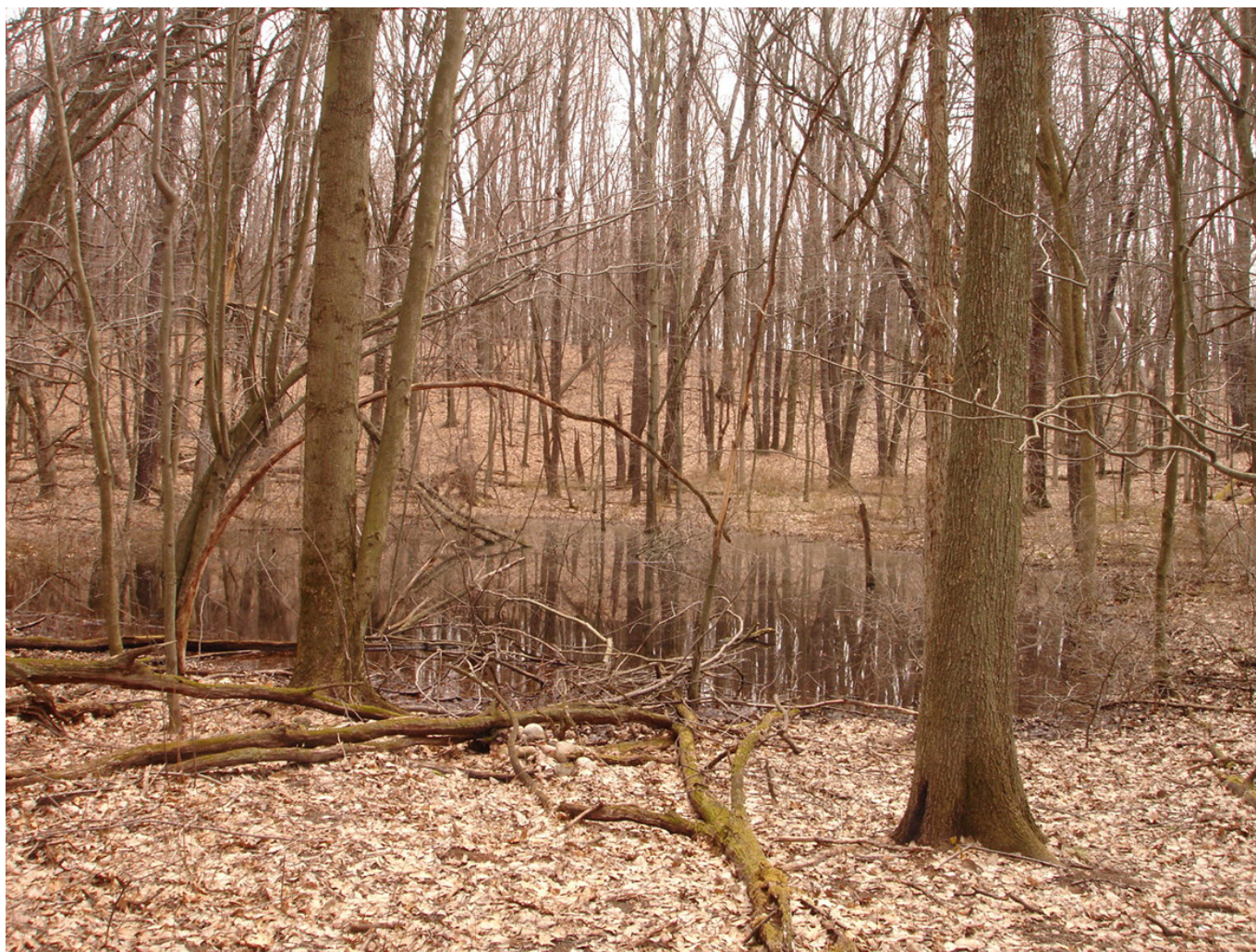
Steve A. Thomas

Vernal pools vary greatly in size. The smallest pools may be only a few square meters in area, created through local events such as tree tip-ups or bole-rot cavities. In the northeastern U.S. including Michigan, most vernal pools are less than 1 hectare