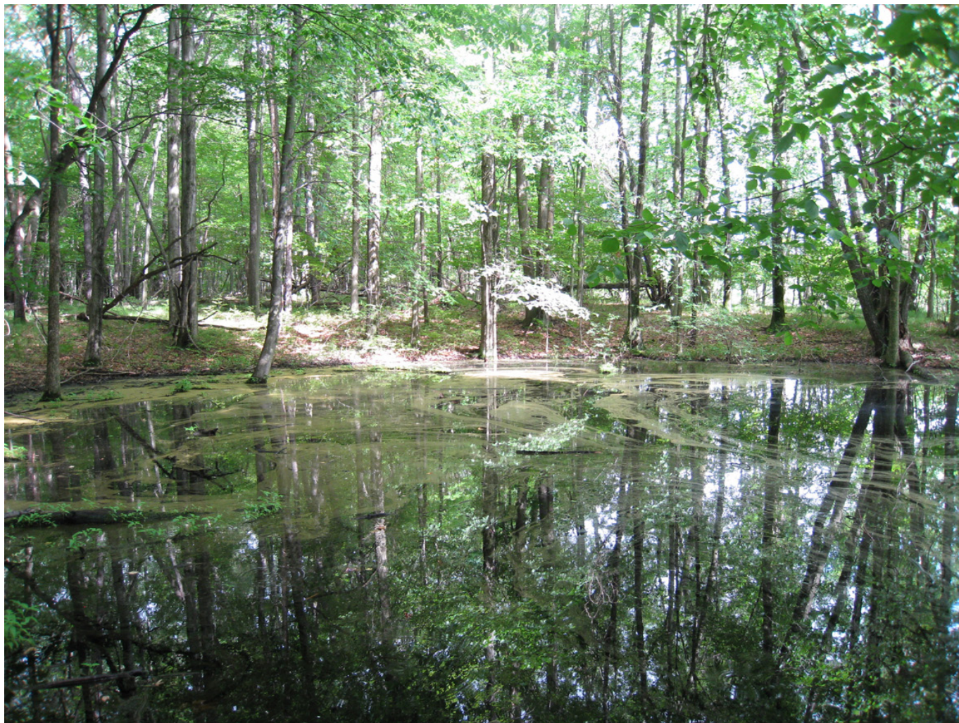
Michael A. Kost

Williams (1983) classifies vernal pool fauna into five similar groups based on general life history patterns and timing of when species are active in vernal pools but does not take into account when species may be dormant or aestivating. “Persistent species” are species that are always present and active in the pools regardless of the presence or