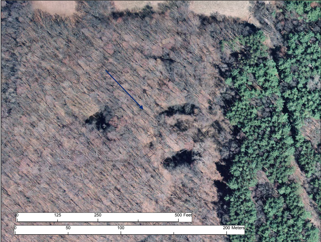
Topographic map (top) and aerial photograph (bottom) with arrows indicating locations of vernal pools.