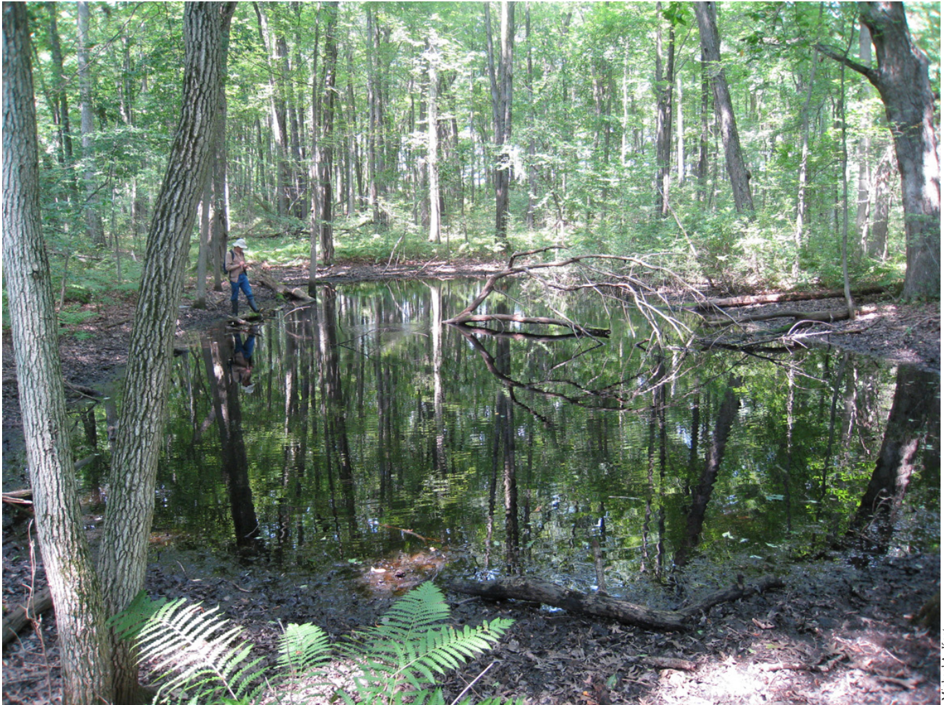
Michael A. Kost

Overview: Vernal pools are small, isolated wetlands that occur in forested settings throughout Michigan. Vernal pools experience cyclic periods of water inundation and drying, typically filling with water in the spring or fall and drying during the summer or in drought years. Substrates often consist of mineral soils underlain by an impermeable layer such as clay, and may be covered by a layer of interwoven fibrous roots and dead leaves. Though relatively small, and sometimes overlooked, vernal pools provide critical habitat for many plants and animals, including rare species and species with specialized adaptations for coping with temporary and variable hydroperiods. Vernal pools are also referred to as vernal ponds, ephemeral ponds, ephemeral pools, temporary pools, and seasonal wetlands.