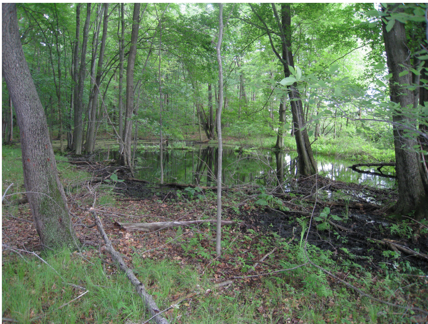
Michael A. Kost

occur in vernal pools, but generally prefer to breed in open habitats or permanent waters and/or utilize vernal pools outside the breeding season (Colburn 2004). Eastern red-backed salamanders ( Plethodon cinereus ) can be found in dry vernal pool basins (Colburn 2004). Many of these amphibian species overwinter close to vernal pools; though some overwinter up to almost two kilometers (one mile) away. Amphibians contribute to the prey base for many reptiles, birds, mammals, and other amphibians. Thus, vernal pools support a critically important component of the food web that helps to maintain species diversity in and beyond their boundaries.