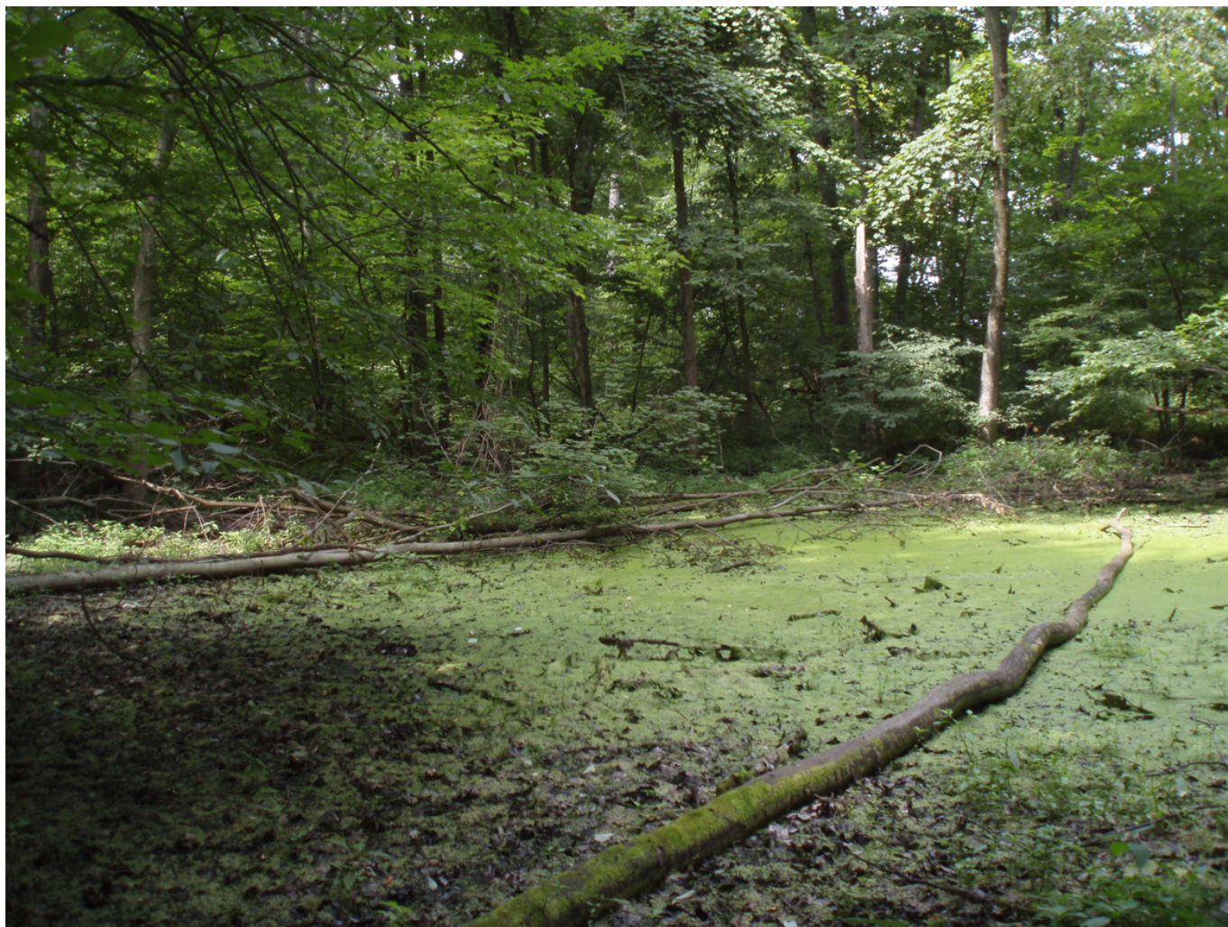
Yu Man Lee

limestone have higher cation concentrations and higher pH (i.e. lower acidity) (Colburn 2004). The hydrologic regime and vegetation can also affect water quality and chemistry. For example, a high proportion of water inputs via groundwater results in higher salt concentrations, while the presence of sphagnum moss in a pool typically increases acidity. Dissolved oxygen levels fluctuate but are generally highest while algae and other organisms are photosynthesizing, when water temperatures are cold, when ice cover is not present, and when wind is causing water mixing (Colburn 2004). Studies of vernal pools in Michigan and southern Ontario have found relatively neutral and stable pH and relatively low dissolved oxygen levels (Kenk 1949, Wiggins et al. 1980). Water quality and chemistry