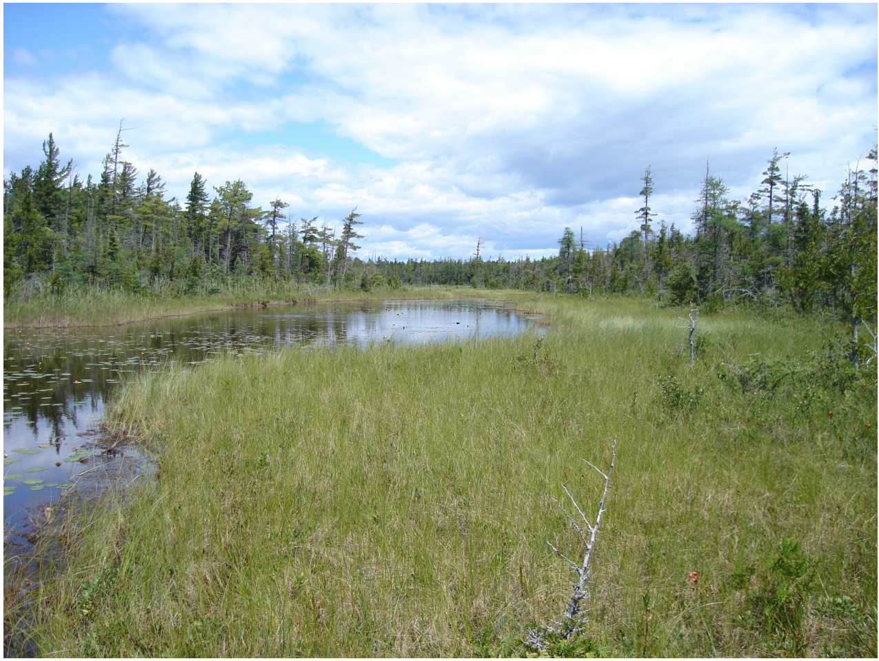
Wooded dune and swale complex, Emmet County, Michigan.

Funding for abstract provided by Michigan Department of Natural Resources - Wildlife Division, Nongame Program.