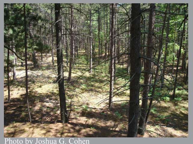
Dry northern forest dominating dunes and dry swales in Marquette County along the Lake Superior shoreline.

The Lake Superior sub-type is dominated by plant species of distinctly northern character. This sub-type, represented by relatively few examples concentrated in Marquette and Luce counties, typically contains few swales with wetland vegetation. This is due to well-drained conditions resulting from high, wind-sorted dune ridges (1-3 m), and by adjacent rivers that effectively drain much of the complex. An example is at the mouth of the Iron River in Marquette County, where the first swale lies below current Lake Superior water levels, but all other swales are above the lake and well drained. These complexes are characterized by dry northern forest with jack pine and red pine.