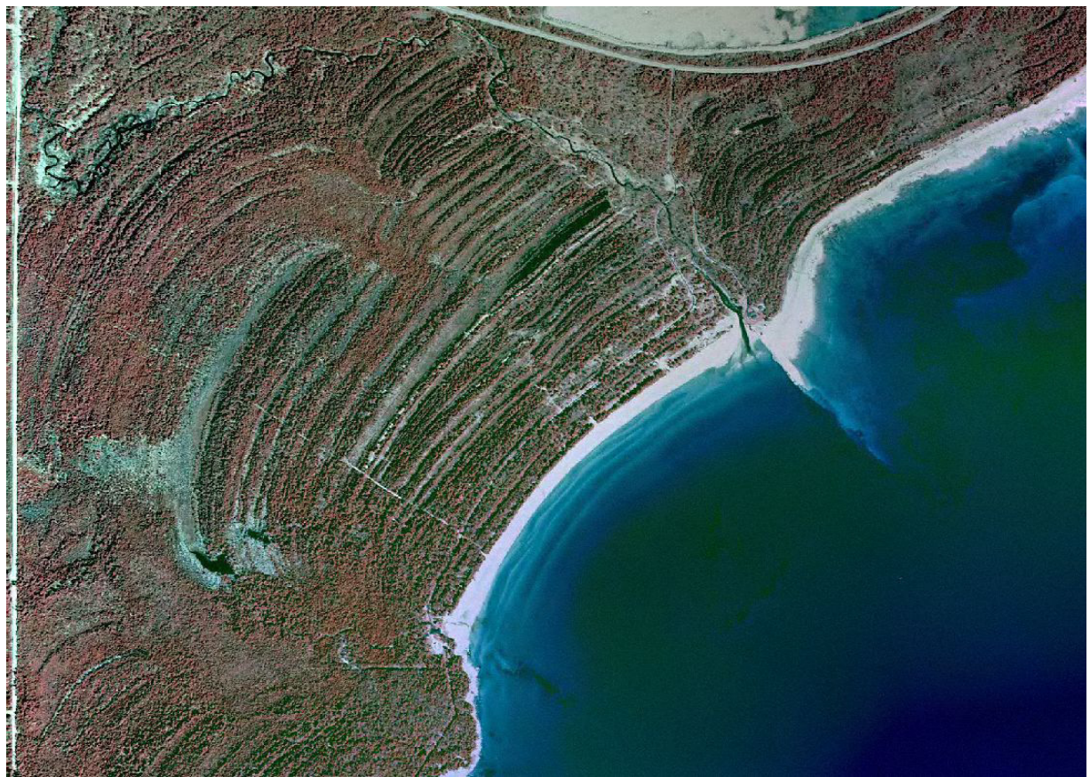
Aerial photo of wooded dune and swale complex on north shore of Lake Michigan. See close-up images of open swale and red pine-forested dune on cover.

A low dune field with more advanced plant succession often follows the first open dunes and swales. Jack pine ( Pinus banksiana ), white pine ( P. strobus ), and red pine ( P. resinosa ) often form a scattered overstory canopy, while ground juniper ( Juniperus communis ), creeping juniper ( J. horizontalis ), bear berry ( Arctostaphylos uva-ursi ), beach grass, and June grass ( Koeleria macrantha ) form a scattered ground layer.