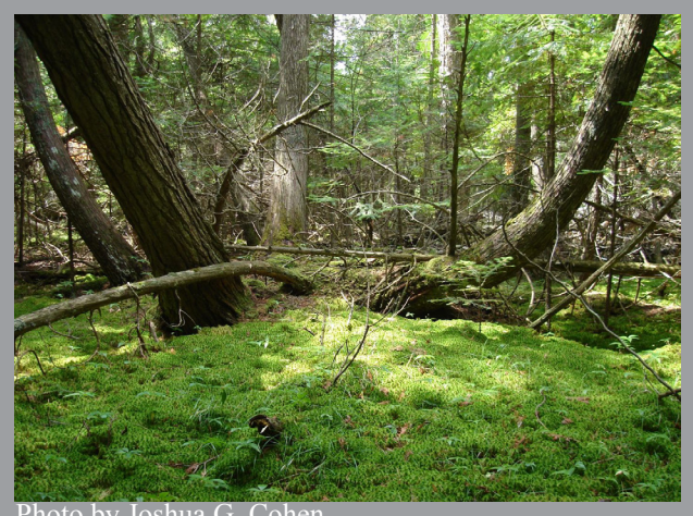
Forested swale dominated by rich conifer swamp.

manna grass ( Glyceria striata ), water horehound ( Lycopus uniflorus ), and Sphagnum mosses ( Sphagnum spp.) in the ground layer.