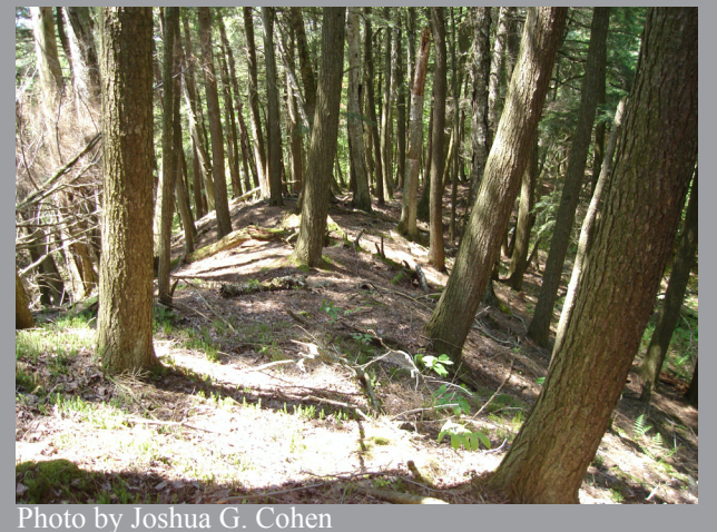
Dry-mesic northern forest typically dominate the dune ridges of wooded dune and swale complexes.

ern fen, poor fen, interdunal wetland, rich conifer swamp, poor conifer swamp, hardwood-conifer swamp, bog, dry northern forest, and open dune.