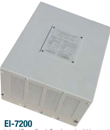
Isolated Power Supply Transformer (available separately) 7.2kVA - 240Va.c. in wall mountable Ventilated Cabinet