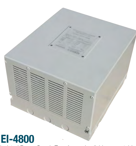
Isolated Power Supply Transformer (available separately) 4.8kVA - 240Va.c. in wall mountable Ventilated Cabinet