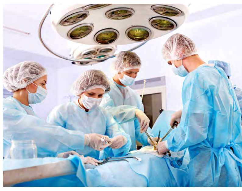
Operating Theatre Environments requiring vital protection and early indication

EI-4800 4.8kVA (40kg) EI-7200 7.2kVA (60kg)