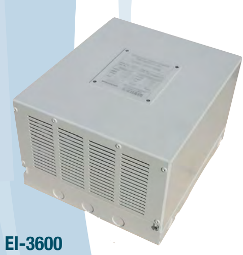
Isolated Power Supply Transformer (available separately) 3.6kVA - 240Va.c. in wall mountable Ventilated Cabinet

For an isolated supply system to remain effective, constant monitoring is necessary to ensure that the hard wired part of the system, or more commonly, the equipment plugged into the system are providing a partial or full path to earth