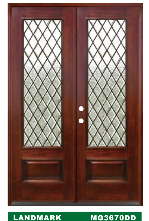
Glass: Ice Crystal Bevels w. Patina Caming Privacy Rating: 8 Unit Sizes: 60 1/2" x 93 1/4", 64 1/2" x 95 1/4"