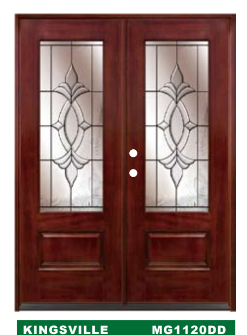
Glass: Decorative w. Patina Caming Privacy Rating: 6 Unit Sizes: 60 1/2", 62", 64 1/2" x 81 1/2"