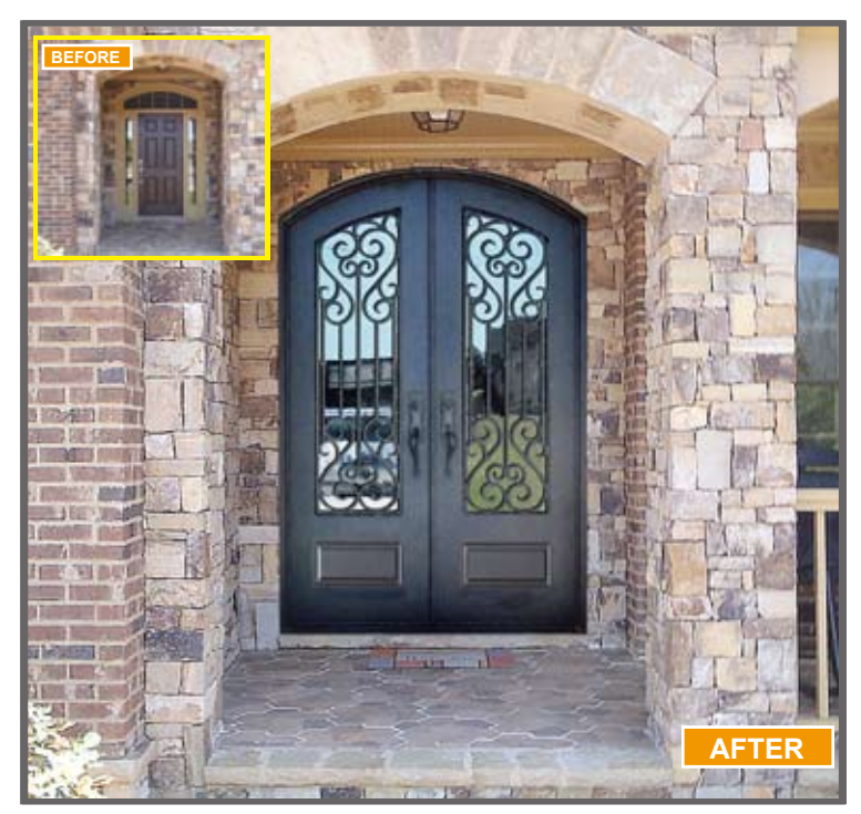
Sidelight unit w. segment transom replaced by an arch top double door IC9178DD (SPECIAL ORDER)