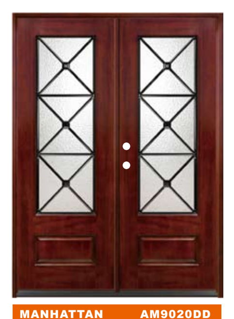
Glass: Low-E Ice Crystal w. External Grille Privacy Rating: 9 Unit Sizes: 60 1/2", 62" x 81 1/2"

MANCHESTER MG7020DD Glass: Low-E Ice Crystal w. Internal Grille Privacy Rating: 9 Unit Sizes: 60 1/2", 62", 64 1/2" x 81 1/2"