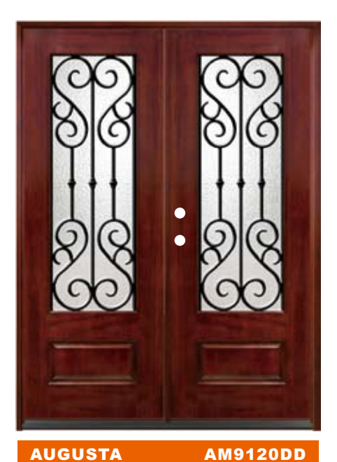
Glass: Low-E Ice Crystal w. External Grille Privacy Rating: 9 Unit Sizes: 60 1/2", 62" x 81 1/2"