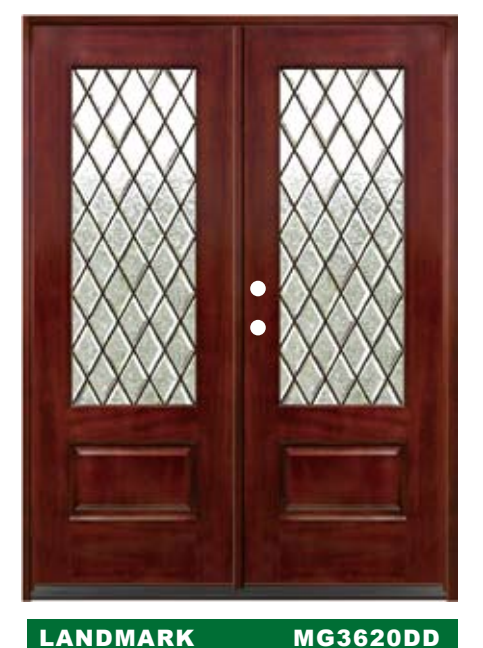
Glass: Ice Crystal Bevels w. Patina Caming Privacy Rating: 8 Unit Sizes: 60 1/2", 62", 64 1/2" x 81 1/2"

Glass: Low-E Hammered Privacy Rating: 9 Unit Sizes: 60 1/2", 64 1/2" x 81 1/2"