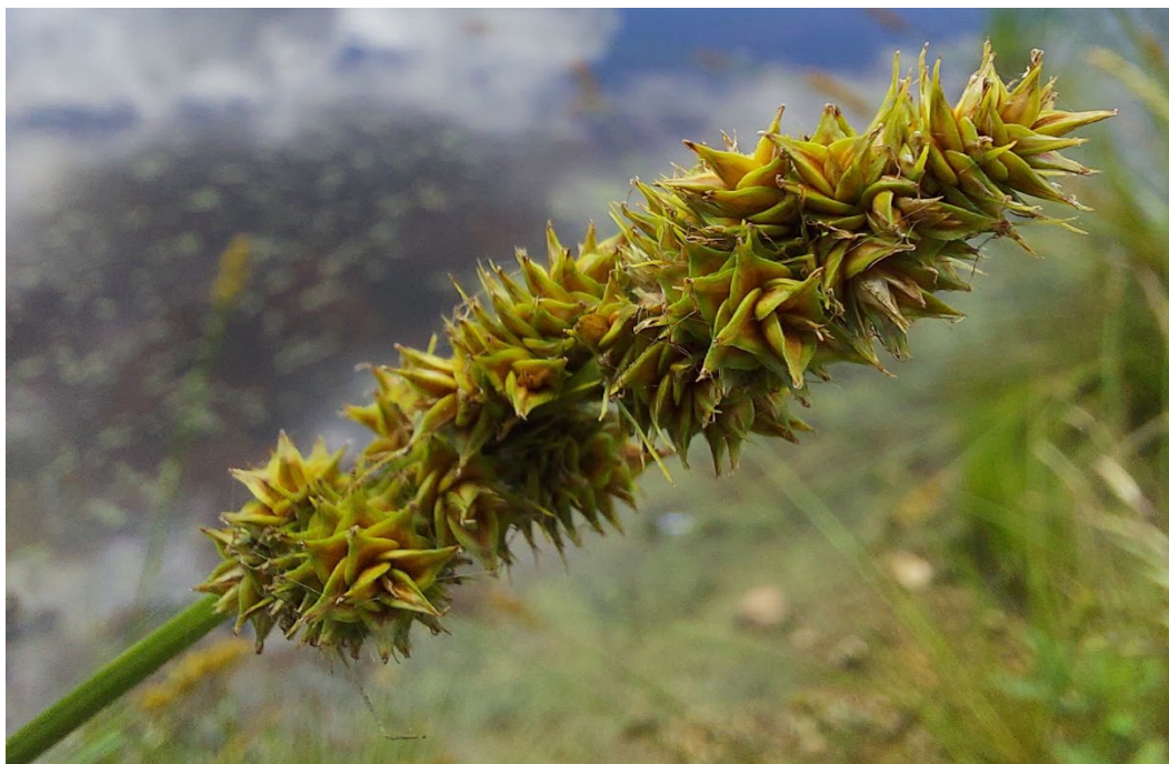
Figure 3. Compact inflorescence of Carex fissa var. fissa with yellow-green perigynia.