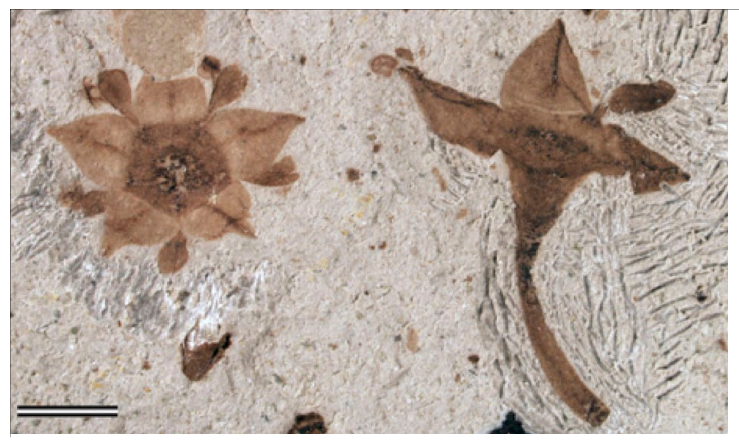
Notiantha grandensis, a fossil from Patagonia.