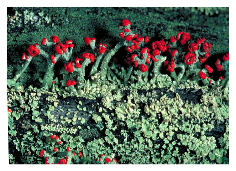
British Soldiers ( Cladonia cristatella ), a common lichen on lightly shaded logs in the Ozarks.

The elegance of this combination is that the combined entity transforms both components and functions as a distinct organism, with a unique structure, chemistry, appearance, and ecological behavior