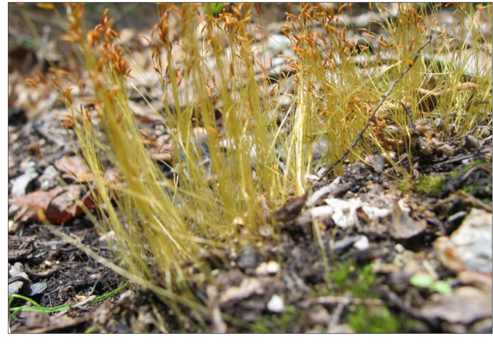
Yellow-stalked moss ( Ditrichum pallidum ) from Don Robinson State Park.