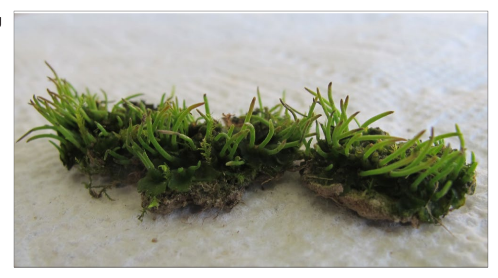
Hornwort from Babler State Park.