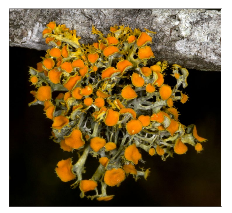
Gold-Eye Lichen ( Teloschistes chrysophthalmus), found scattered across Missouri, showing the bright orange apothecia, which produce the spores of the lichen fungus.