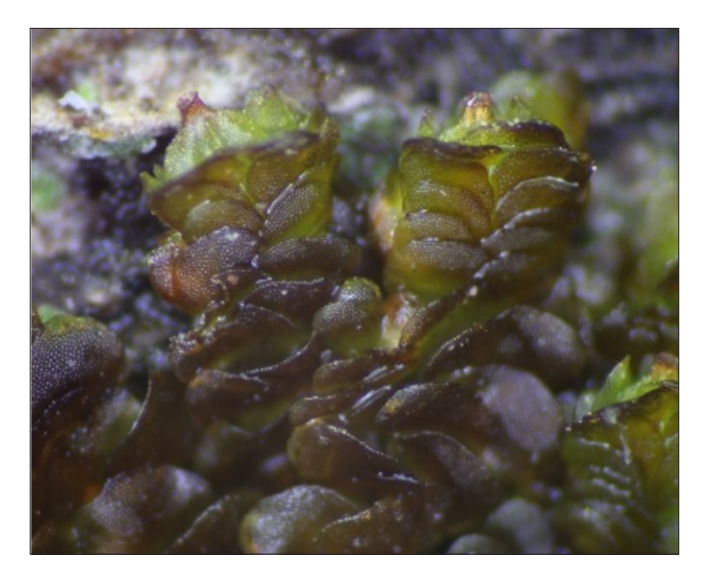
Leafy liverwort, Frullania stylifera.

Liverworts and hornworts are related to mosses in a group collectively known as bryophytes. Bryophytes lack roots and share similarities in their reproductive structures and life cycle. Compared to mosses, liverworts and hornworts are generally smaller plants. This makes them an inconspicuous component of the flora, unless numerous plants are discovered growing in clumps or mats. There are two major liverwort groups: leafy and thalloid. Leafy liverworts superficially look like mosses due to their leafy shoots. They differ, however, in that their leaves are arranged in two flat rows on the stem. Often, leafy liverworts also have a third row of much smaller leaves attached underneath the stem. In contrast, mosses have leaves evenly arranged around the stem. Thalloid liverworts