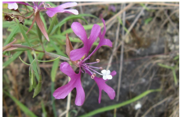
Clarkia pulchella - elk horns.

Many of the plants identified from the expedition have eponymous references to the two explorers, including: Linum lewisii (wild