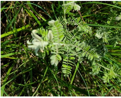
Also seen at Ragland Prairie: Amorpha canescens , lead plant