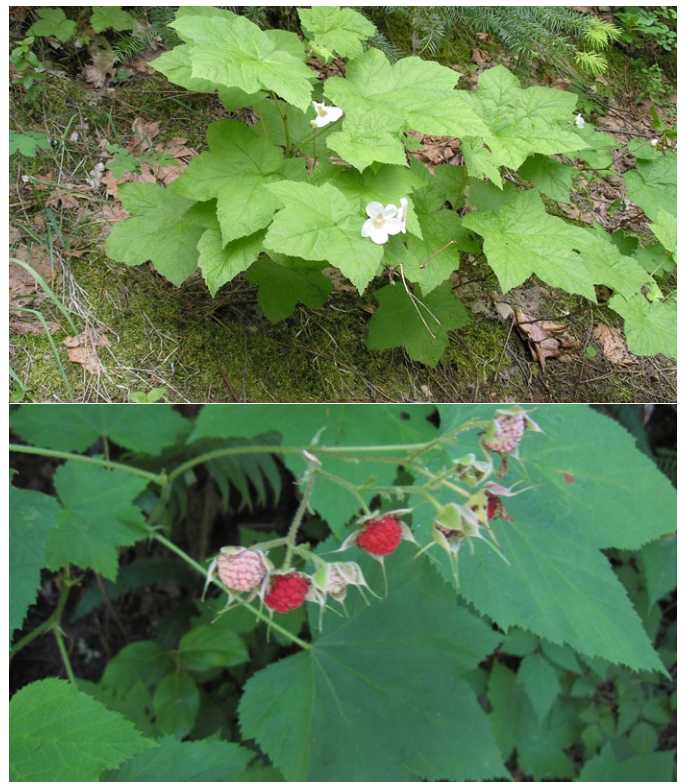
Thimbleberry: Rubus parviflorus Nuttall, 1818.