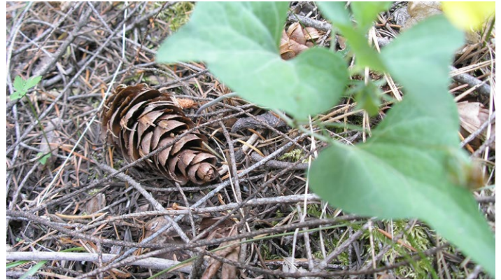
Douglas fir cone.

Mimosa quadrivalvis var. nuttallii – sensitive brier