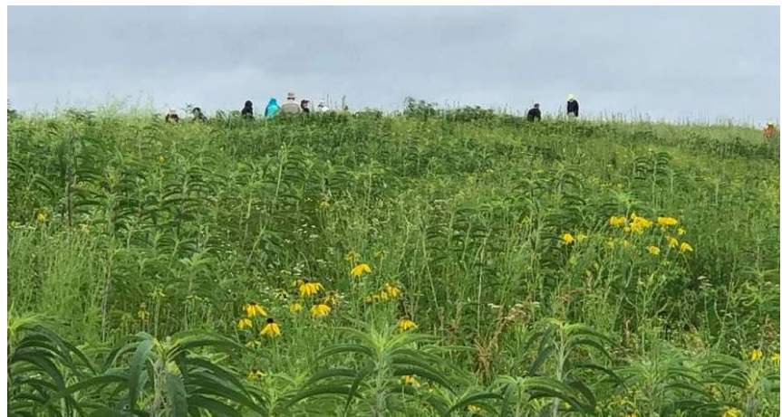
MONPS group at the top of Snowball Hill Prairie.

The first destination for Saturday was to Snowball Hill Prairie. The property is owned and managed by the Missouri Prairie Foundation and features a rather large hill within a relatively flat