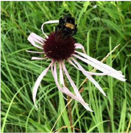
Pollinator (bumble bee) on a pale purple coneflower.