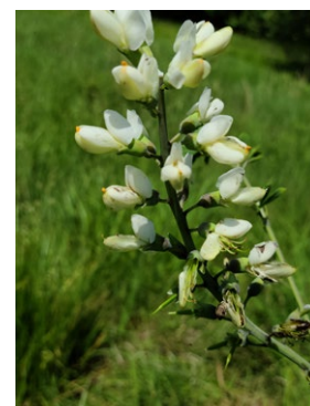
Left: Lobelia spicata , spiked lobelia; Right: Baptisia alba , white wild indigo