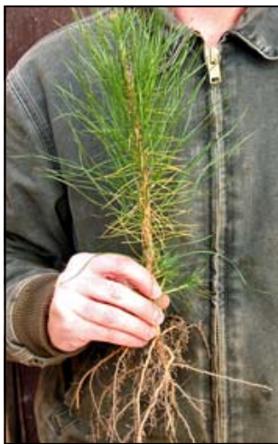
Pictured above: A sample of what a 2-3 year old seedling may look like.

A seedling is a bare root tree or shrub. We carry one, two and three year seedlings, depending on if it's a conifer, hardwood or shrub. Seedlings are shipped while dormant, without a root ball or soil, but are covered in a moist material or root dipped to retain moisture. A transplant is a seedling grown for a year or two, then replanted to another bed to allow for development of a fibrous root system and more branching. A rooted clump is a dormant rooted plant without top growth. It may not have leafing but is ready to grow!