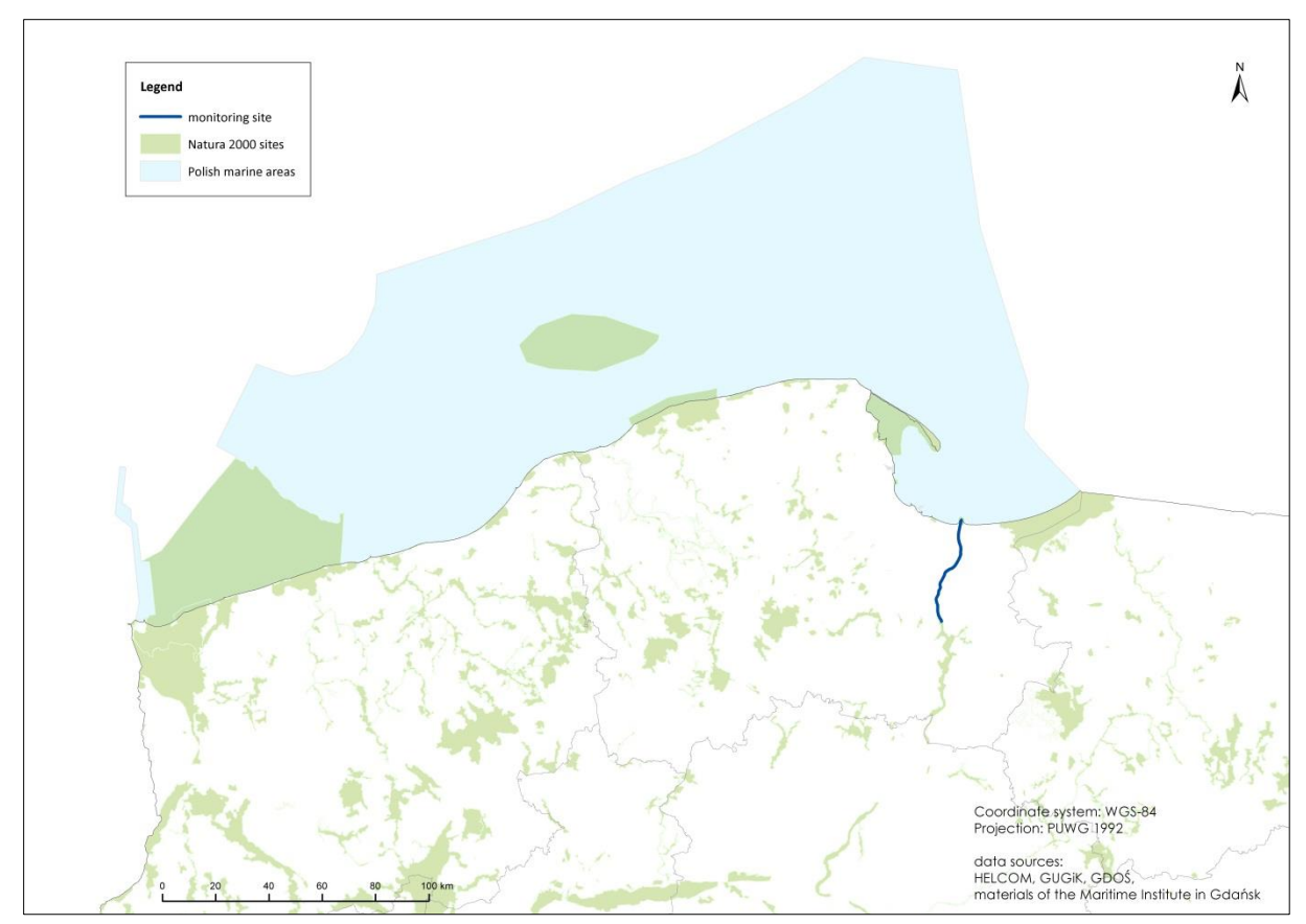
Fig. 2. Sites for the twaite shad monitoring