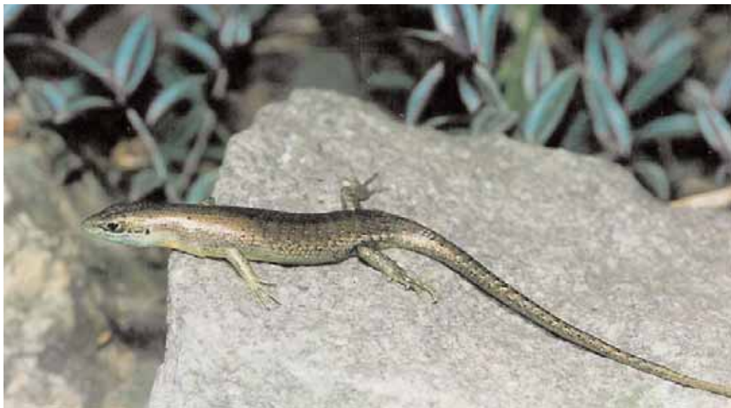
Figure 4: Photograph of live female of Trachylepis makolowodei (MNHN 1997.3078) from Ndakane, CAR.