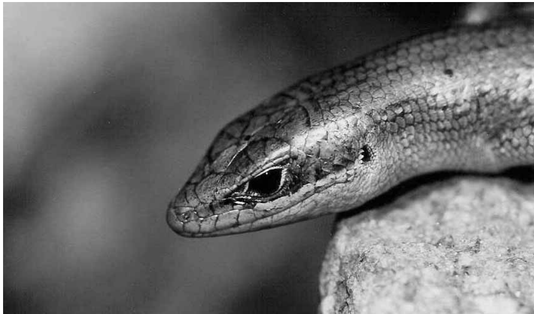
Figure 6: Trachylepis makolowodei female (MNHN 1997.3078) from Ndakane, CAR: head details.