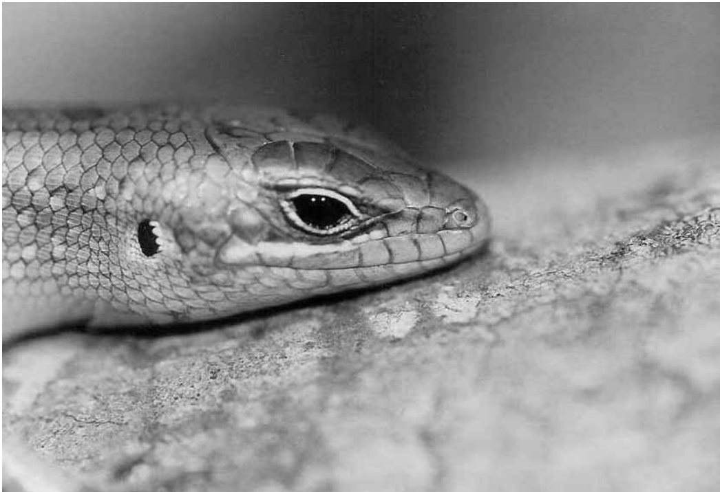
Figure 5: Trachylepis makolowodei male (MNHN 2005.2504, formerly CAMHERP 3433I) from Kika, Cameroon: head details.