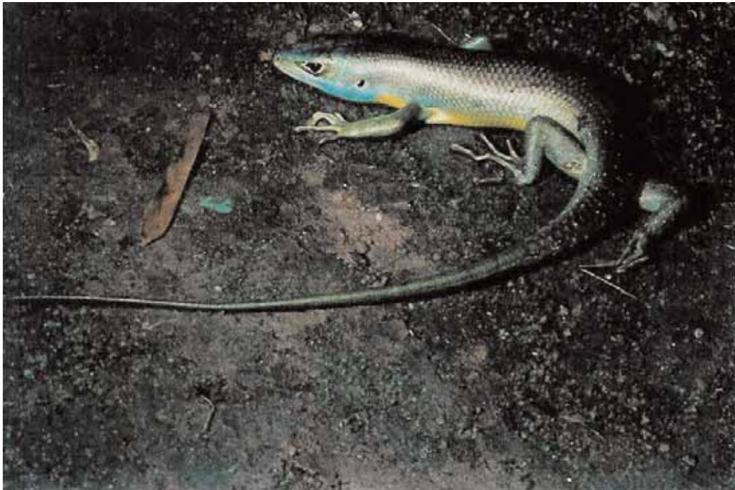
Figure 3: Photograph of live male of Trachylepis makolowodei (MNHN 2005.2504, formerly CAMHERP 3433I) from Kika, Cameroon.