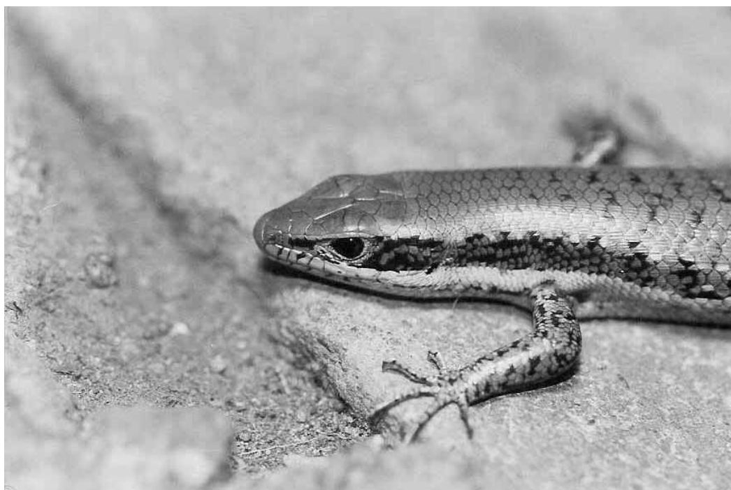
Figure 7: Photograph of anterior body area of a live Trachylepis polytropis .

dorsal keels in T. makolowodei vs. 5 to 11 (11 uncommon) in T. boulengeri ; higher SVL (up to 121 mm in T. makolowodei vs. only 93 mm in T. boulengeri [Broadley 1974]); higher head length to SVL ratio (20.90 to 24.39% in T. makolowodei vs. always less than 20% in T. boulengeri [Broadley 1974]); white punctuations on flanks in T. makolowodei lacking in T. boulengeri (Broadley 1974; Branch 1988); white band on supralabials in T. makolowodei , black band extended more posteriorly in T. boulengeri (Broadley 1974; Branch 1988). T. boulengeri is basically a savanna species, most commonly found in open habitats, including bamboo thickets and floodplain grassland.