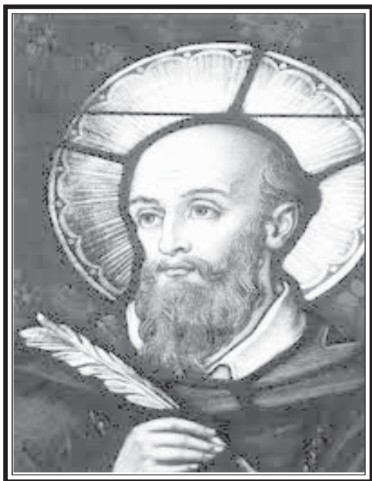
St. Francis De Sales Pray for us