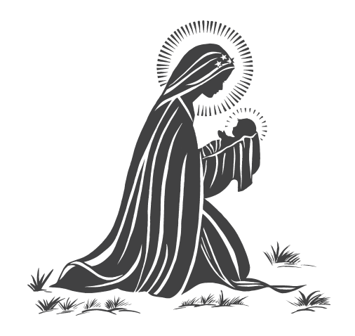
With Mary, Our Mother we enter the season of Advent to welcome the Lord into our Hearts and our Lives!