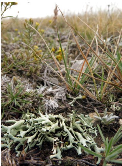
Left: Vagrant range lichens, like this common wide-lobed Xanthoparmelia chlorochroa , live unattached to soil or rock.