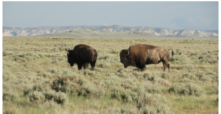
Post-meeting field trips will focus on native prairie plant communities.