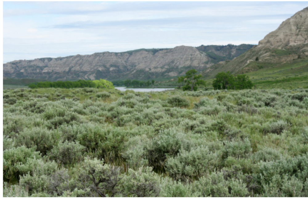
Artemisia tridentata ssp. wyomingensis on the Missouri River.