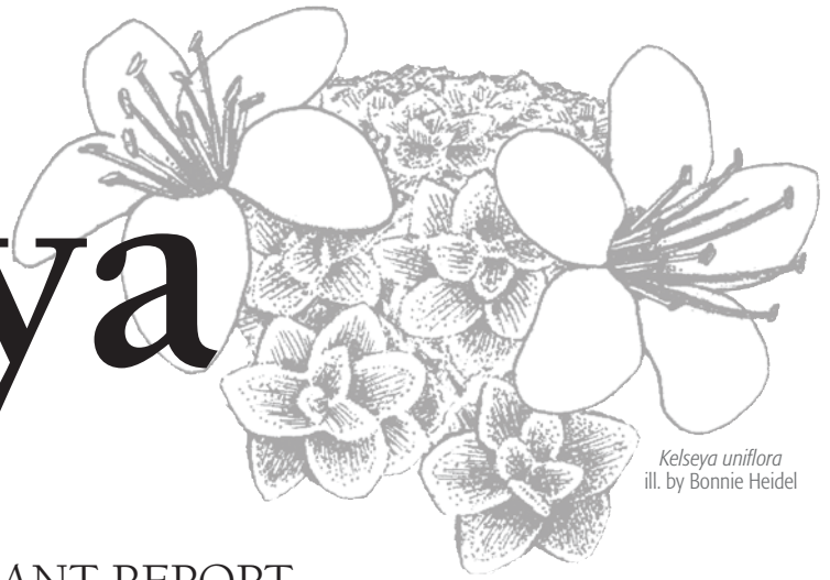
Kelseyia uniflora

Newsletter of the Montana Native Plant Society