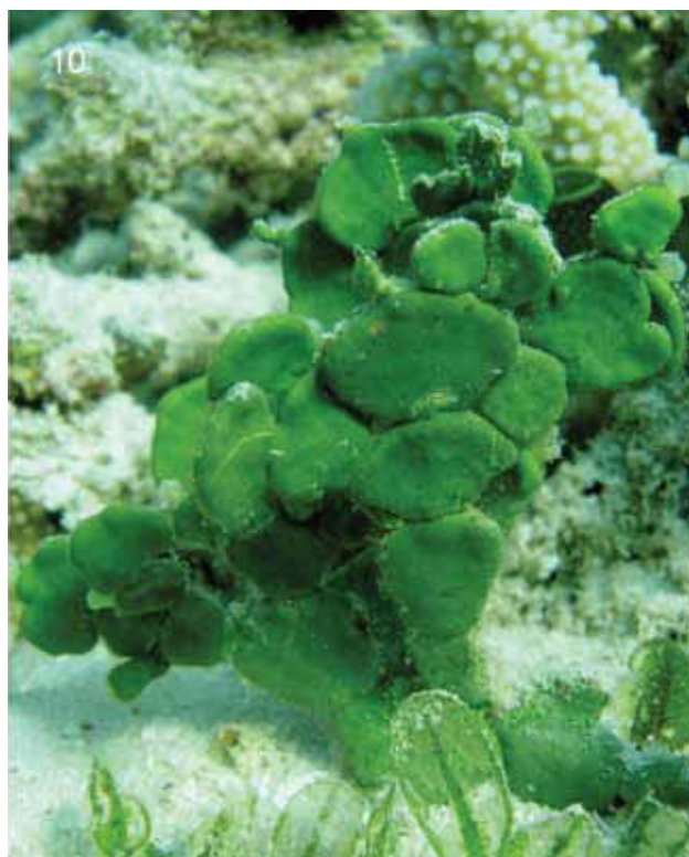
Figure 10 Halimeda macroloba , a species restricted to sandy habitats