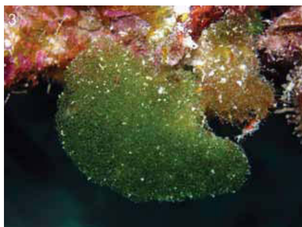
Figure 3 Rhipilia nigrescens , a spongy green alga found in reef front habitats.

Representative specimens were collected from each location and preserved in 5% Formalin/seawater (2006 surveys) or pressed directly on herbarium sheets on-site (2007). These specimens have been lodged in the State Herbarium (PERTH). Additional material was also preserved in 100% Etoh (green algae) or dried in silica gel (red algae) for DNA analysis. Locations visited during the URS 2006 survey are listed in Table 2. Table 5 gives the presence of individual taxa at each location observed during the WA Museum survey of 2006.