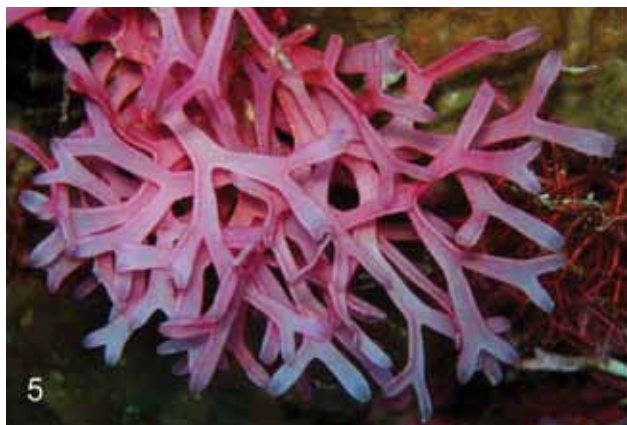
Figure 5 Dichotomaria marginata , generally in reef front habitats.