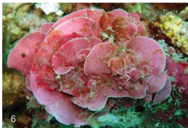
Figure 6 Rhizolamellia collum , restricted to dark crevices on reef fronts