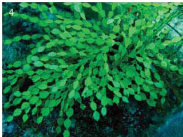
Figure 4 Halimeda minima , common in shaded areas in most habitats.