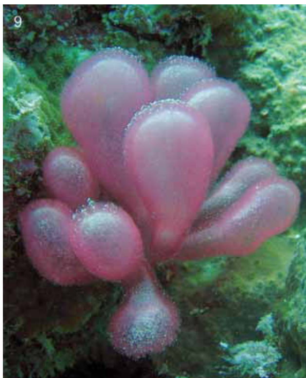
Figure 9 Gibsmithia hawaiiensis , an unusual gelatinous red alga.

The Indo-Pacific algal flora is very diverse and covers a large area. Some subsets of the region are regarded as biodiversity hotspots, for example the Philippines with some 900 species recorded (Silva et al. , 1987), but this high diversity often also reflects collection effort. Macroalgal studies in some regions have been ongoing for over a century (e.g. Indonesia, beginning with Weber-van Bosse & Foslie 1904) and these regions continue to be studied by primarily European botanists (e.g.