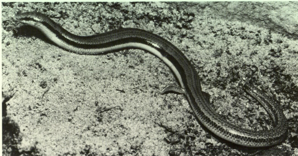
Figure 1 A paratype of Lerista simillima from Ellendale.

Upper surfaces pale brown. Head sparsely to moderately spotted with dark brown. Back and tail with two paravertebral lines of small dark brown spots. Wide blackish-brown upper lateral stripe from nostril to end of tail. Ventral and lower lateral surfaces whitish.