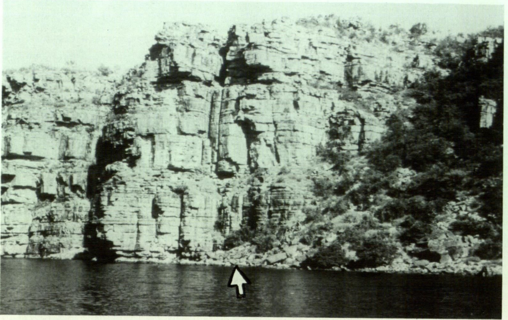
Figure 2 Type locality of Pseudamia nigra (arrow indicates where holotype collected).

notched anteriorly, lying in front of posterior nostril by a distance about equal to half pupil diameter.