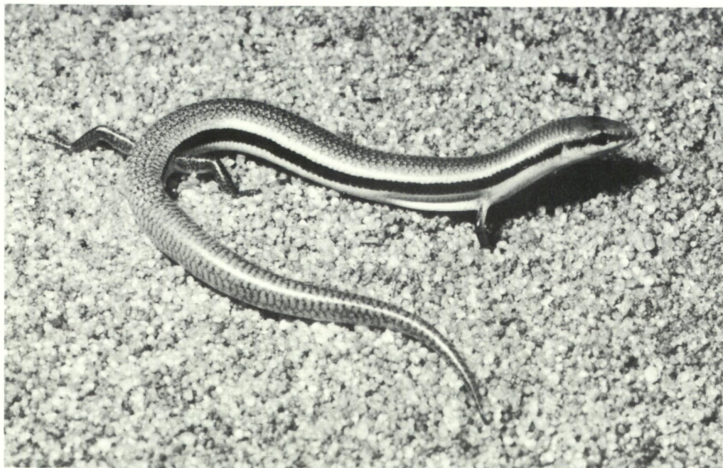
Figure 3 Holotype of Lerista aericeps taeniata , photographed in life by R.E. Johnstone.