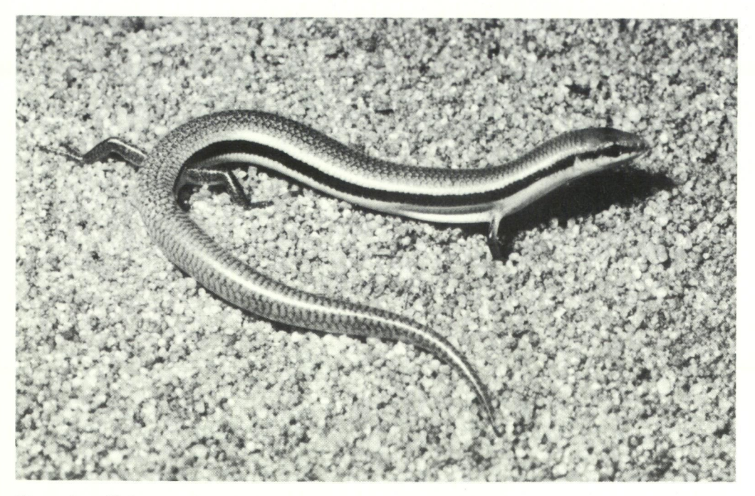
Figure 3 Holotype of Lerista aericeps taeniata, photographed in life by R.E. Johnstone.