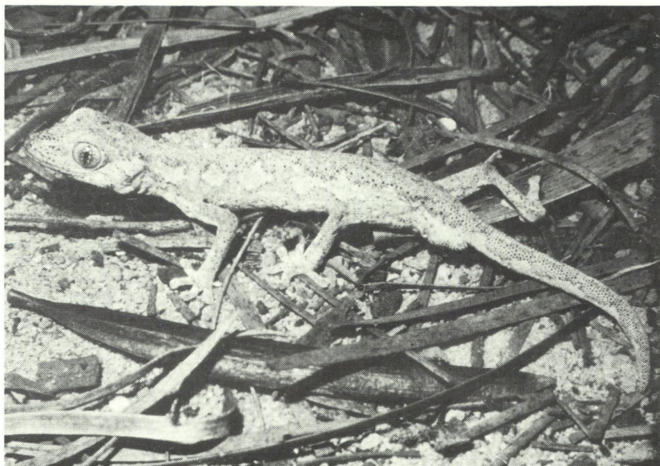
Plate 1: Holotype of Diplodactylus rankini.

Upper west coast of Western Australia. Active at night in trees and shrubs on white coastal dunes.