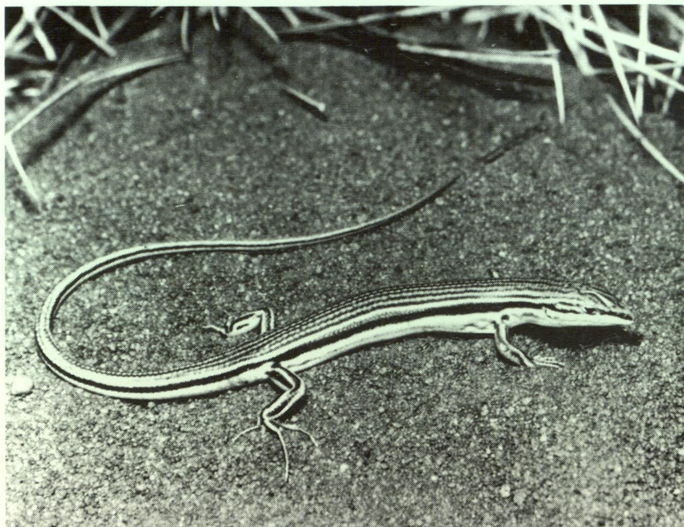
Plate 2: Holotype of Ctenotus colletti rufescens photographed in life by T.M.S. Hanlon.