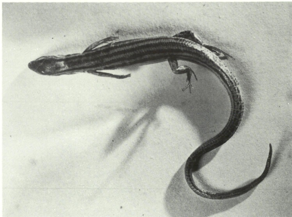
Plate 4: Photograph of holotype of Notoscincus butleri .

Dorsal and lateral ground colour dark brown. Back and sides with 8 subequally wide pale stripes: on each side a pale brown paravertebral and