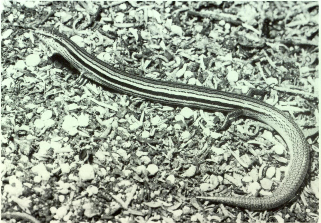
Figure 3 A Lerista dorsalis from Eucla, photographed in life by G. Harold.

with 0-3 (usually 2) grey longitudinal lines or series of dots. Limbs dark brown mottled with brownish-white. Under head and body whitish, ventrals usually edged with grey. Under tail pink, usually immaculate, sometimes spotted sparsely with brown.