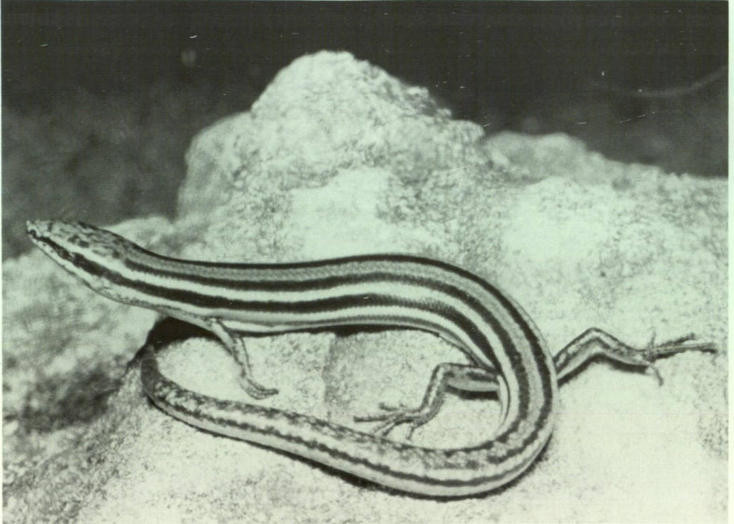
Figure 1. A Lerista m. microtis from Torbay Head