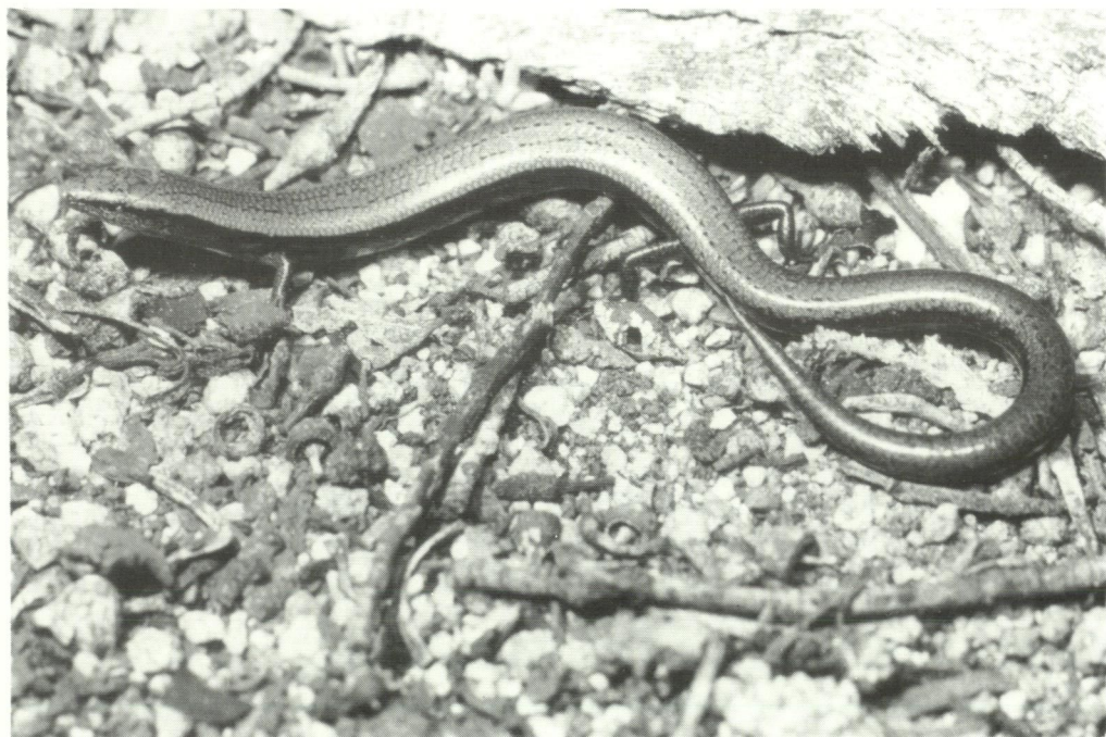
Figure 3. Holotype of Lerista viduata photographed in life by D. Robinson.

Only known from the Ravensthorpe Range in the semiarid southern interior of Western Australia.