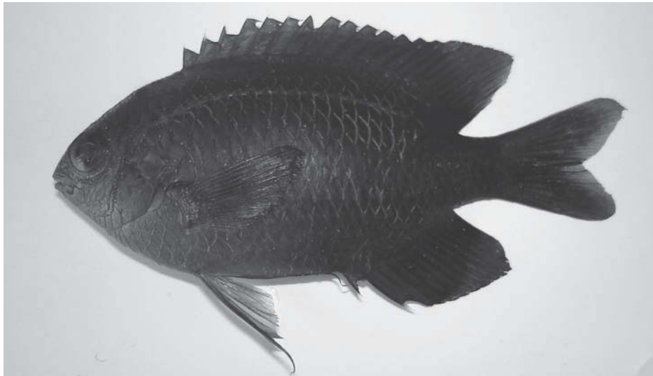
Figure 2 Pomacentrus fakfakensis sp. nov., holotype, 52.2 mm SL, Karawatu Island, Papua Barat Province, Indonesia.