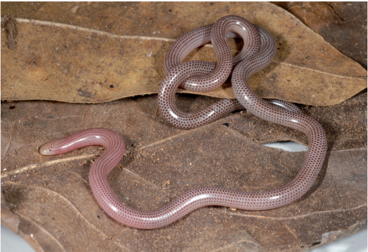
FIGURE 4 Ramphotyphlops exocoeti . Length 300 mm..

forest typical of the deep soiled plateau (Claussen 2005). The dominant understorey species was Pandanus elatus and the dominant canopy species were Inocarpus fagifer and Pisonia umbellifera . The emergent species Syzygium nervosum and Hernandia ovigera were present (Figure 2). Canopy cover was calculated as 85% using Gap Light Analyzer 2.0. Leaf litter was present, but not abundant, and bare soil was exposed (Figure 3).