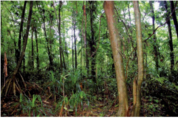
FIGURE 2 Tall closed canopy forest at the capture site.