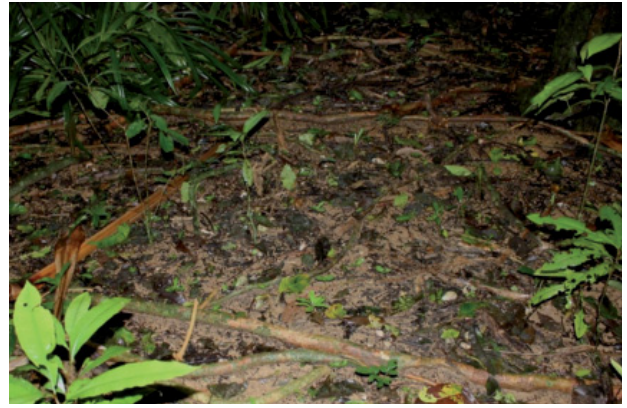
FIGURE 3 Forest floor at the capture site.