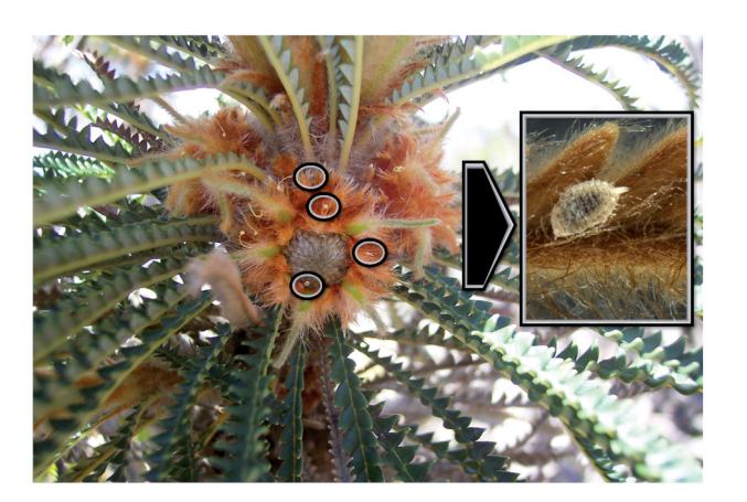
FIGURE 3 Mealybugs of Pseudococcus markharveyi sp. nov. (circled) in situ on the host plant Banksia montana.

Australia: Western Australia: 2 adult females (2 slides), same data as holotype (1 in ANIC, 1 in WAM E83773); 3 adult females (including DNA voucher LGC01999: 3 slides), Stirling Range National Park, Bluff Knoll summit, 1039 m, 34°22'50.6"S, 118°15'02.1"E, 16 February 2012, M.C. Leng and F. Bokhari, 'Bluff