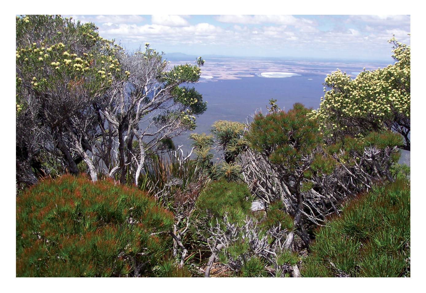
FIGURE 2 The Eastern Stirling Range Montane Heath and Thicket threatened ecological community at the summit of the eastern massif, featuring B. montana in the centre.