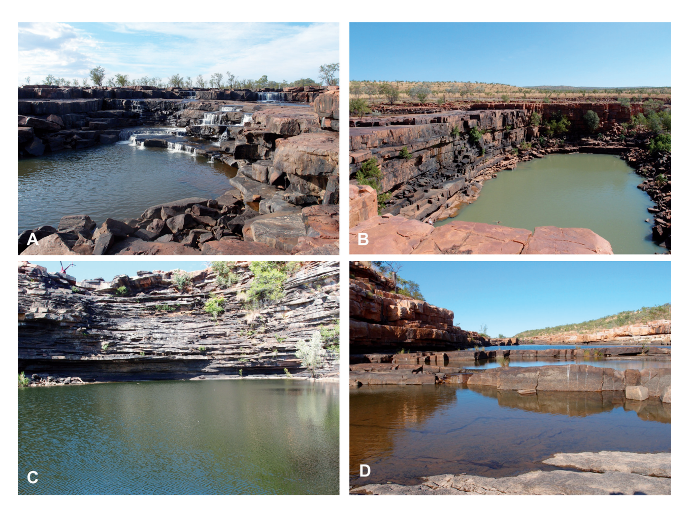
FIGURE 2 A. Durack Falls (Station BBK-14-005); B. Bindoola Falls; C. Oomaloo Falls (Station BBK-14-007); D. Cascades in Salmond Gorge (Station BBK-14-012)

for each site included physical characteristics, habitat components and water quality (Table 1).