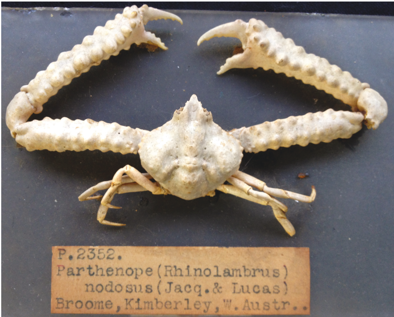
FIGURE 2 The oldest specimen in the dataset, Nodolambrus nodosa (Jacquinot, in Jacquinot & Lucas, 1853), collected near Broome in 1909 by Arthur Male.