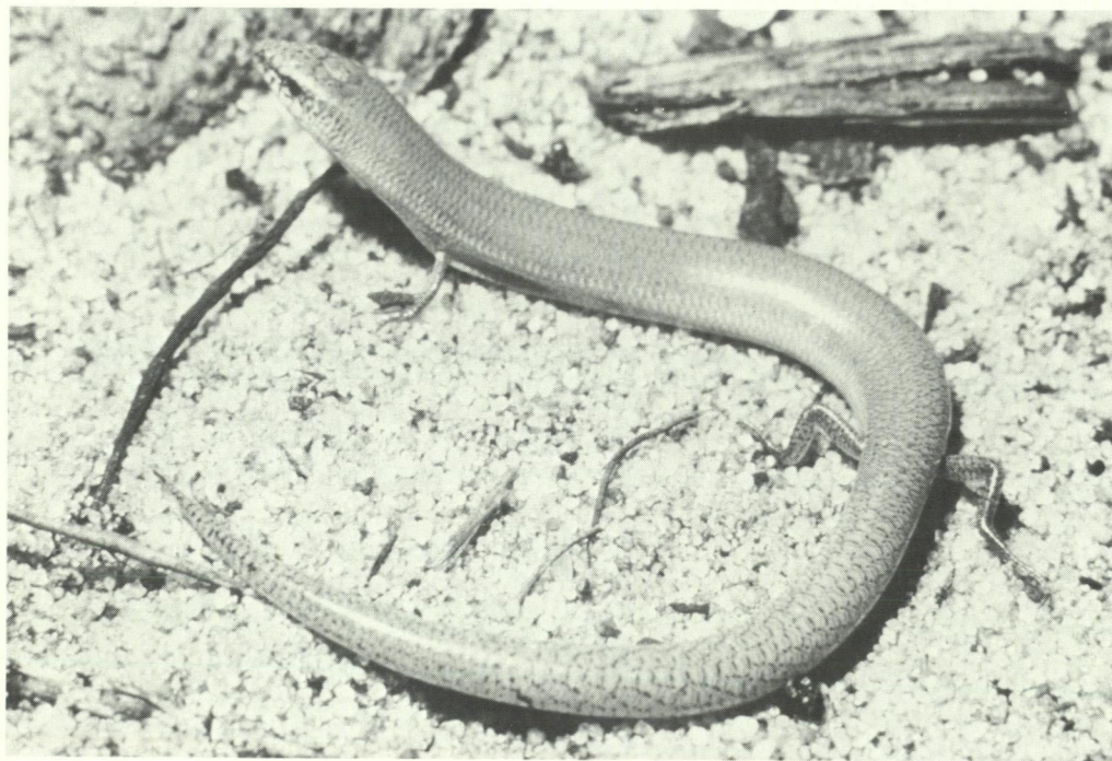
Figure 2 Holotype of Lerista haroldi , photographed in life by G. Harold.

R81199 in Western Australian Museum collected by G. Harold and C. Winton on 20 May 1982 at 0.5 km S of Gnaraloo HS, Western Australia, in 23°49'S, 113°31'E.