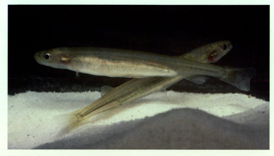
Figure 1 The spotted minnow (Galaxias maculatus).