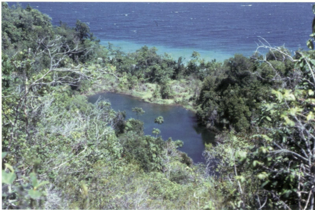
Figure 7 Lagoon, south-west corner of island.