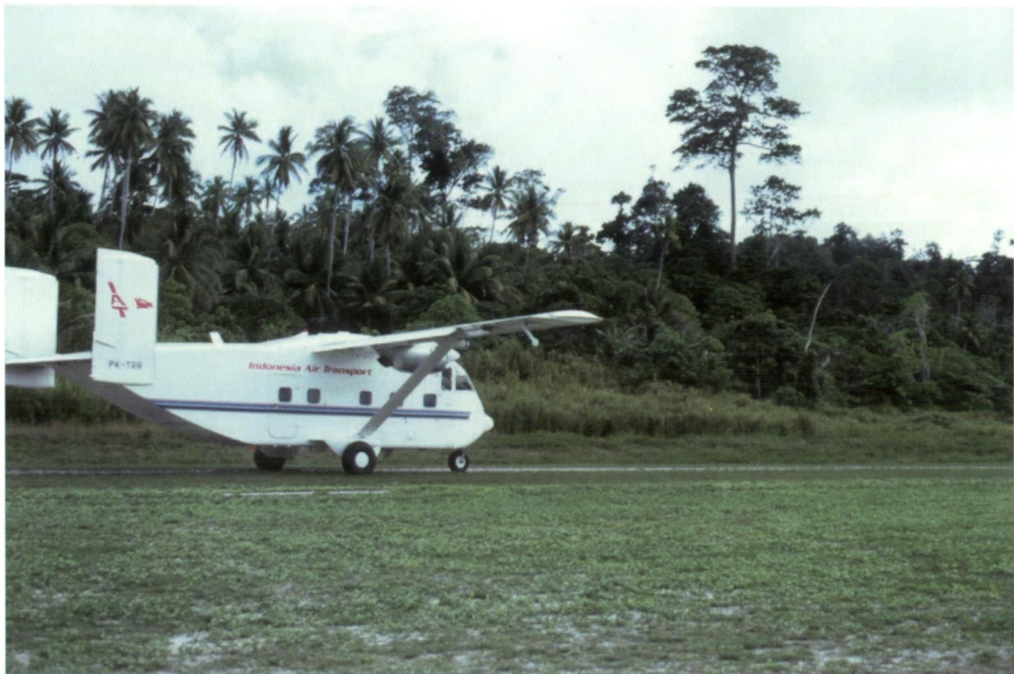
Figure 3 Airstrip with rank herbage and kebun.