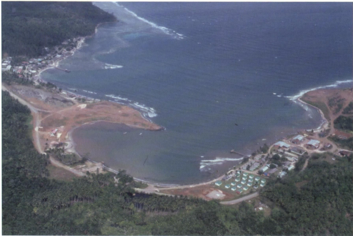
Figure 2 Gambir Bay, with BHP Camp on right and village backed by kebun on left.