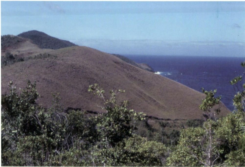
Figure 6 Grassland of Alang alang south of Camp 2.