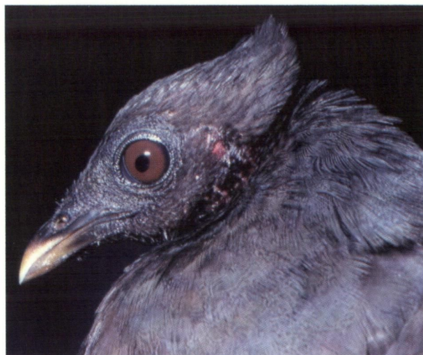
Figure 8 Dusky Scrubfowl Megapodius f. freycinet .

Common to very common. Mainly ones and twos occasionally small groups (up to five). Most numerous in beach vegetation especially on north end of island; also disturbed volcanic forest;