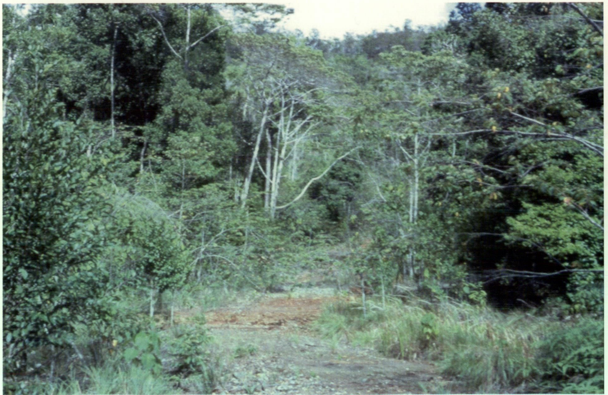
Figure 5 Disturbed volcanic forest along track to Turtle Beach.

Gag Island has a tropical monsoon type climate, characterised by year-round moderate temperatures and high relative humidity. Its climate is influenced by the south-east trade winds from May to October and the north-west monsoons from December to April. The wet season (north-west monsoon) begins in October, peaks in December-January and may continue until April. Mean daily temperatures vary between about 21° and 34° C.