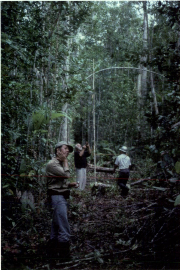
Figure 4 Rainforest near pit 8.