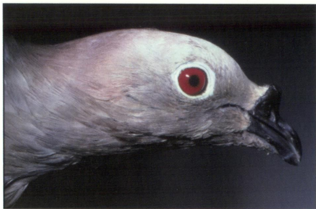
Figure 9 Spice Imperial Pigeon Ducula myristicivora .

eight). Mainly primary volcanic forest, disturbed volcanic forest, ultrabasic valley forest and tall beach vegetation; less frequently in kebun and mangrove forest. Mostly seen feeding in the canopy on fruits and berries. Often observed perched on high bare branches or in powerful direct flight above the forest. Voice a loud guttural 'urwoow'.