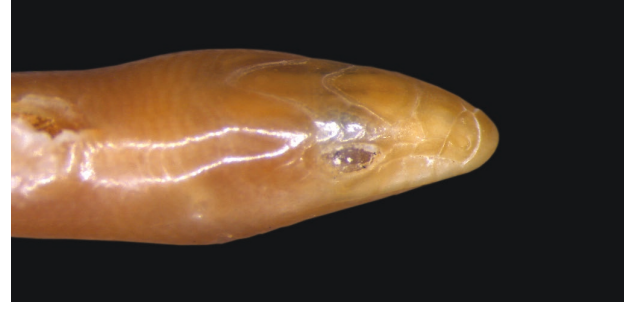
FIGURE 2 Left and right views of the head of the holotype of Lerista talpina. Note the appearance of the 'sunken eyes' — presumably a diagnostic character but also potentially from desiccation during the preservation process.