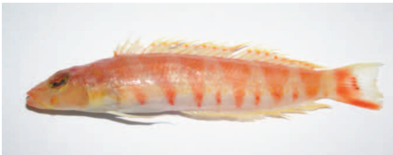
Figure 1. Holotype of Parapercis flavolabiata , QM I.37762, 84 mm SL, male.

Lateral line continuous, ascending smoothly from opercle to below 2nd or 3rd soft dorsal-fin ray, then approximately following contour of back; scales ctenoid, except for those on nape, cheeks, breast, midline of belly, and some anteriorly on opercle and posteriorly on base of pectoral fins, those on middle of sides with about 36 cteni; scales on cheek extending forward approximately to a line between middle of eye and posterior tip of maxilla; no scales on dorsal, anal or pelvic fins; 2 or 3 rows of small cycloid scales on base of pectoral-fin rays; elongate ctenoid scales densely arranged on proximal two-thirds of caudal fin.