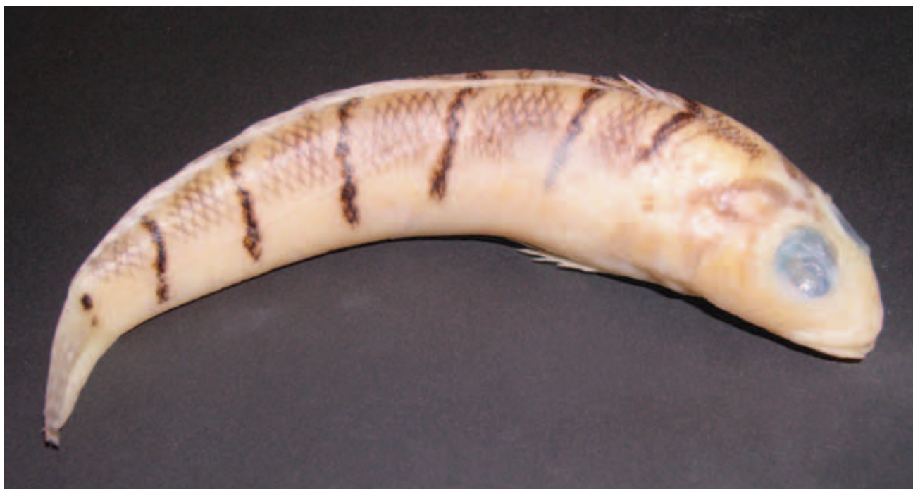
Figure 3. Holotype of Parapercis sexlorata , QM I.33274, 120 mm SL, male.