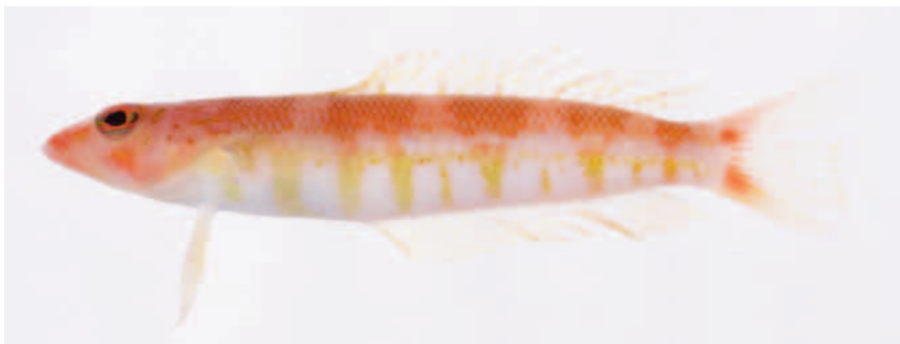
Figure 6. Parapercis colemani, NMV A.25112-003, 84 mm SL.

Colour fresh. Based on colour photograph of paratype, QM I.37579 (fig. 4), pale-pink on head and body, with 6 transverse black bars and a black spot on upper corner of caudal-fin base. Each bar produced ventrally in dusky-yellow. Belly and breast shading ventrally to pinkish-white. Scales above lateral line in area between each transverse bar and between last bar and caudal spot with distinct dusky margins, producing a reticulate pattern. A narrow pink border, devoid of dusky-edged scales, around each transverse bar. Much of pectoral-fin base, postorbital and opercle diffusely dusky, infused with yellow. Upper lip dark orange-yellow, lower lip white. Spinous dorsal fin dusky grey. Soft dorsal-fin rays orange anteriorly, some wavy oblique orange lines visible posteriorly, membrane mostly translucent. Inner pelvic-fin rays dusky at midsection, whitish at base, yellowish distally. Anal fin faintly orange. Caudal fin mauve with about 7 narrow wavy vertical orange-yellow lines.