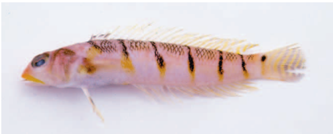
Figure 4. Paratype of Parapercis sexlorata , QM I.37579, 84.5 mm SL.

3.4 (2.75–3.1) in HL; eyes directed as much dorsally as laterally, bony interorbital space narrow, 11.9 (11.65–15.7) in HL; caudal-peduncle depth 2.7 (2.6–3.0) in HL; caudal-peduncle length 3.4 (3.0–3.65) in HL.