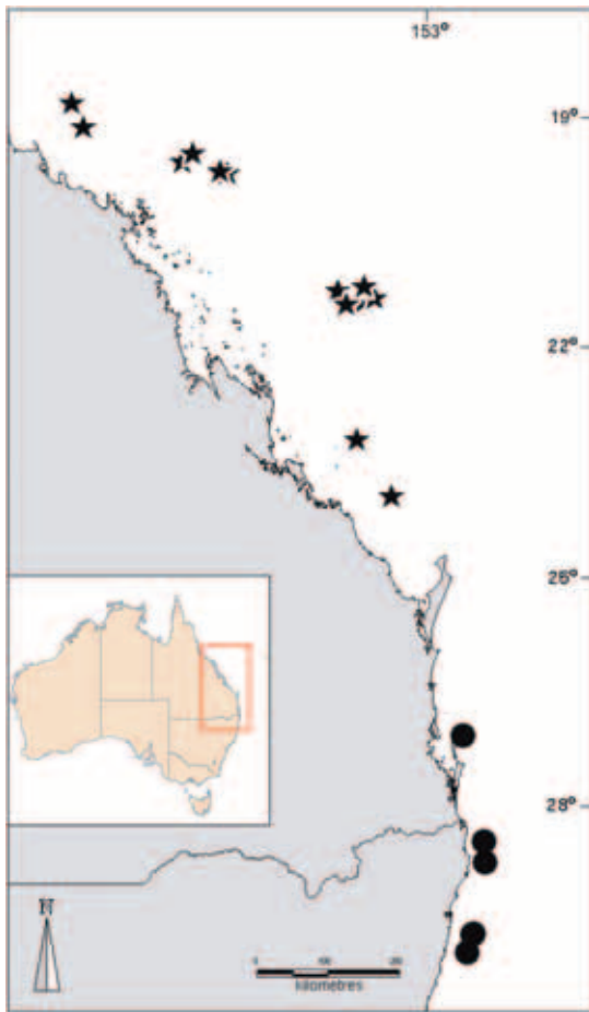
Figure 5. Distribution of Parapercis flavolabiata and P. sexlorata based on specimens examined.

crescentic outer row of about 7 robust conical teeth, medial teeth largest, several smaller adjacent teeth posteriorly; palatines with row of about 7 robust conical teeth and several closely spaced additional teeth near midsection of row. Tongue spatulate with broadly rounded tip, covered with numerous minute papillae.