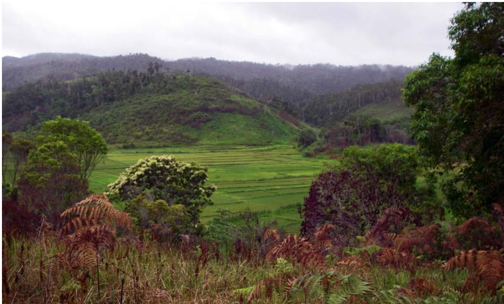
Figure 3. View of the surroundings of the fragmented Mahasoa forest, the type locality of Paracontias kankana sp. nov.

Distribution, habitat and habits. —The single known specimen of Paracontias kankana was captured in a pit fall trap with drift fences in a heavily disturbed, unprotected forest fragment, locally called Mahasoa forest (Fig. 3), next to Ambatodisakoana village, located east of the northeastern edge of the Alaotra Lake. However, comparisons of a fragment of the 16S gene of the holotype of P. kankana with 16S sequences of other species of Paracontias